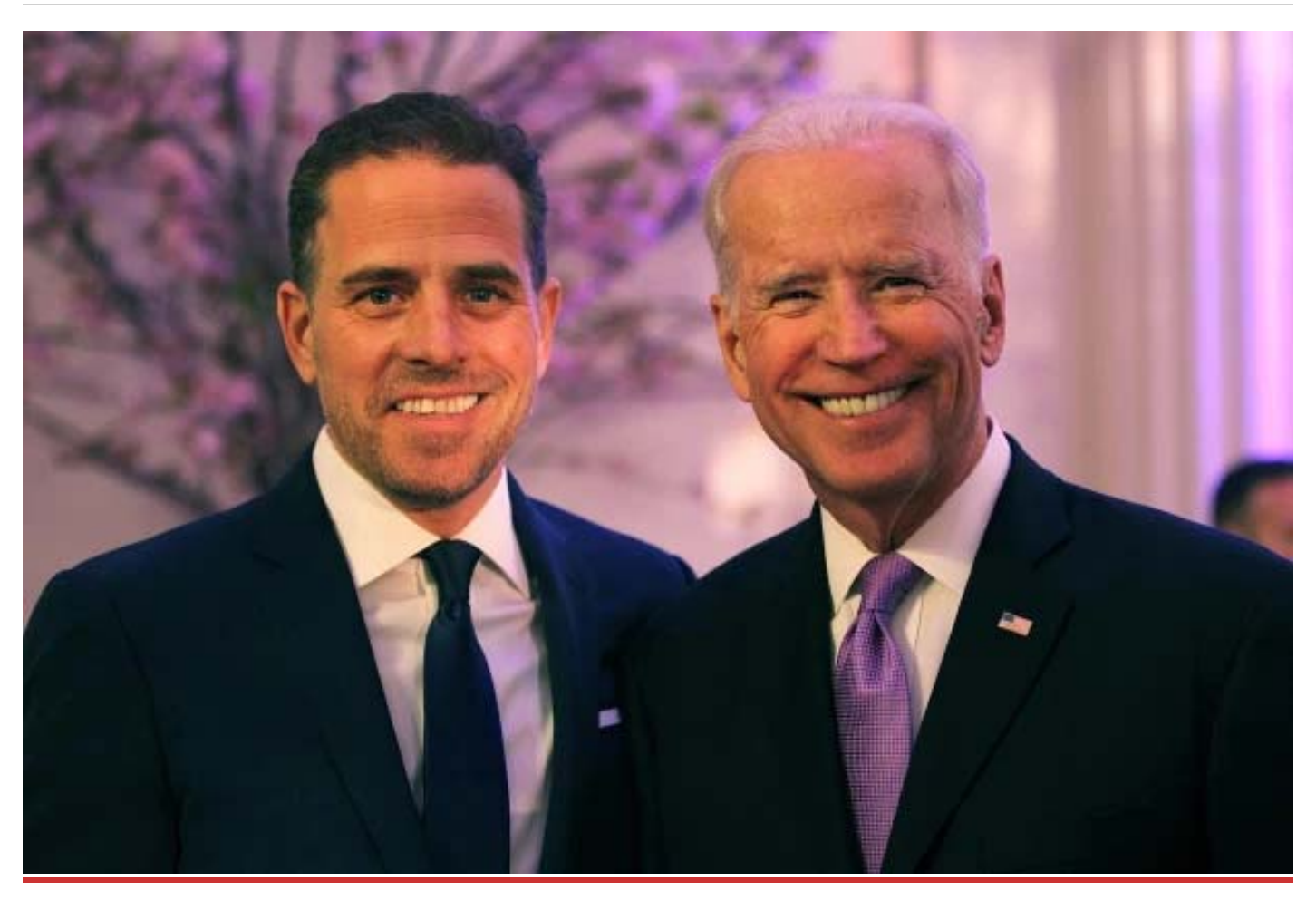
Hunter and Joe Biden