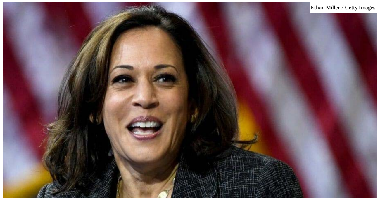
Democratic presidential candidate Sen. Kamala Harris of California speaks during the 2020 Gun Safety Forum hosted by gun control activist groups Giffords and March for Our Lives on Oct. 2, 2019, in Las Vegas.