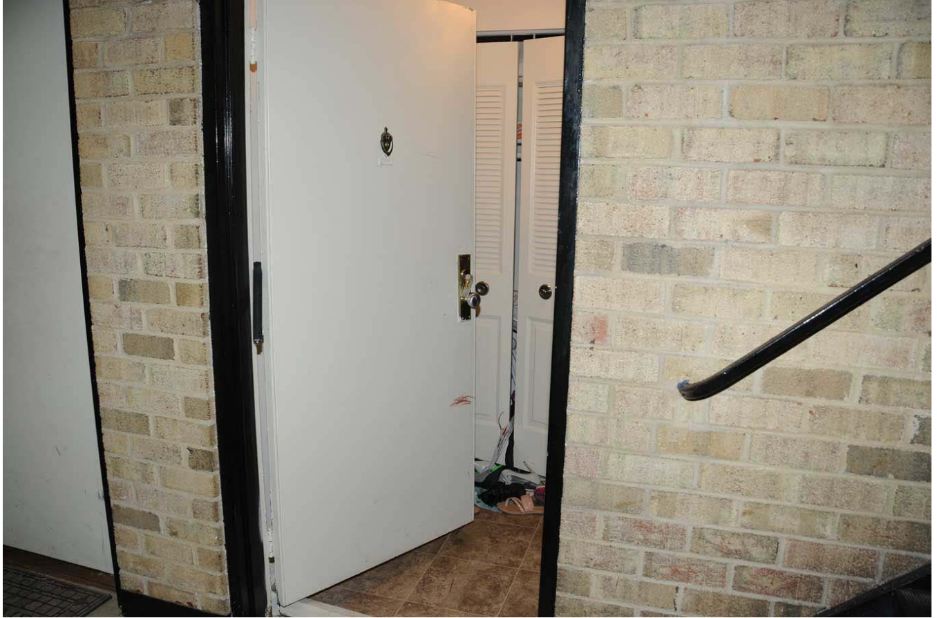
The front door of Korryn Gaines' apartment