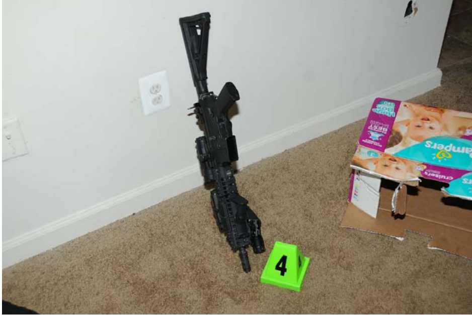
Still of officer's gun, pampers