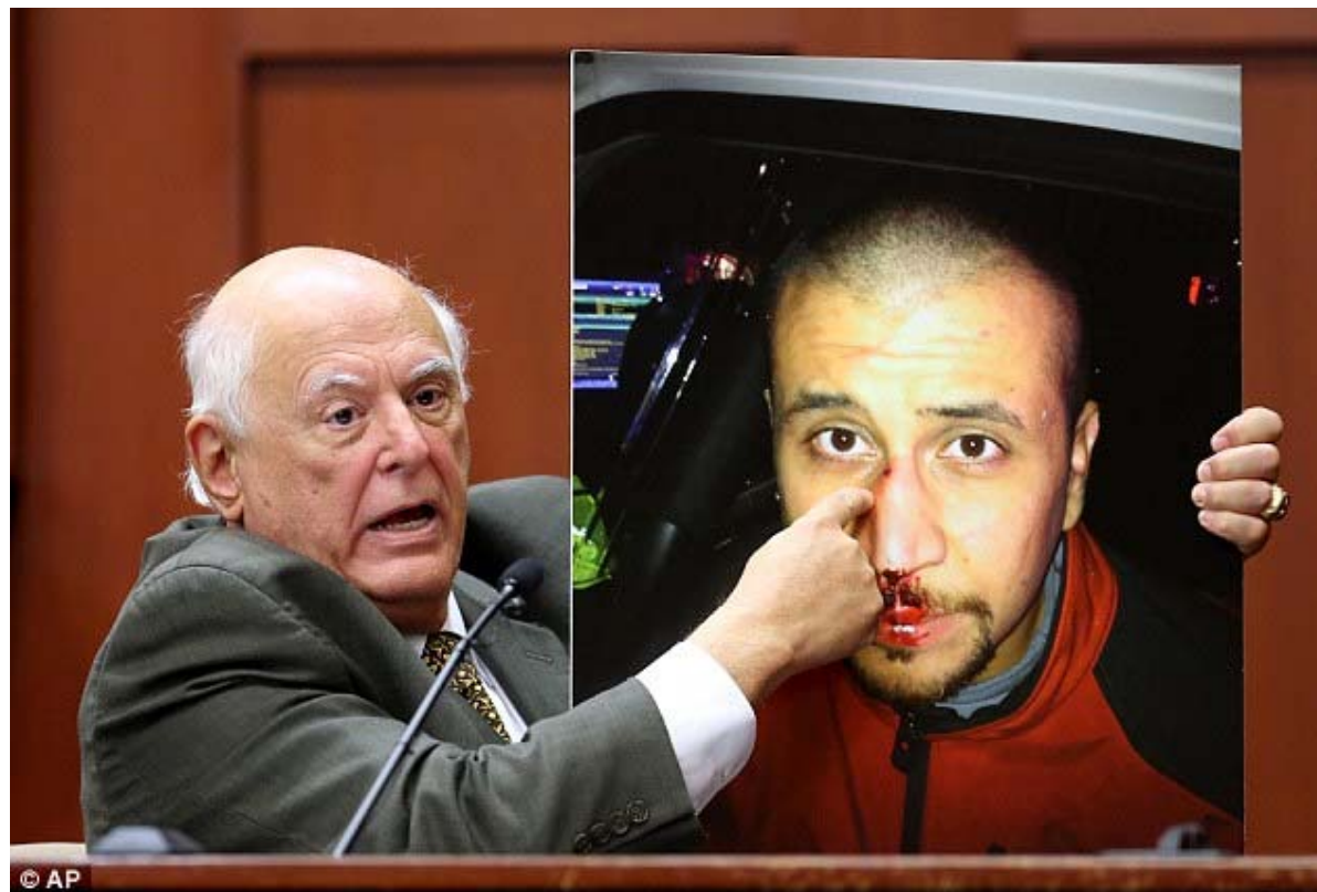
Defence witness: Dr Vincent di Maio, a forensic pathologist and gunshot wound expert, describes George Zimmerman's injuries which he said were consistent with his head being banged against concrete

Defense expert Vincent DiMaio testified Martin could have moved his arms in the 10 to 15 seconds he would have been conscious after being shot in the heart.