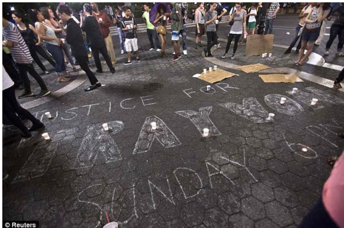
Public feeling: Crowds gather in Union Square, New York, to wait for the verdict in the trial