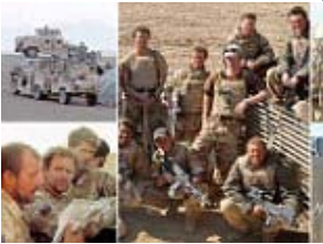
The bloody day Harry was witness to an horrific war crime:...