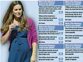
Royal baby 'needs a stay-at-home mum': Don't have nanny, cut...