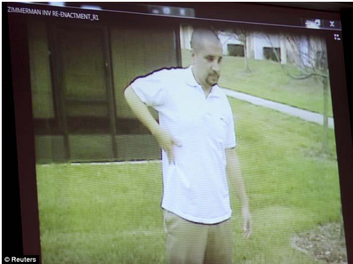
Reenactment: The jury had been shown a video of Zimmerman explaining his version of events