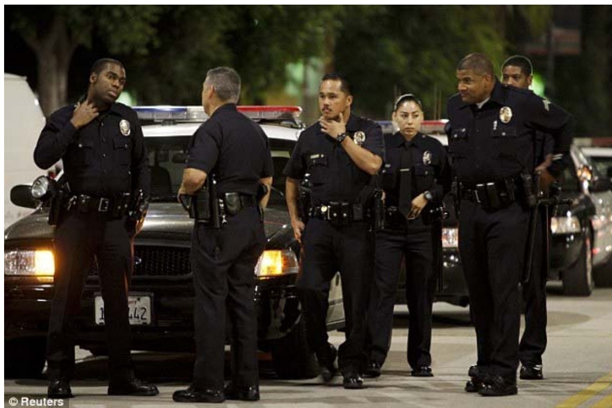
On guard: Los Angeles police gather at the edge of a rally that began as Zimmerman was cleared of all charges