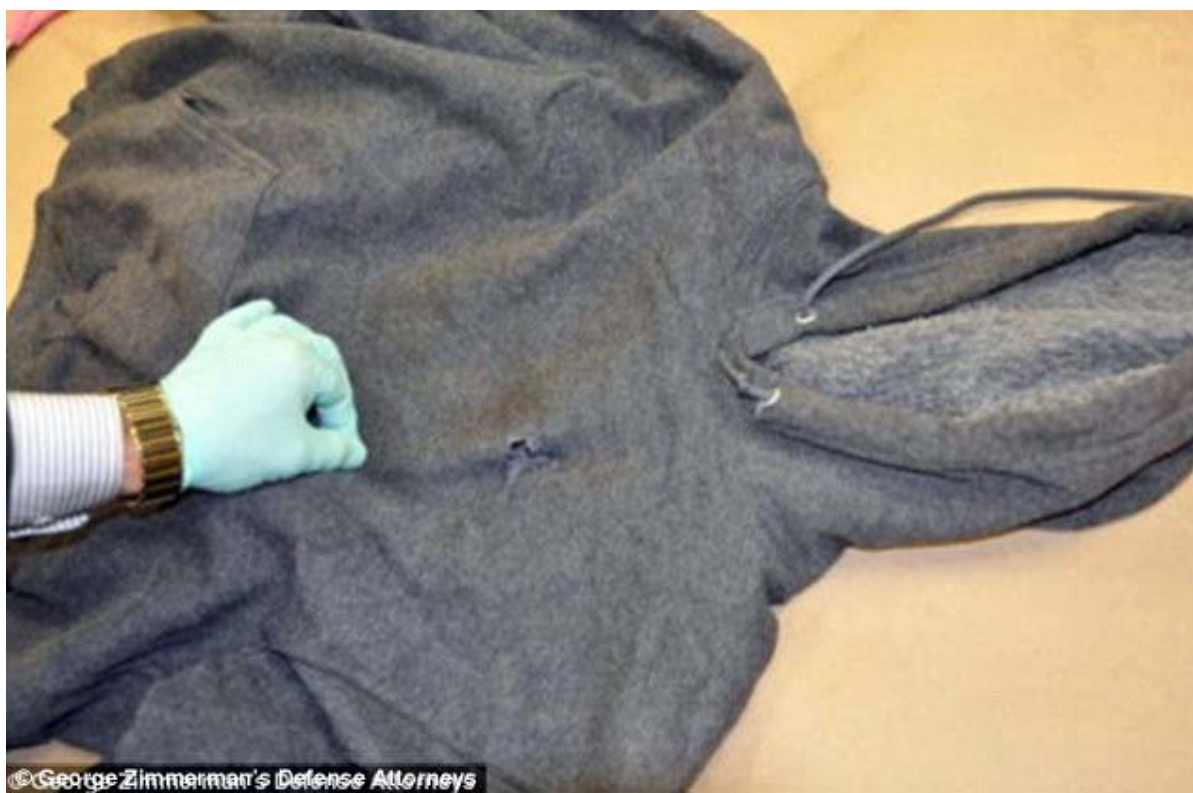
Fatal mark: A bullet hole can be seen in the front of the hooded top Trayvon was wearing on the night he died