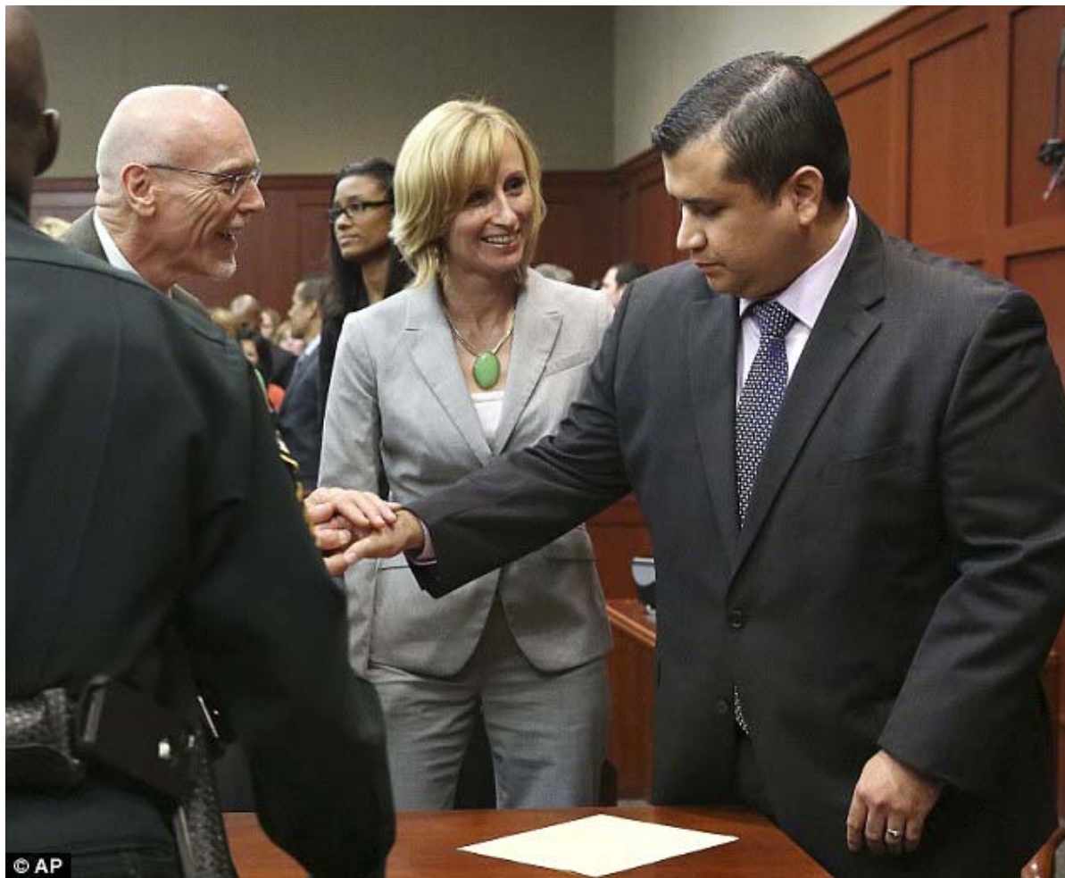
Freed: The defence team shake George Zimmerman's hand after he is found not guilty