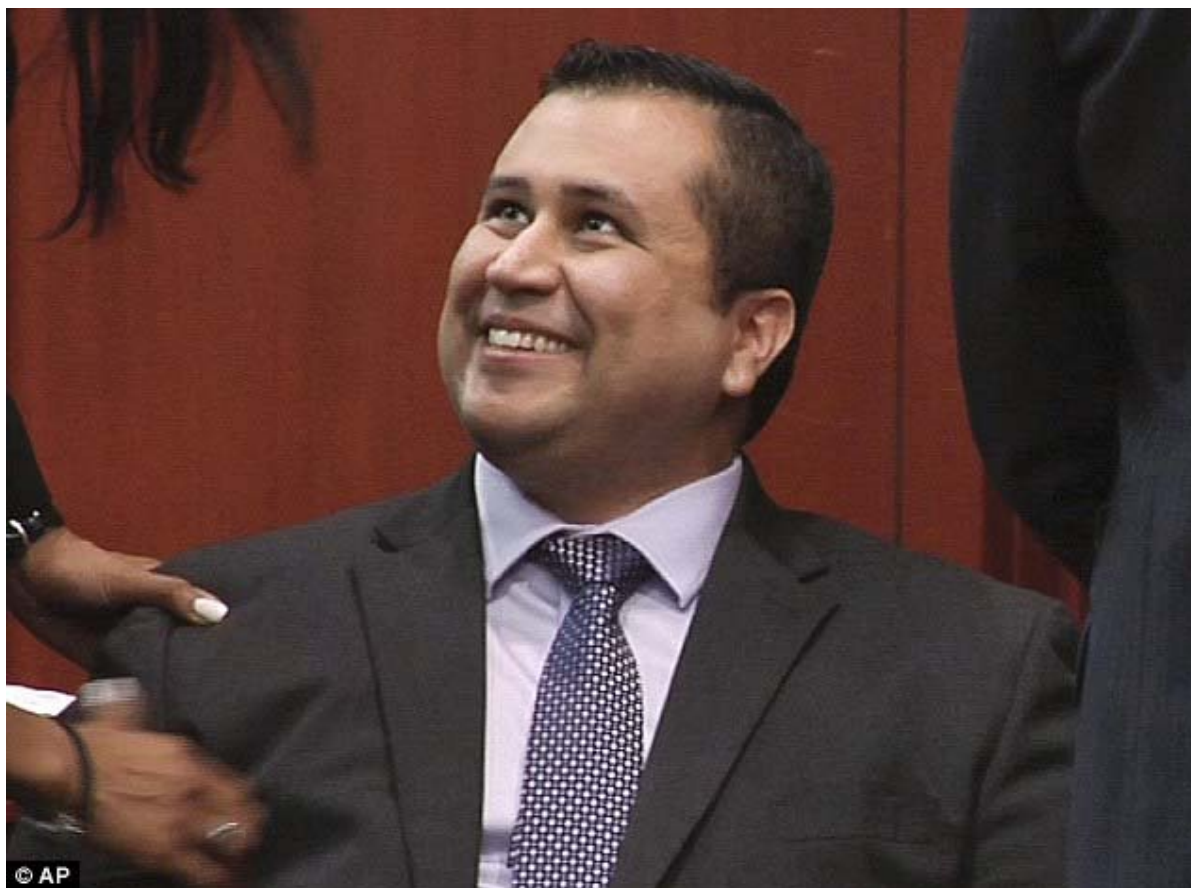
Relief: George Zimmerman breaks into a smile of relief a few moments after being cleared of all charges