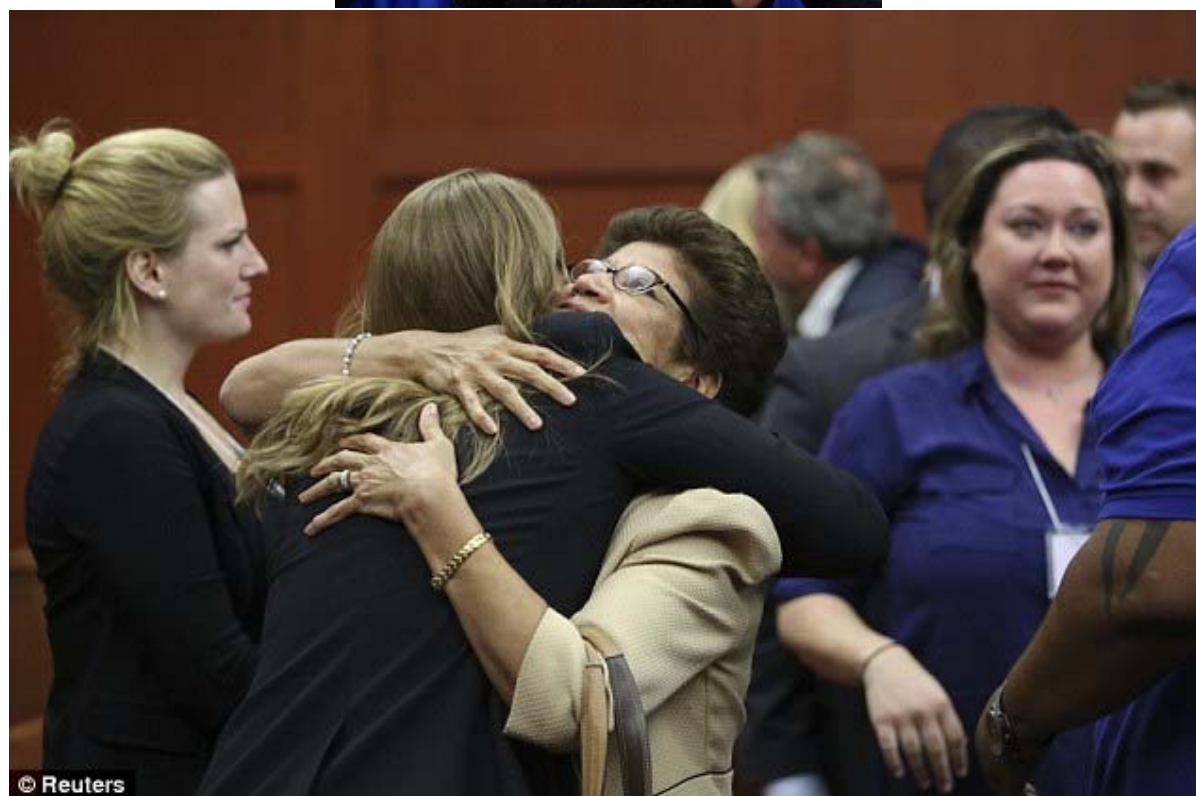
Relief: George Zimmerman's family celebrate as the jury clear him of all charges