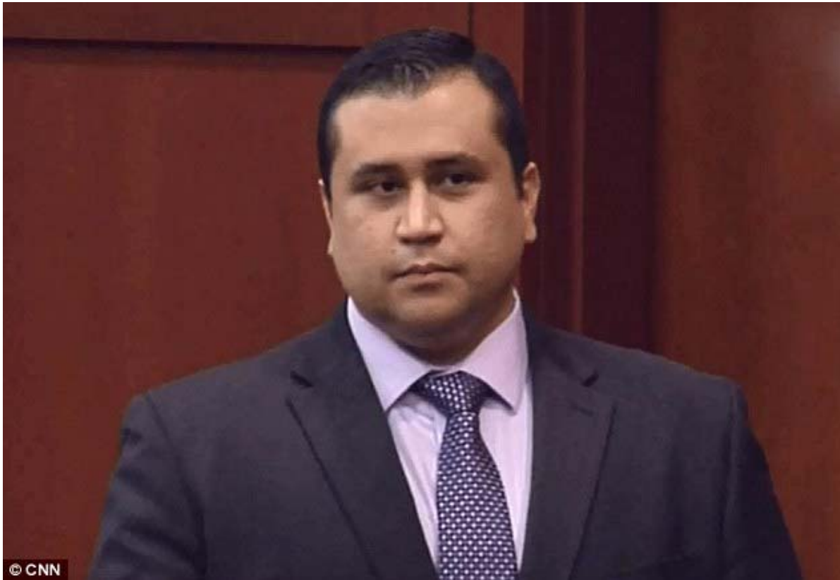
Not guilty: George Zimmerman listens as the judge records the not guilty verdict in his murder trial