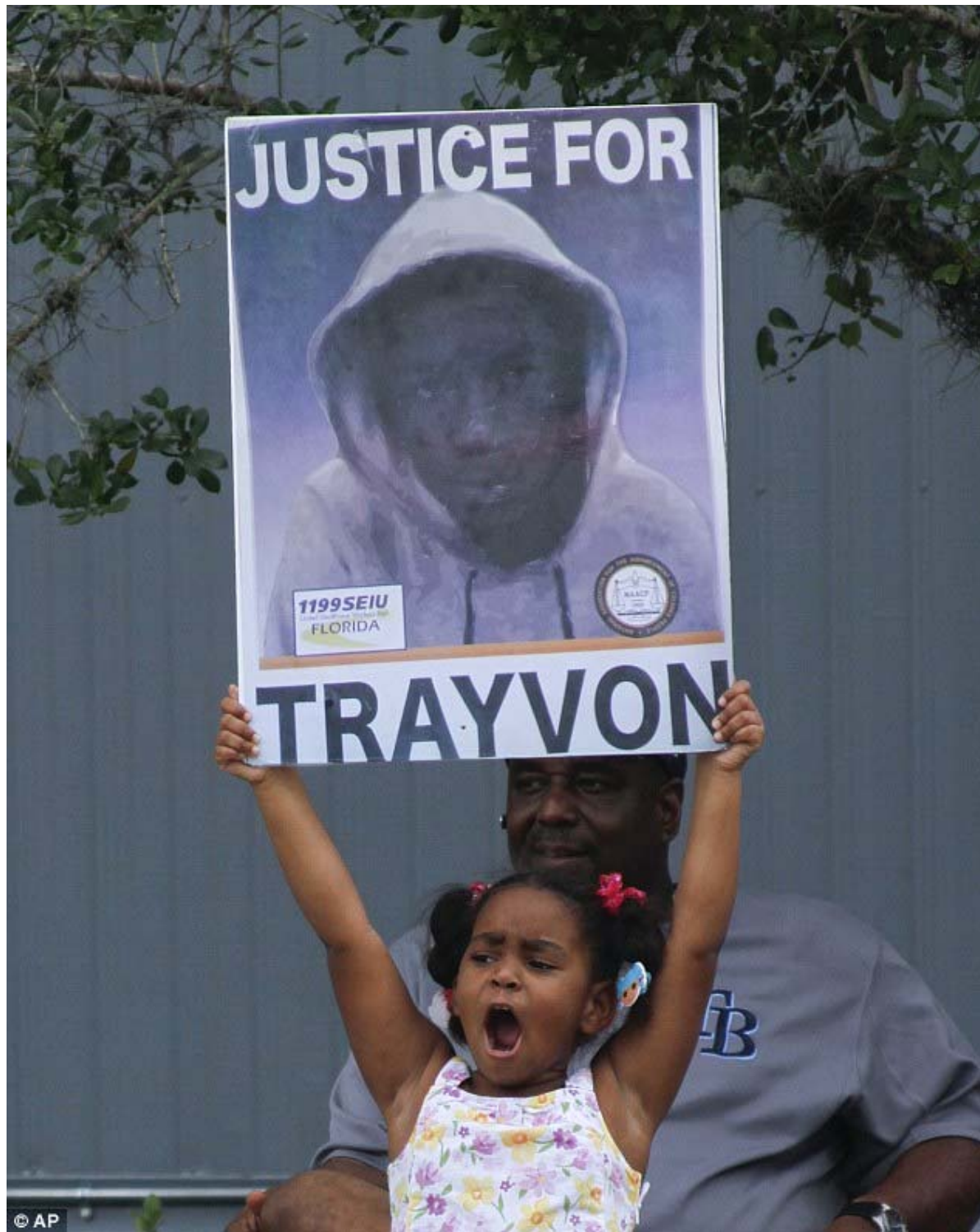
Despair: Supporters of Trayvon Martin say the verdict is a slap in the face for the American people

The race element could become the legacy of the trial. Atlanta mayor Kasim Reed responded to the verdict by saying: 'The death of Trayvon Martin shows that we must all work harder to shed the dangerous stereotypes that can have devastating consequences for individuals, families and our society.'