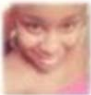
Reaction: Some people took to Twitter to show their disapproval of the verdict