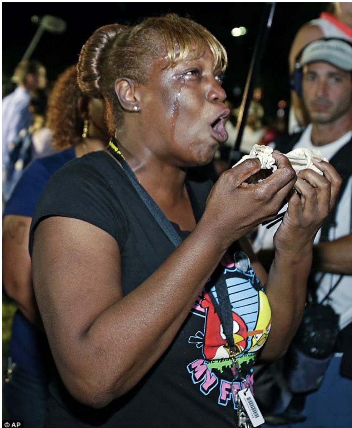
Shock: A Florida woman cries as she hears the not guilty verdict verdict outside the court house