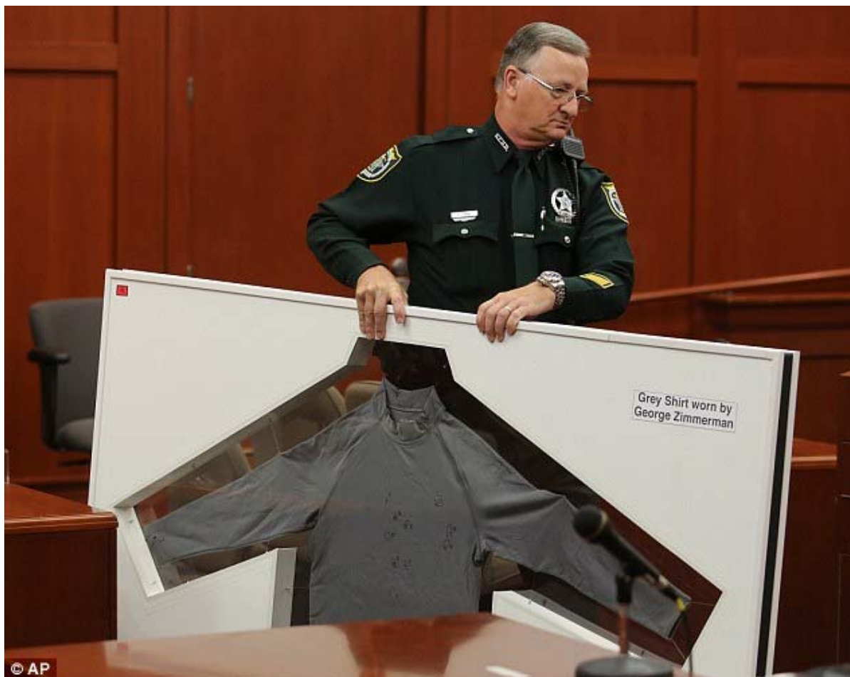
Evidence: A shirt worn by Zimmerman on the night of the shooting was used as evidence in the trial