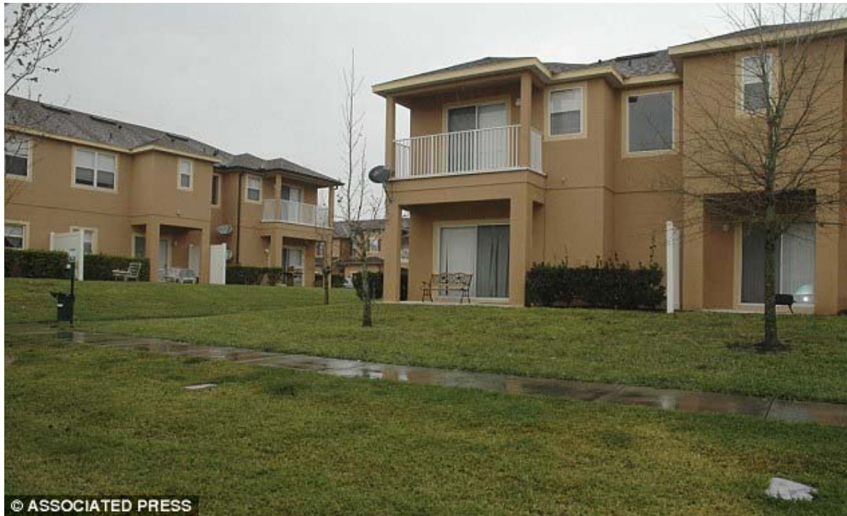
Crime scene: Trayvon was shot outside with Florida complex

Zimmerman wasn't arrested for 44 days after the February 26, 2012, shooting as police in Sanford insisted that Florida's Stand Your Ground law on self-defense prohibited them from bringing charges. Florida gives people wide latitude to use deadly force if they fear death or bodily harm.