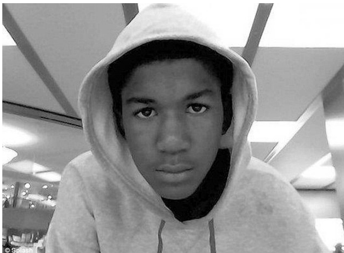
Victim: Trayvon Martin was shot and killed on February 26, 2012, as he was walking back from the 7/11 with a packet of Skittles and a can of juice