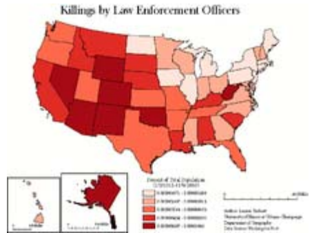
Percent of each US state's population, ranging as high as 0.00002%, killed by law enforcement officers in the 22 months ending November 8, 2016

The Washington Post has tracked shootings since 2015, reporting more than 5,000 incidents since their tracking began. [5] The database can also classify people in various categories including race, age, weapon etc. For 2019, it reported a total of 1,004 people shot and killed by police. [6]