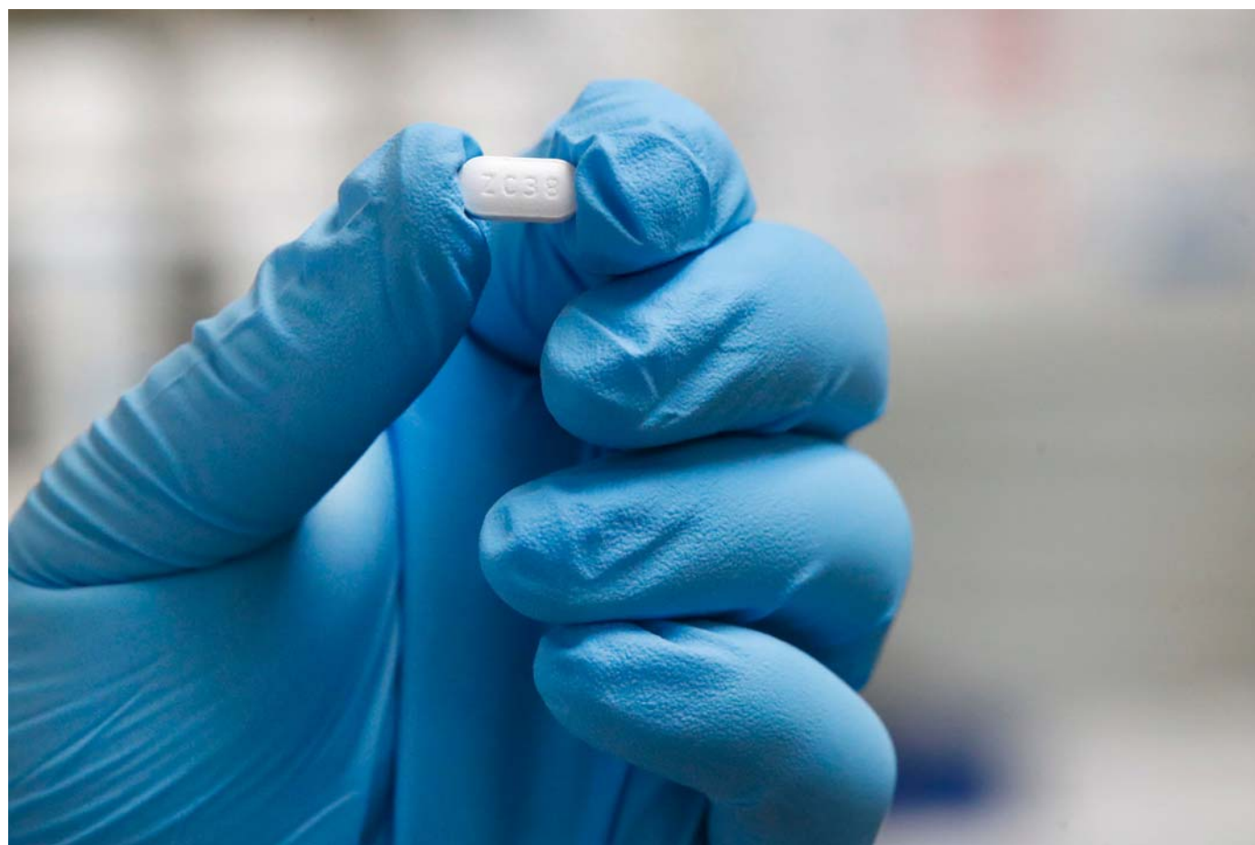
A pharmacy technician holds a hydroxychloroquine pill at a pharmacy in Provo, Utah, on May 20.