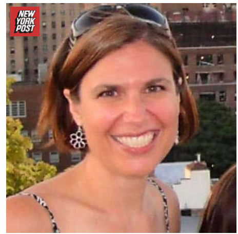
New York Post