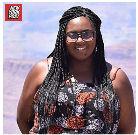
New York Post