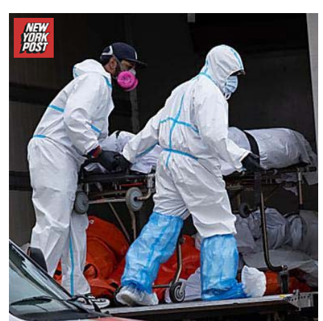
New York Post