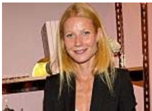
Gwyneth Paltrow Reveals Why She and Chris Martin Split