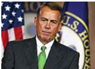
Boehner Narrowly Re-elected House Speaker