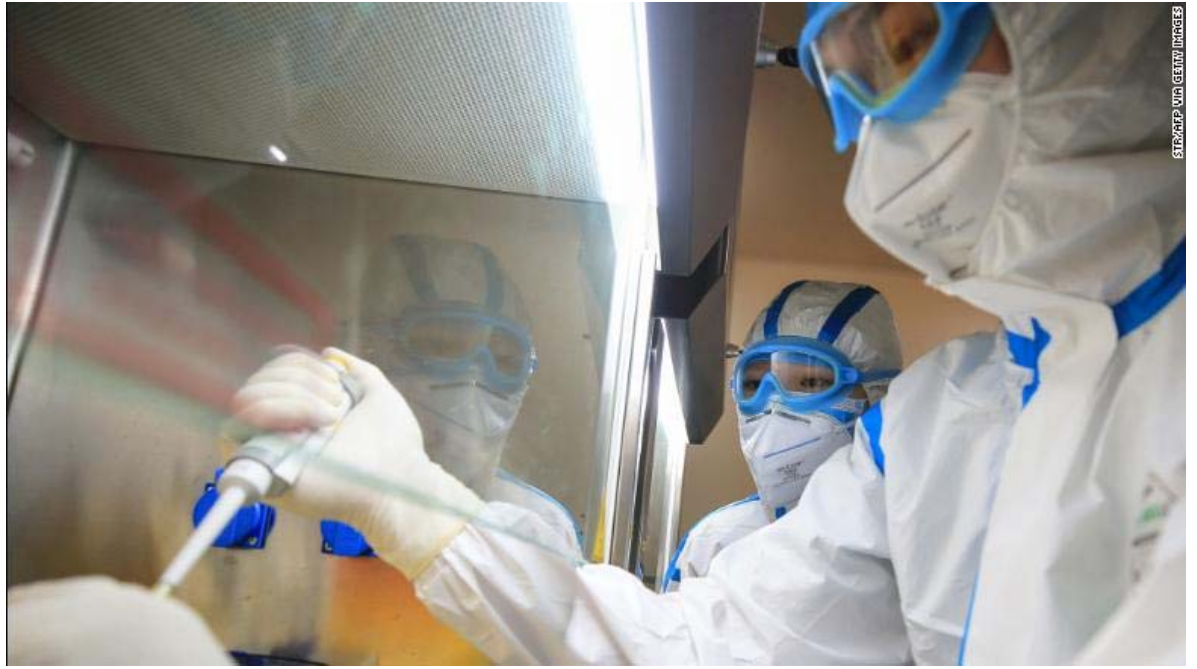
Laboratory technicians test samples of the coronavirus at a lab in Hengyang in China's central Henan province.