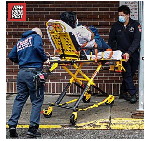
New York Post

98 people in NYC died from coronavirus in less than 7 hours