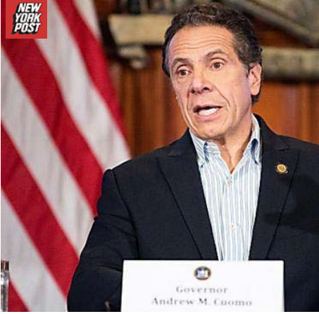
New York Post

98 people in NYC died from coronavirus in less than 7 hours