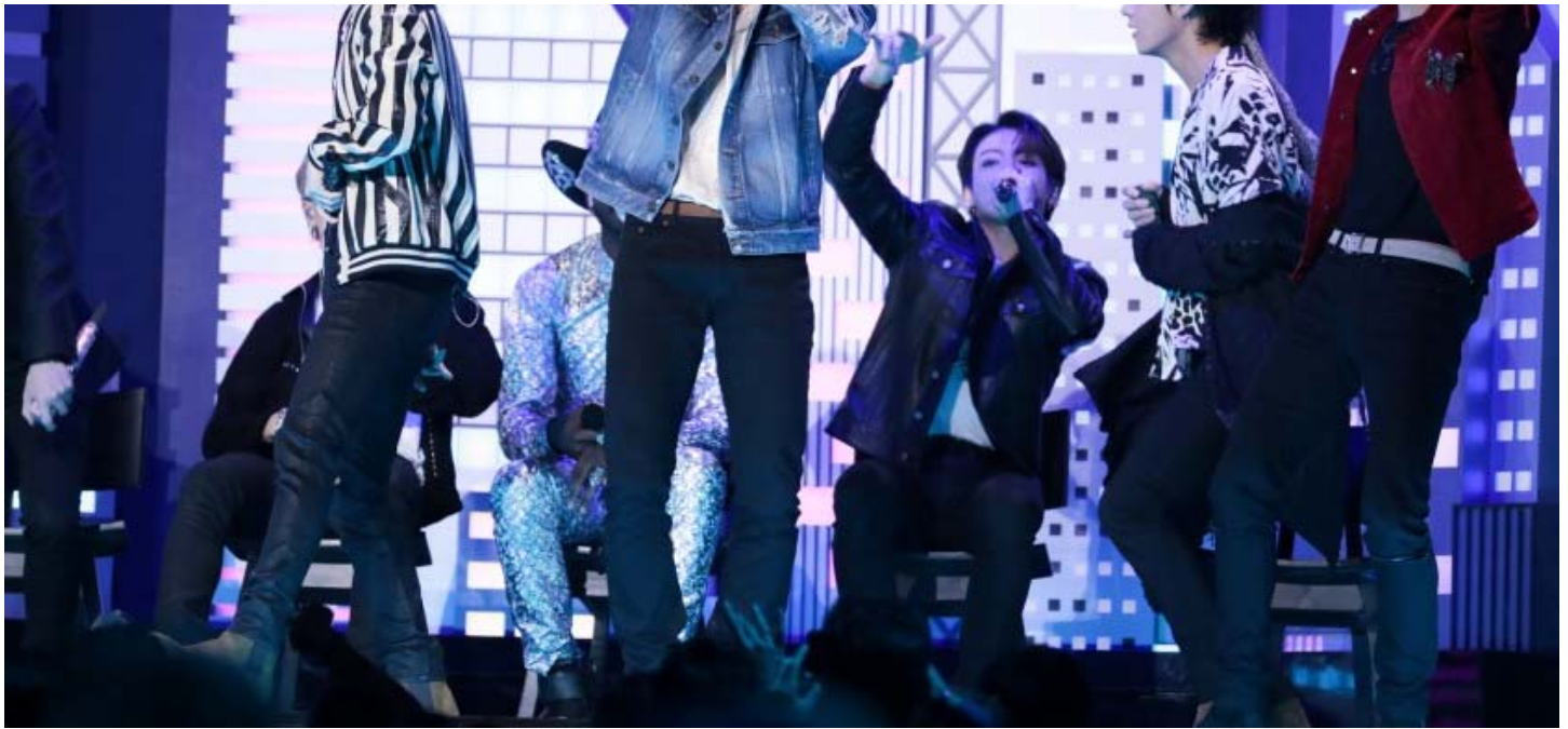
BTS performs at the 2020 Grammy Awards.

The L.A. Philharmonic announced March 12 that it would cancel all events at Walt Disney Concert Hall through March 31, in compliance with a state Department of Public Health directive limiting public gatherings.