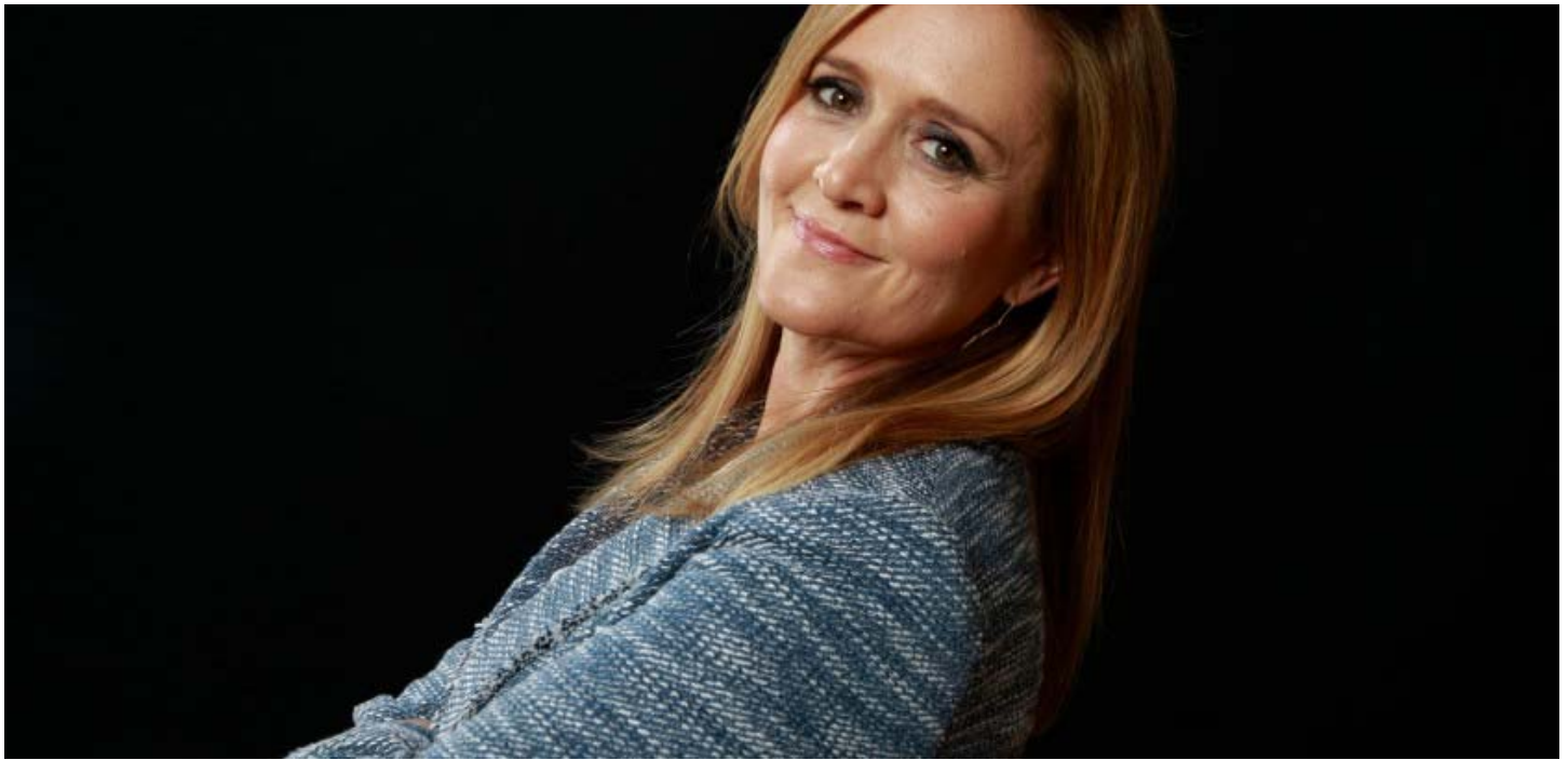
“Full Frontal” host Samantha Bee.

Major late-night TV chat shows that tape in New York City — that includes “The Late Show With Stephen Colbert,” and “The Daily Show” and “Late Night With Seth Meyers” — will suspend taping with studio audiences starting March 16, the networks said March 11 in a coordinated announcement. TBS’ “Full Frontal With Samantha Bee” axed its studio audience starting March 11, and “Last Week Tonight” with John Oliver will follow suit March 15. “The Tonight Show With Jimmy Fallon” and “Late Night With Seth Meyers,” which had joined in that no-audience announcement, now say they will suspend production from March 13 through their previously planned hiatus week, the week of March 23.