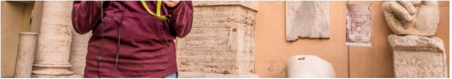
The Capitoline Museums in Rome is among those staying open and enforcing a safety distance between visitors, though it has canceled some tours and events in March.

The Getty Center and Getty Villa are closing to the public as of March 14, with a reopen date to be determined. It had previously canceled all events and programs through the end of May, and nixed school visits and group tours. The work of the Getty Museum, Getty Conservation Institute, Getty Research Institute and Getty Foundation will continue.