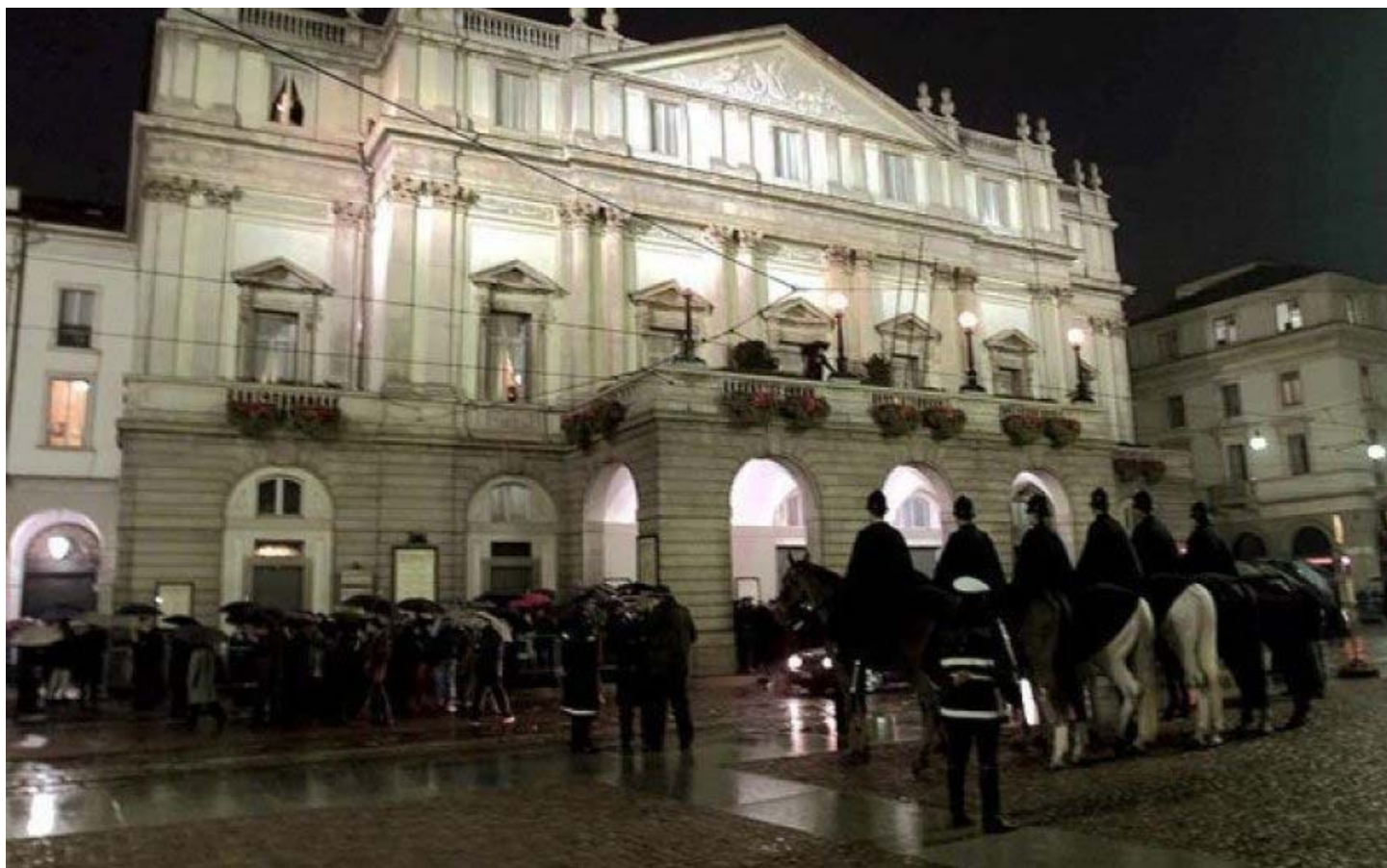
The La Scala opera house in Milan, Italy, has suspended performances through April 3.

L.A. Opera canceled the March 14 performance by Roberto Devereux , giving two days' notice.