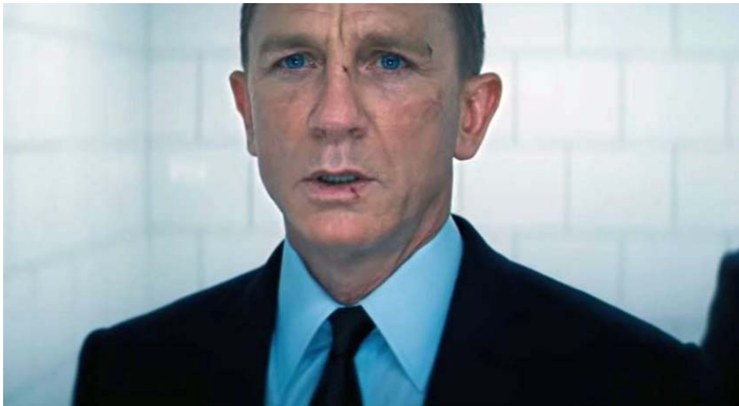
Daniel Craig as James Bond in "No Time to Die."

Universal will delay the release of " F9 ," the latest film in the " Fast and the Furious " franchise, by nearly a year. It'll now hit theaters on April 2, 2021, instead of May 22.