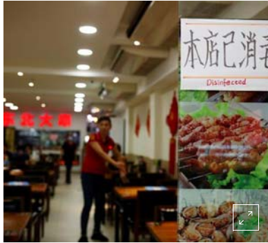
Slideshow (32 Images)

Analysts have warned that the outbreak looks set to shunt Italy's fragile economy into its fourth recession in 12 years, with many businesses in the wealthy north close to a standstill and hotels reporting a wave of cancellations.