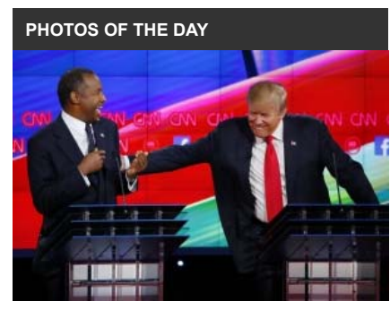
Our top photos from the last 24 hours. Slideshow

The National Guard, which is the branch of the armed forces that controls Venezuela's borders, did not respond to an email seeking comment on Reverol and a National Guard press official contacted by telephone declined to comment.