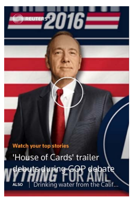
Your five minute news show of today's top stories

Relatives of Venezuelan first lady Cilia Flores have also been caught up in U.S. anti-drugtrafficking efforts.