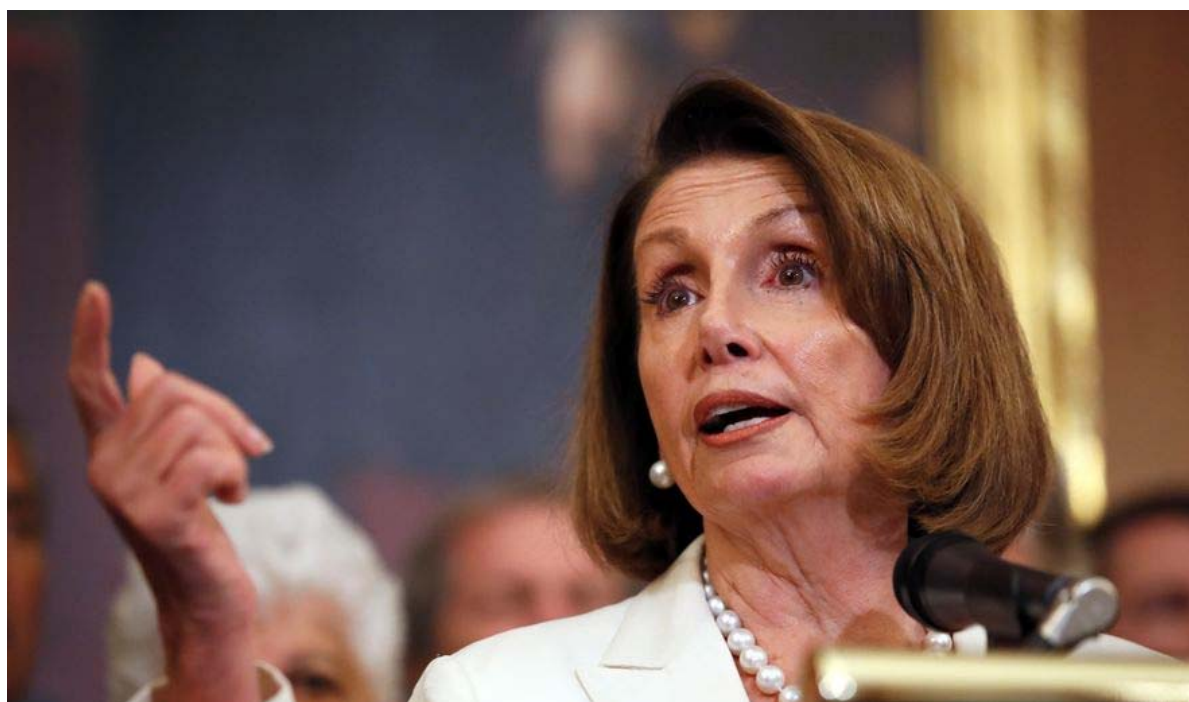
House Minority Leader Nancy Pelosi of Calif., speaks during a news conference about the nomination of Judge Brett Kavanaugh to the Supreme Court on Capitol Hill, Wednesday, Sept. 26, 2018, in Washington. ** FILE ** more >