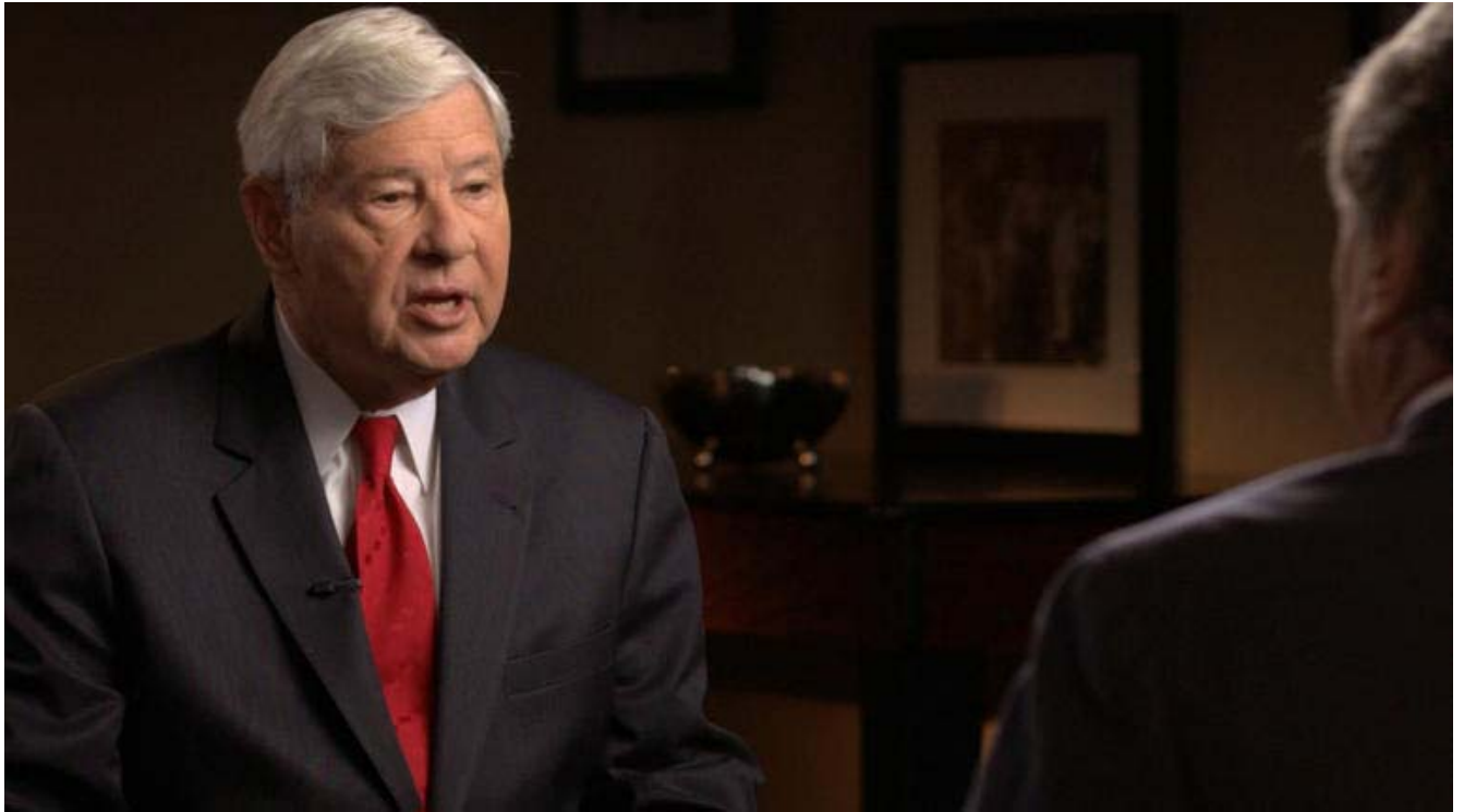
Bob Graham

Graham and others believe the Saudi role has been soft-pedaled to protect a delicate relationship with a complicated kingdom where the rulers, royalty, riches and religion are all deeply intertwined in its institutions.