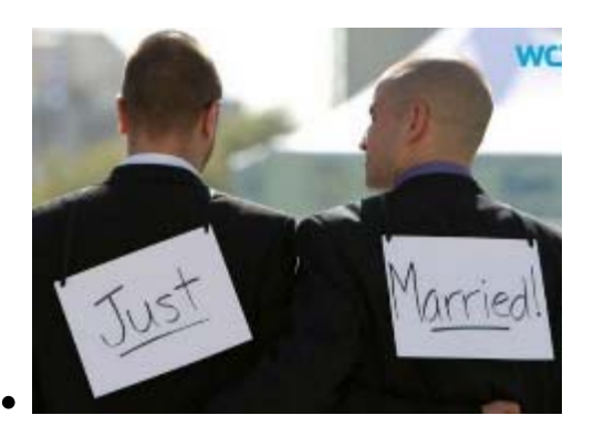
YouGov poll: Whites support gay marriage by nine points, Latinos oppose by eight, blacks oppose by 20