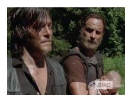
"Walking Dead" grumble thread: Worst. Episode. Ever.