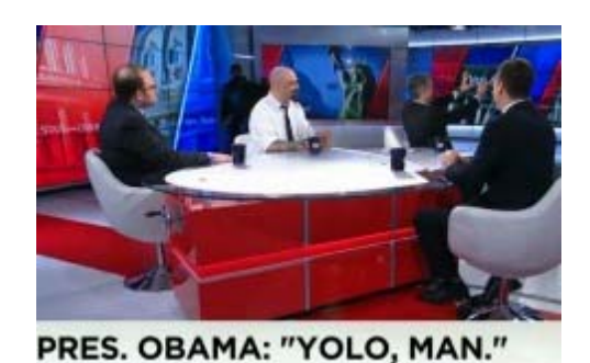
This is CNN: Vox, BuzzFeed have no problem with Obama's interviews on Vox, BuzzFeed