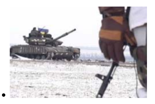
Bizarre: U.S. press pretty sure Ukraine ceasefire holding despite ongoing battles