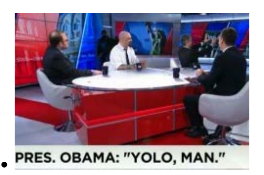
This is CNN: Vox, BuzzFeed have no problem with Obama's interviews on Vox, BuzzFeed