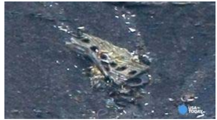
Black box recovered from Alps plane crash is damaged Mar 25, 2015 is-damaged/