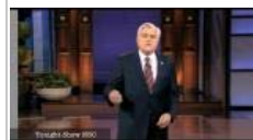
Leno: If '16 and Pregnant' Lowered Teen Births Than 'Keeping Up With The Kardashians'...