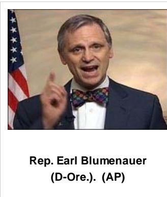
Rep. Earl Blumenauer (D-Ore.).