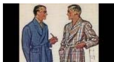
The Dangers of Viewing 'Historical Smoking' and the Modern E-Cigarettes