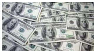
U.S. currency.

The $1.1 trillion bill will fund the federal government for the rest of fiscal year 2014, which ends on Sept. 30, 2014.