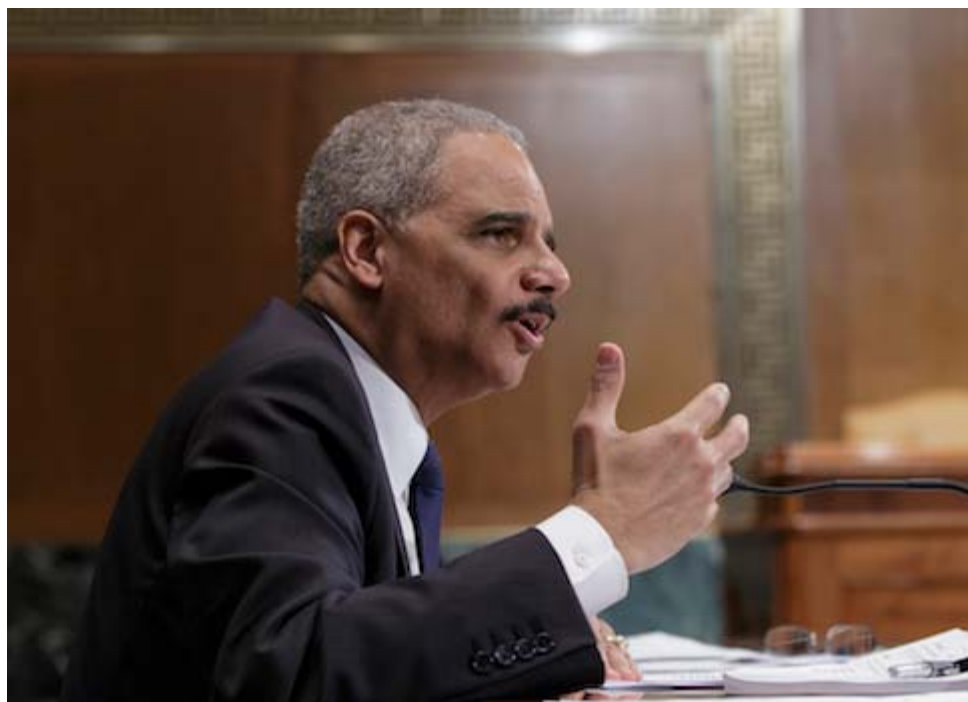
Attorney General Eric Holder

DOJ requesting $2 million for 'Gun Safety Technology' grants