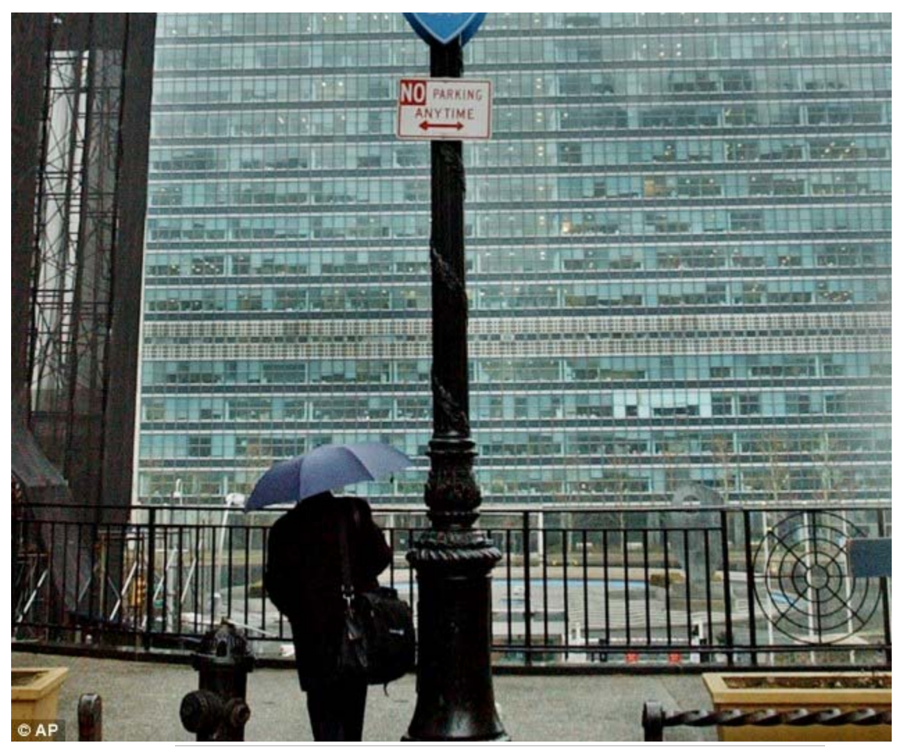
Targeted: The 27-bloc EU offices at the UN building in New York was spied on by the U.S. National Security Agency

The document allegedly referred to the EU as a 'target'. Details of European positions on trade and military matters would have been useful to those involved in negotiations between Washington and European governments, says the BBC's Stephen Evans.