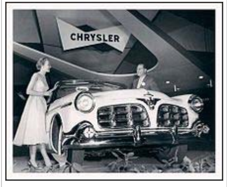
1955 Imperial car model shown on display at January 1955 Chicago Auto Show

In 1928, the Chrysler Corporation began dividing its vehicle offerings by price class and function. The Plymouth brand was introduced at the low-priced end of the market (created essentially by once again reworking and rebadging Chrysler's four-cylinder model). At the same time, the DeSoto brand was introduced in the medium-price field. Also in 1928, Chrysler bought the Dodge Brothers automobile and truck company and continued the successful Dodge line of automobiles and Fargo range of trucks. By the mid-1930s, the DeSoto and Dodge divisions would trade places in the corporate hierarchy.