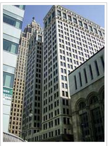
Chrysler House landmark executive offices in the Detroit Financial District