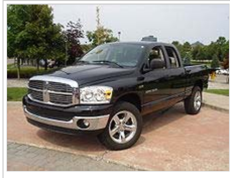
Ram 1500, one of Chrysler's best selling vehicles<sup>[59]</sup>