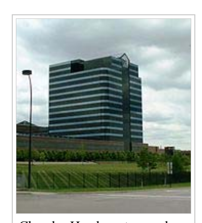
Chrysler Headquarters and Technology Center in Auburn Hills in Metro Detroit

Chrysler is the smallest of the "Big Three" U.S. automakers (Chrysler Group LLC, Ford Motor Company, and General Motors). Chrysler is the world's 13th largest vehicle manufacturer as ranked by OICA in 2010. [48] Total Chrysler vehicle production was about 1.58 million that year. Yanase Co., Ltd. is currently the exclusive retailer of all imported Chrysler products (Chrysler, Jeep, Dodge) to Japanese consumers.