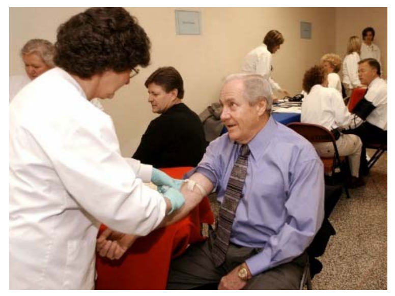
by WILLIAM BIGELOW (/COLUMNISTS/WILLIAM-BIGELOW) | 1 Sep 2013 | 222 POST A COMMENT (/BIG-GOVERNMENT/2013/08/31/OBAMACARE-S-FREE-BENEFITS-NOT-SO-FREE?UTM_SOURCE=TWITTERFEED&UTM_MEDIUM=TWITTER#COMMENTS)

<u>Contrary (http://www.foxnews.com/politics/2013/08/31/free-benefits-in-obamacarecome-with-hidden-costs/?intcmp=trending)</u> to what Barack Obama and Co. want Americans to believe, ObamaCare's benefits are anything but free. American Enterprise Institute's Jim Capretta told Fox News, "There's going to be taxes on insurance. Taxes on drugs. Taxes on medical devices. All of that is getting passed through to the prices people have to pay either for direct services or their insurance premiums.