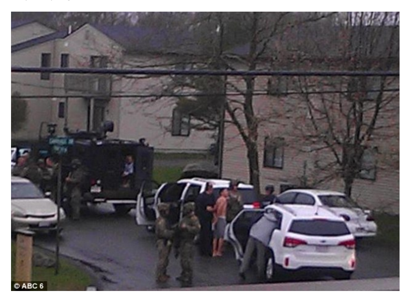
The apartment complex is about 10 minutes from the Dartmouth campus, where Dzhokhar Tsarnaev, 19, was a student

When MailOnline rang the City desk of the Boston Globe, a man said: 'We're very busy right now. Consider us informed'.