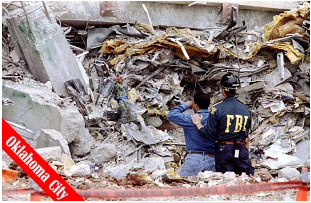
Devastation: The 1995 bombing of the Oklahoma City federal building, which killed 168, occurred the day after Patriots' Day

The 1995 bombing of the Oklahoma City federal building, which killed 168, occurred the day after Patriots' Day. Bomber Timothy McVeigh was said to believe that the date was significant.