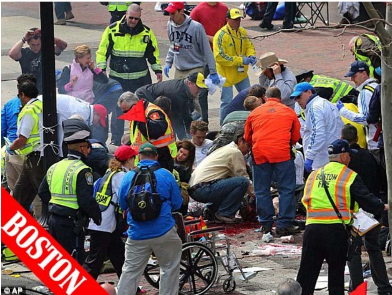
Carnage: The terrifying bomb attack at Monday's Boston Marathon took place on Patriots' Day - a New England tradition that has been marred by tragedy

But in recent years, it presents numerous grim anniversaries.