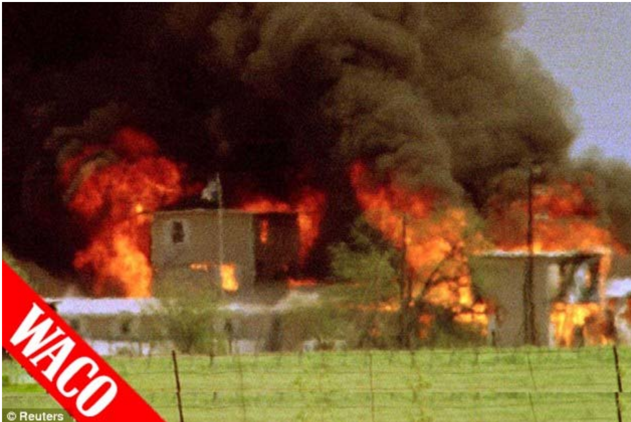
Bloodbath in Waco: The federal siege of the Branch Davidian compound, which left 82 members of the cult dead, ended on Patriots' Day in 1993

Patriots' Day is held in reverence by right-wing domestic groups, those who oppose the federal government and other mass killers who have chosen to strike on or around the third Monday in April.