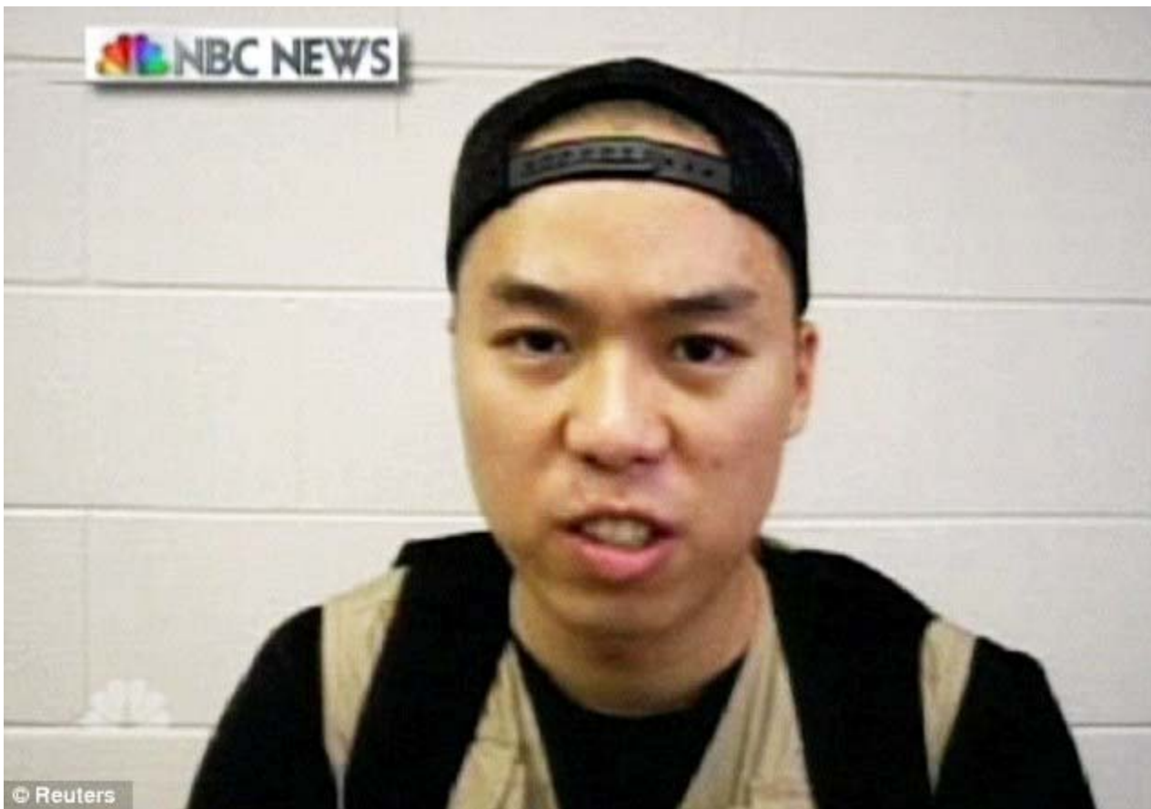
Spree killer: On April 16, 2007 - which was also Patriots' Day, Seung Hui-Cho murdered 32 people on the Virginia Tech campus before turning a gun on himself in one of the deadliest school shootings of all time

April 15 is also Tax Day, when federal income tax returns are due.