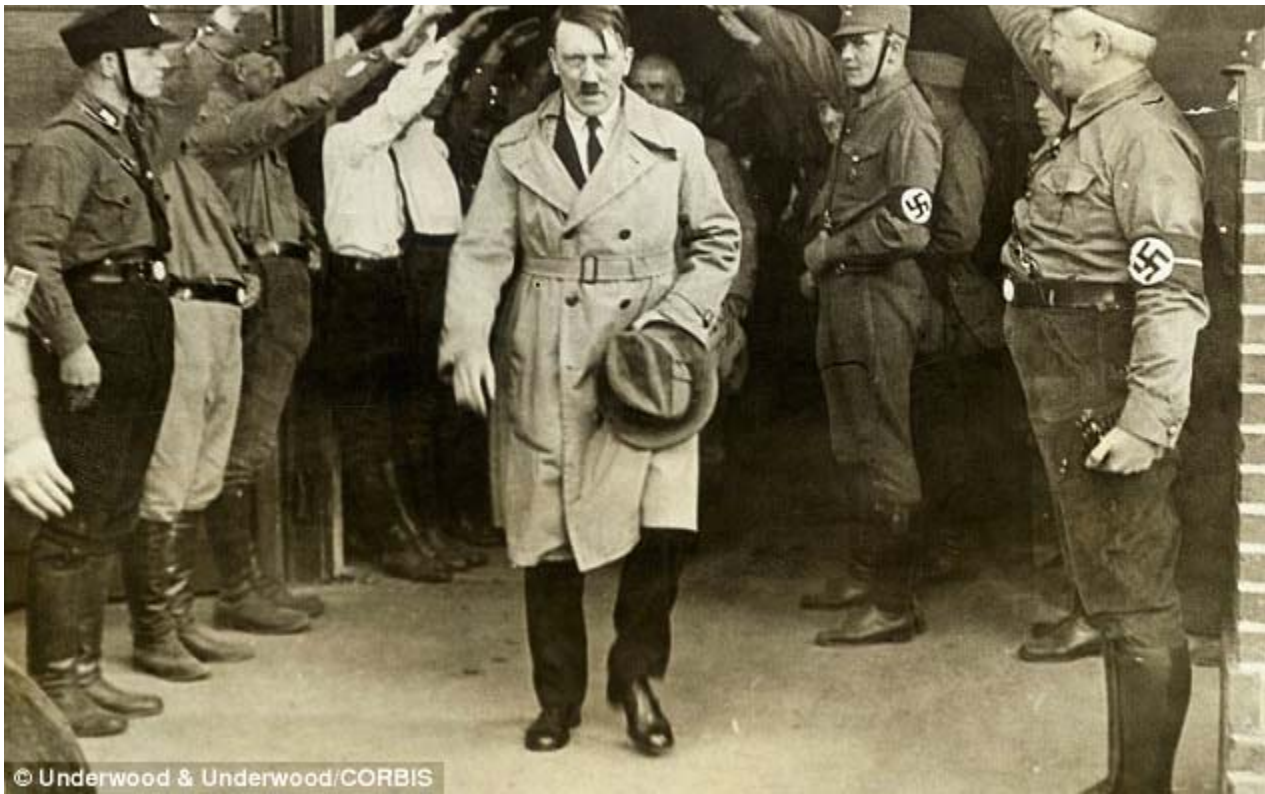
Evil: Harris and Klebold's motives are not known, but it is believed that they picked the date because it was also Adolf Hitler's birthday

On April 20, 1999 - also a day after that year's Patriots' Day - Eric Harris and Dylan Klebold shot and killed 12 fellow students and a teacher during a murderous rampage at Columbine High School.