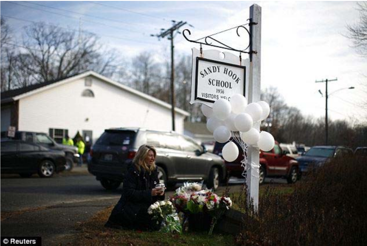
Prior claims: Other conspiracy theorists believed that the Sandy Hook shooting was designed by the government in order to help them pass stricter gun control laws

Now instead of limiting its use to naval warfare, conspiracy theorists apply it to any situation where a terrible act could be used by the perpetrators to influence a change in policy based off public outcry following the tragedy.