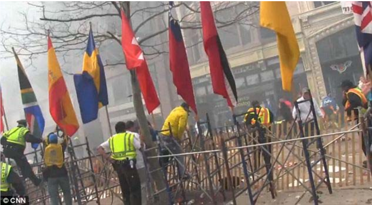
Different kind of flags: The term 'false flag' comes from nautical warfare, where an attacker would use the flag of a friendly nation to trick the target into allowing them to approach

The conspiracy theorists have been able to disseminate their version of events largely because the federal authorities are still trying to compile theirs.