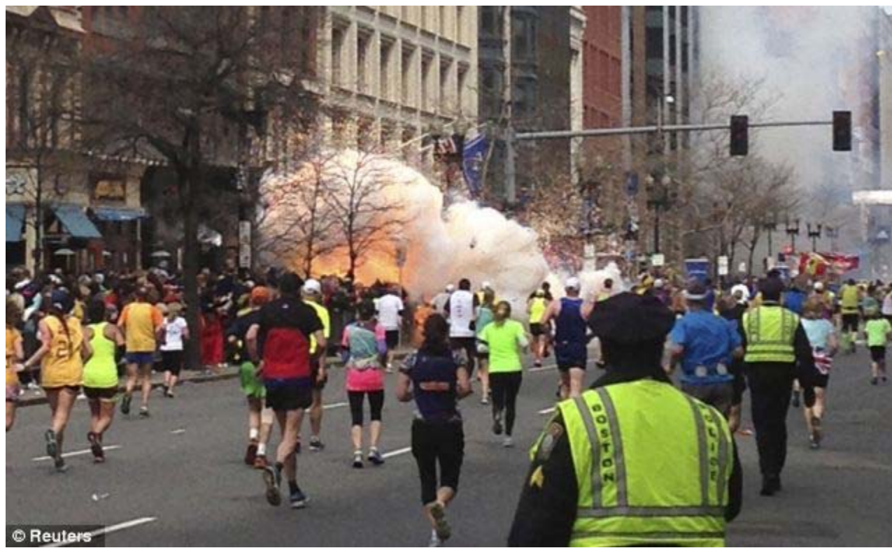
Runners continue to run towards the finish line of the Boston Marathon as an explosion erupts near the finish line

False flag attacks are instances where governments are thought to have arranged a violent incident- theoretically like Monday's bombing- in order to scare its citizens into handing over controls to the federal authorities.