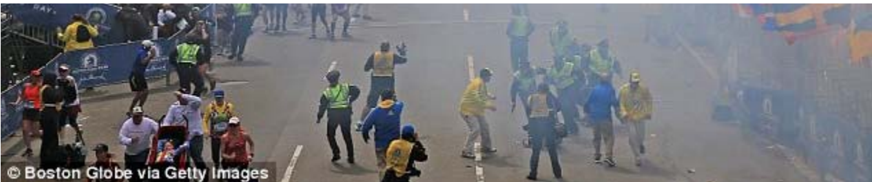
The second of two explosions rocked the last 1050 yards of the Boston Marathon course, sending shrapnel into the crowd, severing limbs, and ending lives