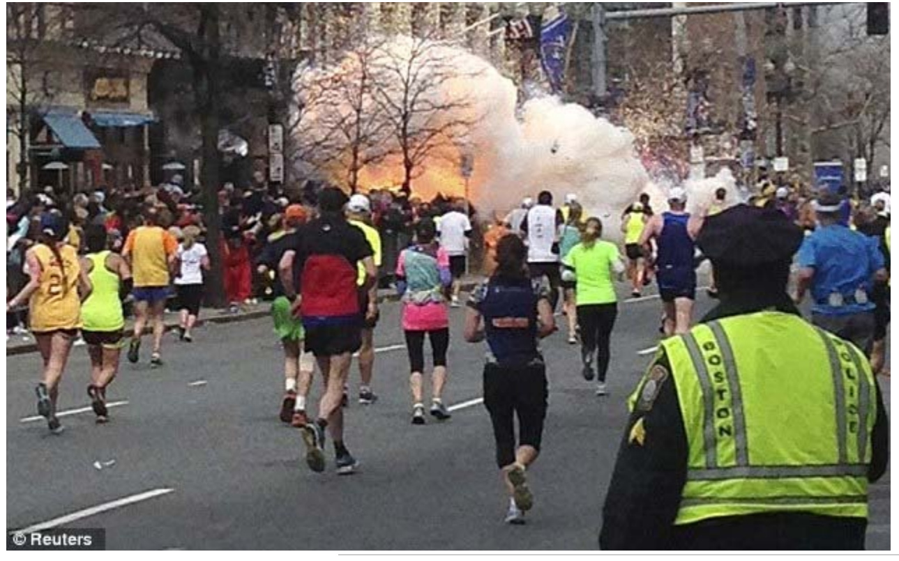
'Crude bombs': Both of the bombs were small, likely homemade devices and initial tests showed no C-4 or other high-grade explosive material