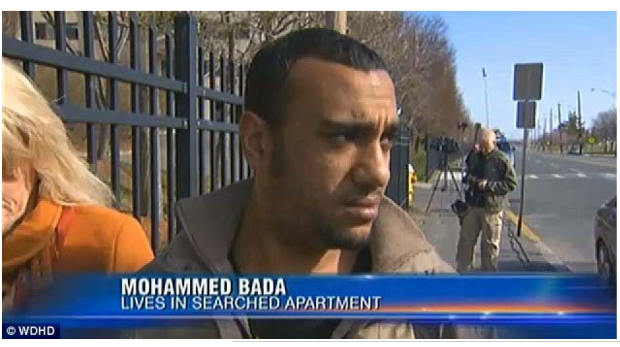
The Saudi's roommate said: 'When I came home the police were at our apartment. They asked lots of questions. Then the FBI and other officers came. They took some clothes away and searched everything'