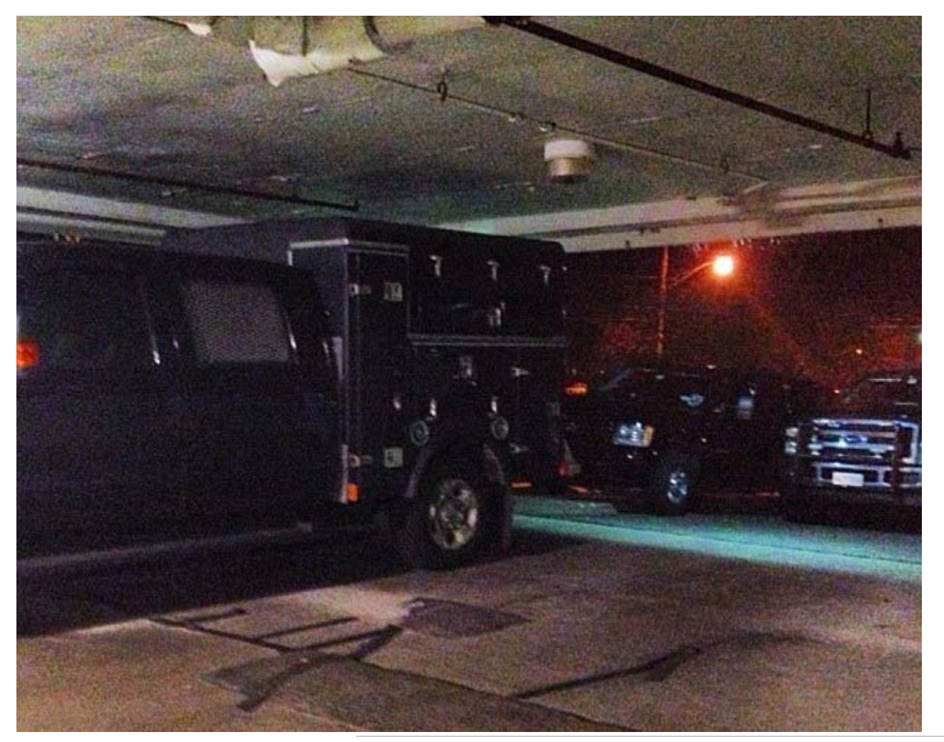
Investigators were seen leaving the scene with brown paper evidence bags, trash bags and a duffel bag

Law sources told the New York Post that after the man was grabbed by police, he smelled of gun powder and said, 'I thought there would be a second bomb' before asking, 'Did anyone die?'