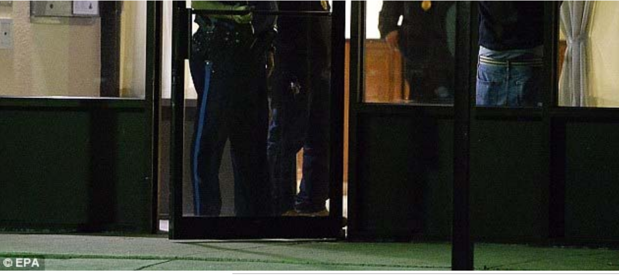
Police investigators leave an apartment complex in Revere, Massachusetts, USA, 16 April 2013