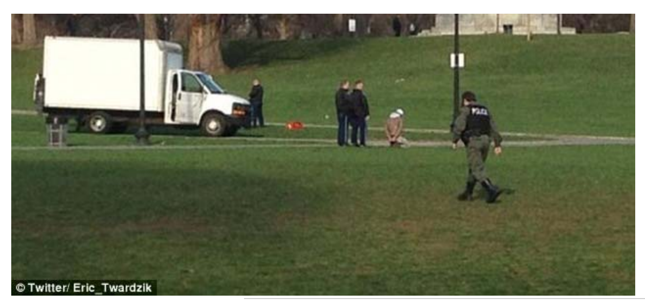
Pictured: Images of a man in cuffs were posted online but police were keen to underline there had been no arrests. Officers said they were speaking to several people as would be expected in any major incident