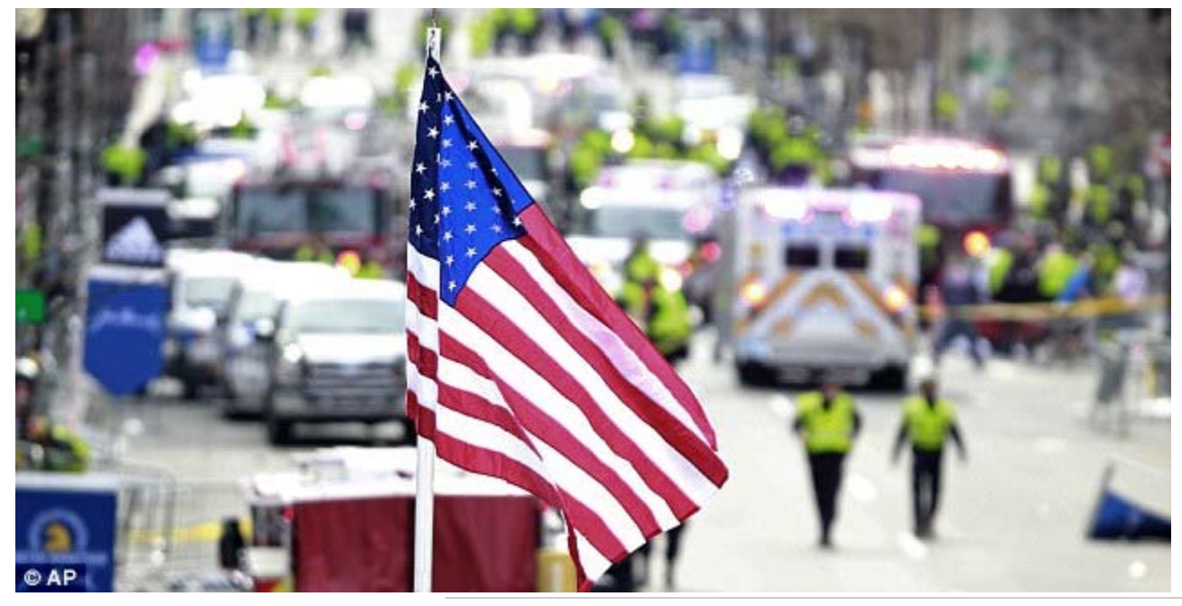
Controlled explosions: Officers were said to be carrying out controlled explosions on three secondary device

Today, a plane was brought back to the gate at Logan airport after two passengers on board were speaking Arabic and people grew concerned.