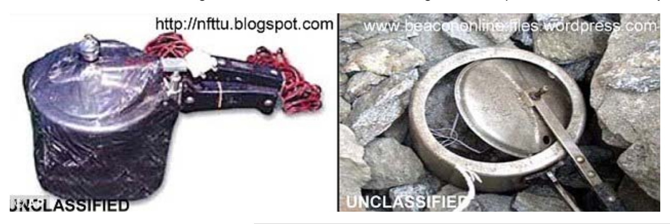
Kitchen bomb: The pressure cooker bomb is known as a 'highly effective' weapon of al Qaeda

'To me this smacks of home-grown terrorism – someone wanting to make a point about Patriots Day or something.'