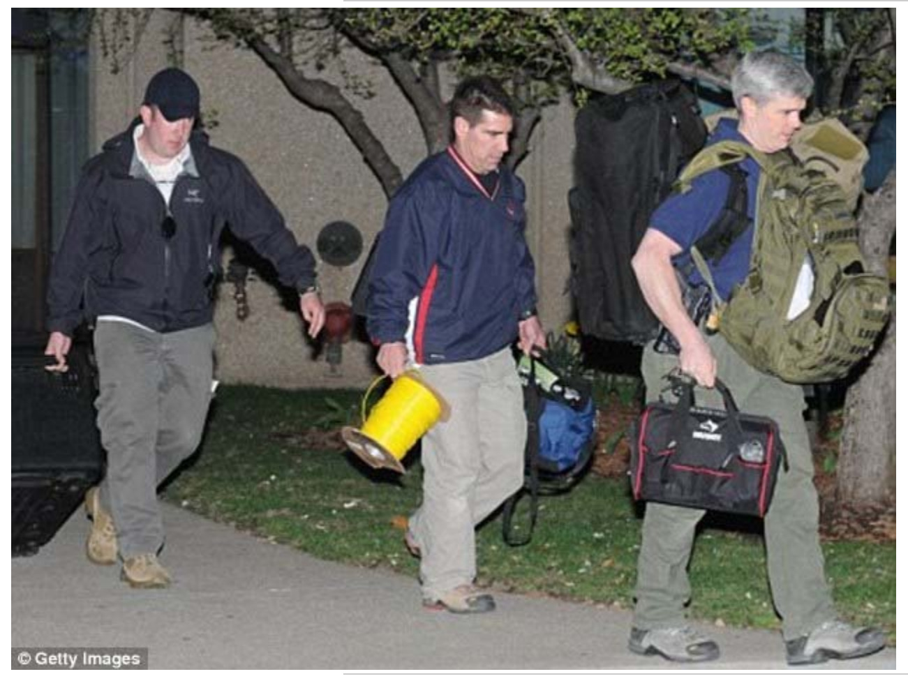
Police and federal officials exit an apartment complex at 364 Ocean Avenue with a possible connection to the earlier explosions that occurred during the Boston Marathon on Monday