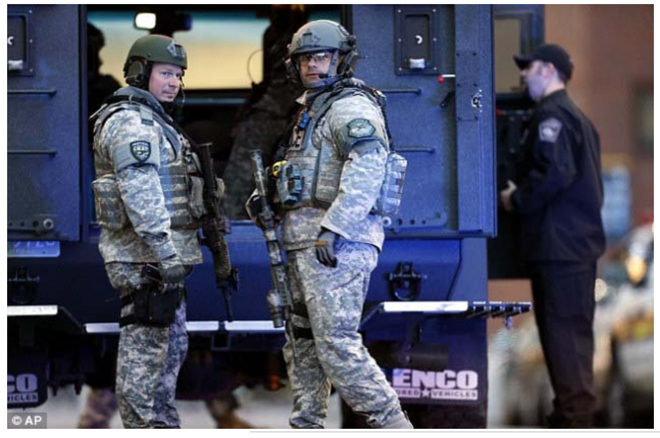
Massachusetts General Hospital, where 22 victims of the bomb blast are being treated, was locked down for two hours after a suspicious package was reported in the parking garage across the street

Witnesses described seeing body parts flying through the air and shoes that 'still had flesh in them'.