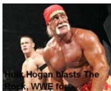
Hulk Hogan blasts The Rock, WWE for...