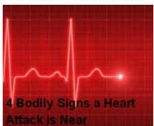
4 Bodily Signs a Heart Attack is Near