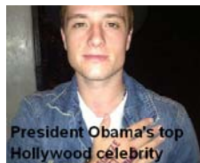
President Obama's top Hollywood celebrity