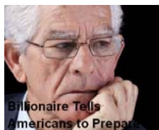
Billionaire Tells Americans to Prepar...