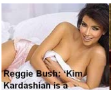
Reggie Bush: 'Kim Kardashian is a...