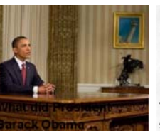
What did President Barack Obama...