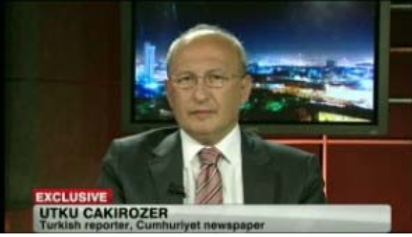
Impressions of Bashar al-Assad

Human Rights Watch has called his time as president "the wasted decade" with a media that remains controlled by