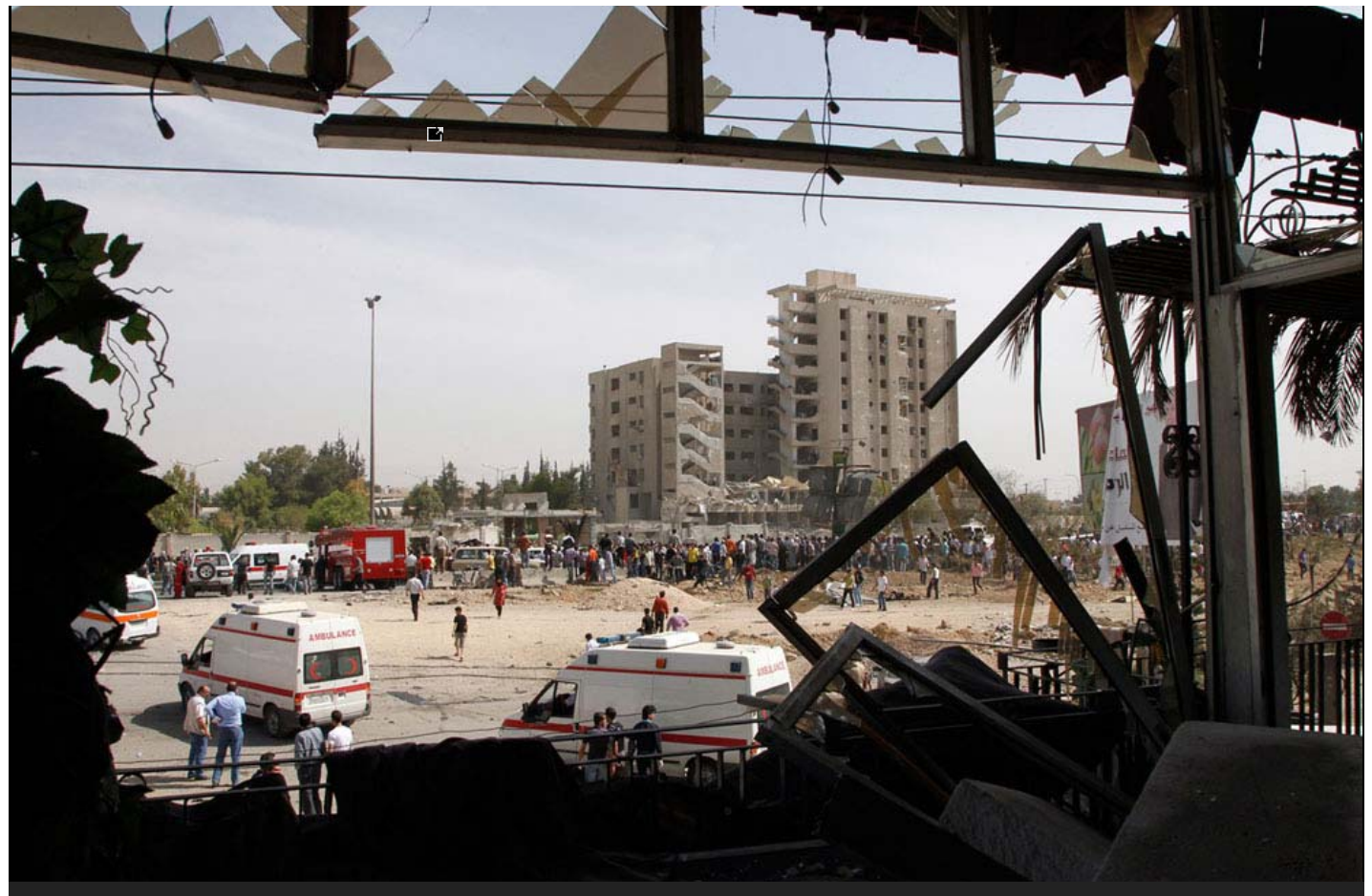
People gather at the site of an explosion, as seen from a damaged house close to the site in Damascus May 10, 2012. Two large explosions killed 40 people in Damascus, state media said, destroying dozens of cars on a highway and damaging an intelligence complex involved in President Bashar al-Assad's crackdown on a 15-month-old uprising. # 🗅