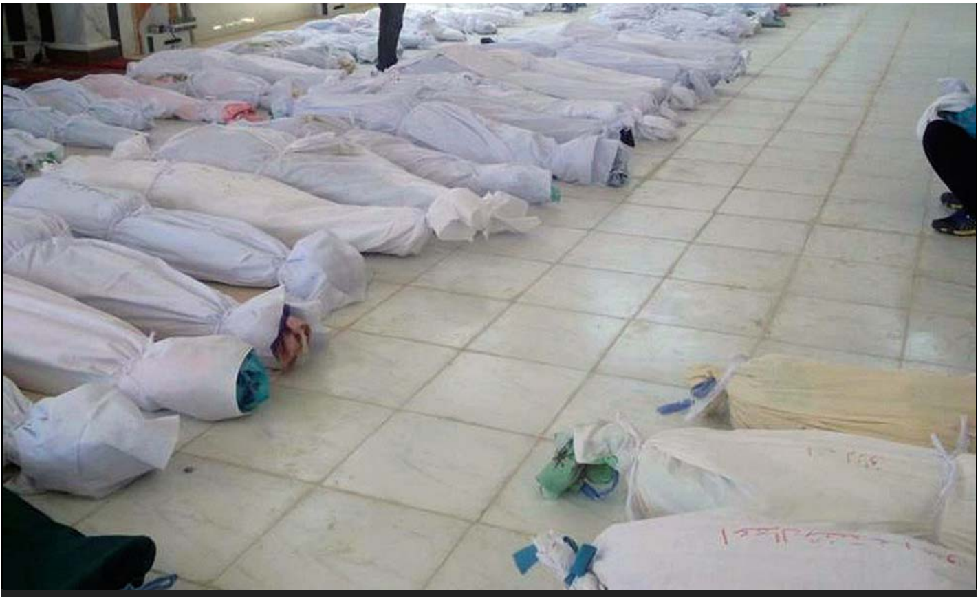
Bodies of people that anti-government protesters say were killed by government security forces lie on the ground at Ali Bin Al Hussein mosque in Huola, near Homs, on May 26, 2012. \underline{\#} \Box