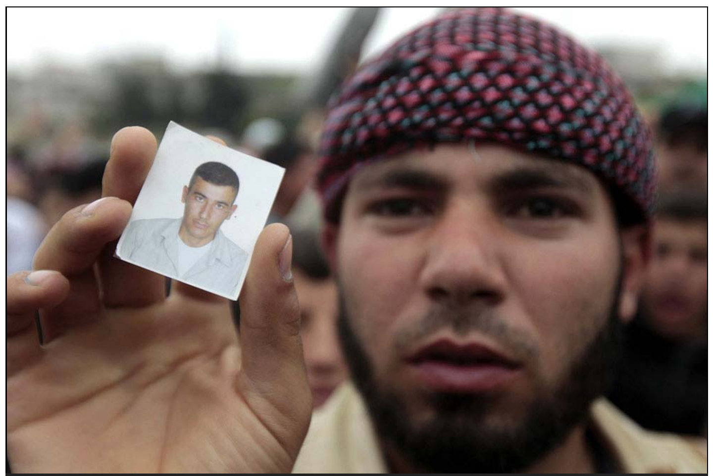
A Syrian anti-regime protestor holds a picture of a disappeared relative as people gather around UN observers in the village of Azzara in Homs province, on May 4, 2012. # \square