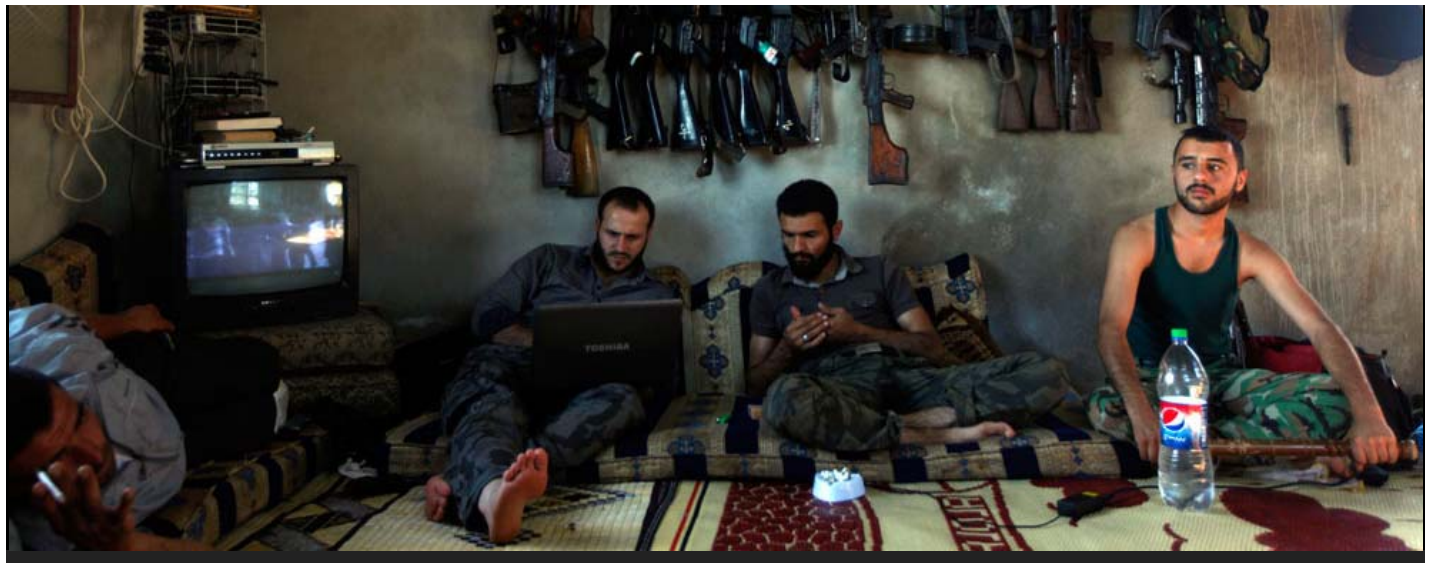
Pree Syrian Army fighters sit in a house on the outskirts of Aleppo, Syria, on June 12, 2012. Syrian forces pelted the eastern city of Deir el-Zour with mortars as anti-government protesters were dispersing before dawn, killing several people, activists said. The offensives were part of an escalation of violence in recent weeks that has brought more international pressure on President Bashar Assad's regime faces over its brutal tactics against the opposition. The U.N. accused the government of using children as human shields in a new report. (AP Photo) # C