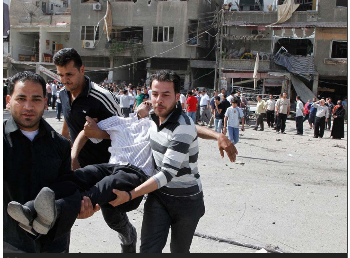
An injured man is carried after an explosion in Damascus, on May 10, 2012. Two explosions shook the Syrian capital Damascus, killing and wounding dozens of people, state media said. #