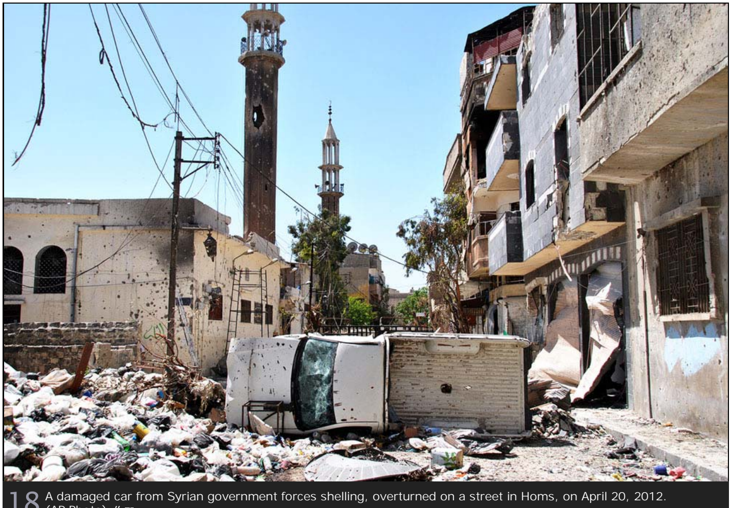
A damaged car from Syrian government forces shelling, overturned on a street in Homs, on April 20, 2012. # []