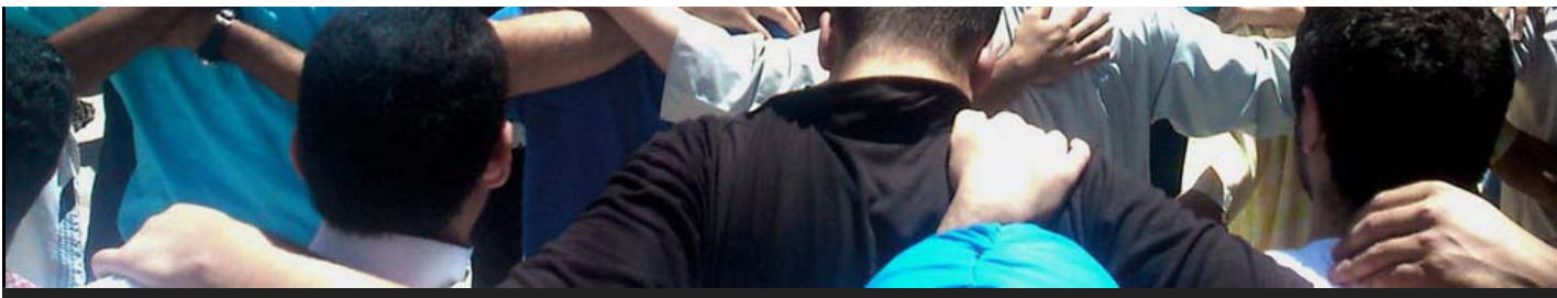
This citizen journalism image provided by Shaam News Network, taken on June 8, 2012 purports to show a Syrians chanting slogans during a demonstration in the eastern city of Deir el-Zour, Syria. (AP Photo/Shaam News Network) # □