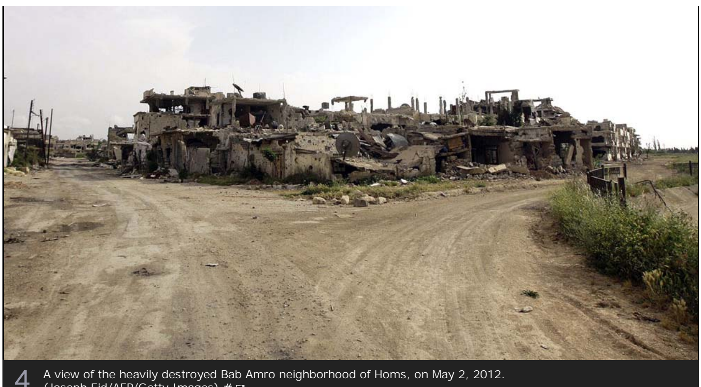
A view of the heavily destroyed Bab Amro neighborhood of Homs, on May 2, 2012. \# \Box