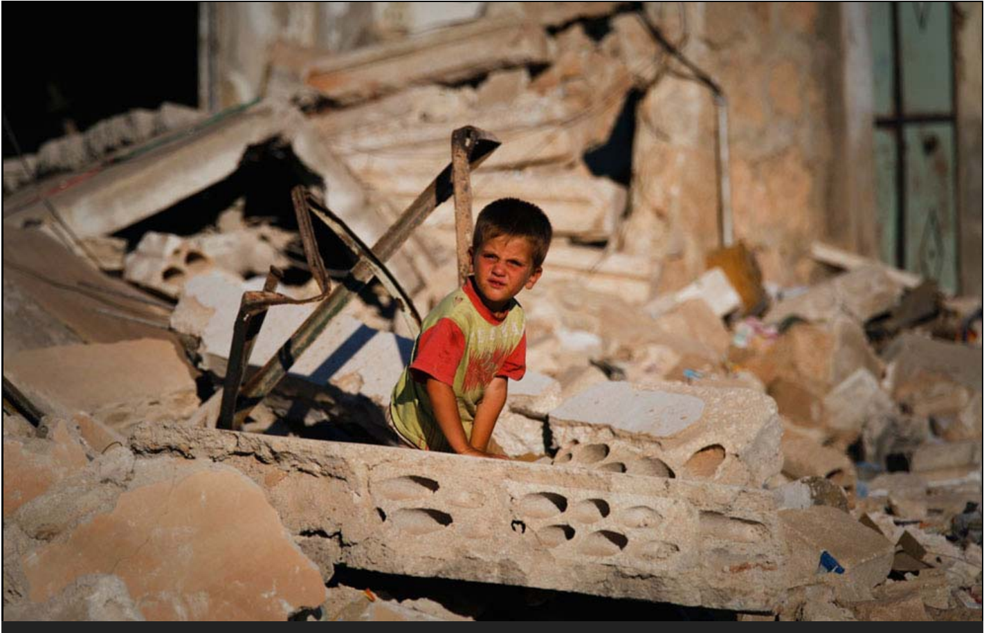
A Syrian boy sits in the rubble of house that was destroyed during a military operation by the Syrian pro-Assad army in April 2012, in the town of Taftanaz, 15 km east of Idleb, Syria, on June 5, 2012. # \square