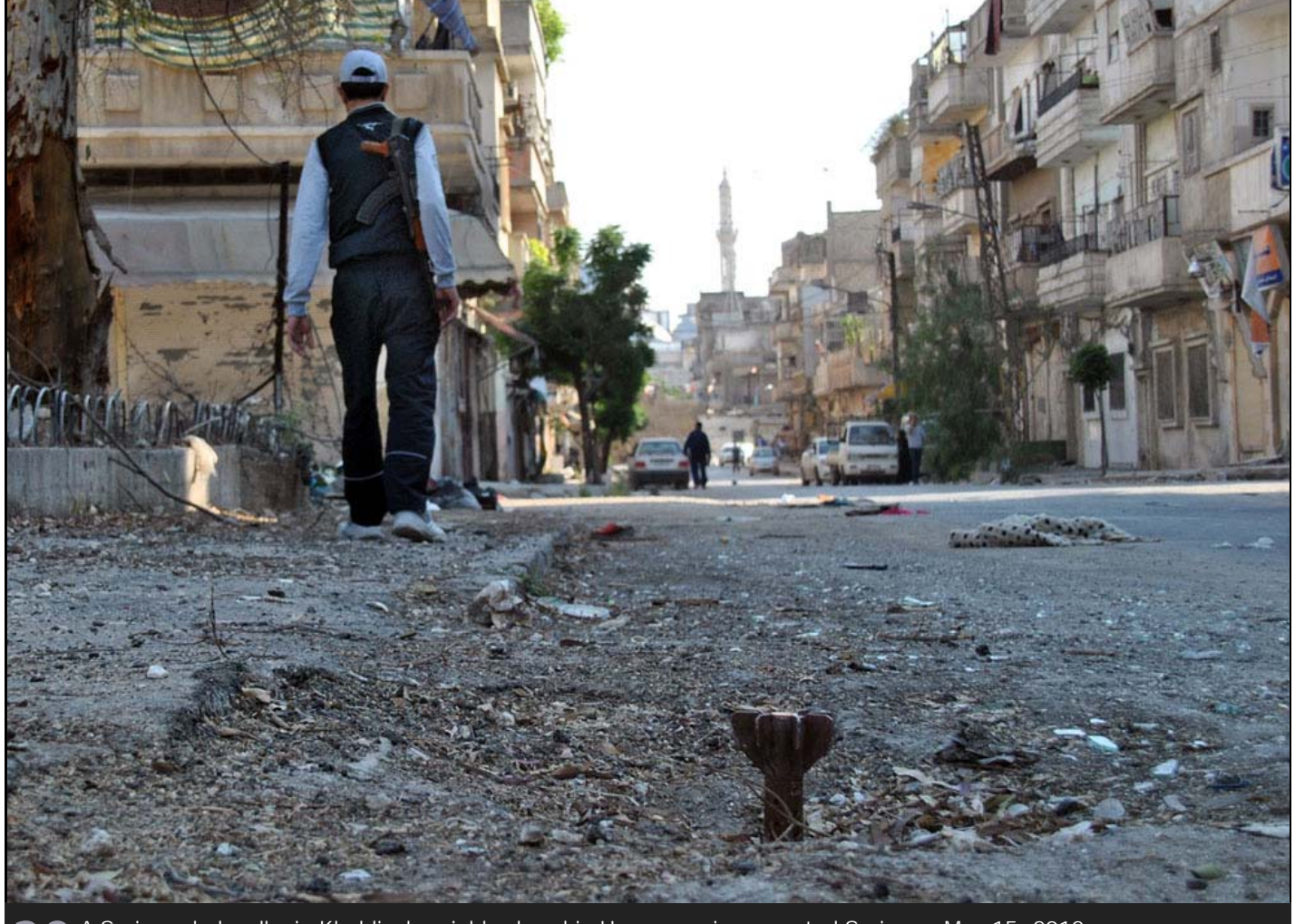
28 A Syrian rebel walks in Khaldiyeh neighborhood in Homs province, central Syria, on May 15, 2012. \underline{*} 다