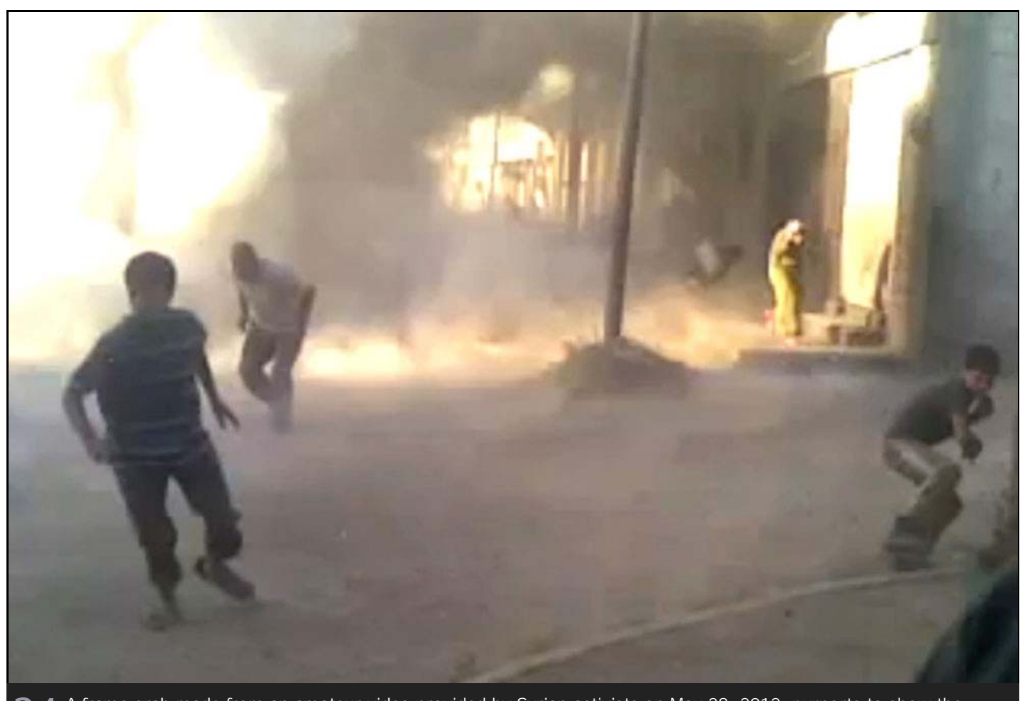
A frame grab made from an amateur video provided by Syrian activists on May 28, 2012, purports to show the massacre in Houla on May 25 that killed more than 100 people, many of them children. The amateur footage showed people running along a street, purportedly just after the attack on Houla started. # □