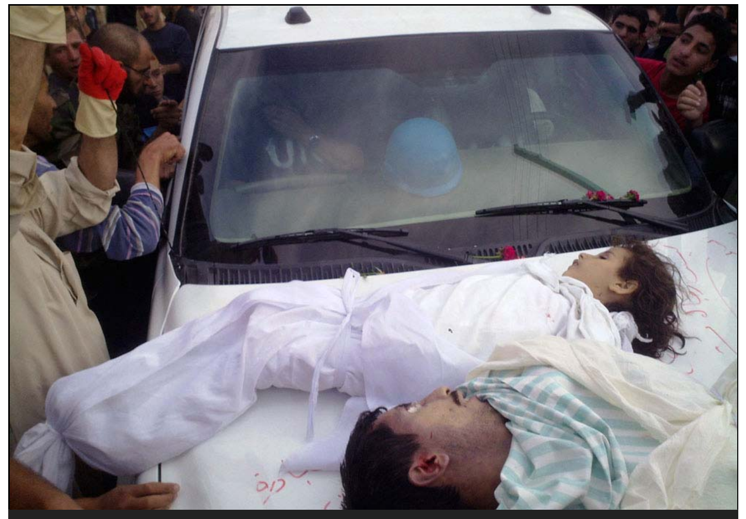
Dead bodies of a man and child that anti-government protesters say were killed by government security forces, are placed on a vehicle belonging to the United Nations observers' mission in Syria in Huola, on May 26, 2012. # [7]