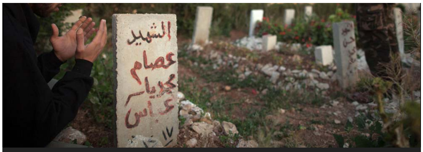
Members of the Free Syrian Army's Mugaweer (commandos) Brigade pay their respects in a cemetery in the town of Qusayr, that contains around 100 bodies of Syrians killed during the conflict, on May 12, 2012. # ☑