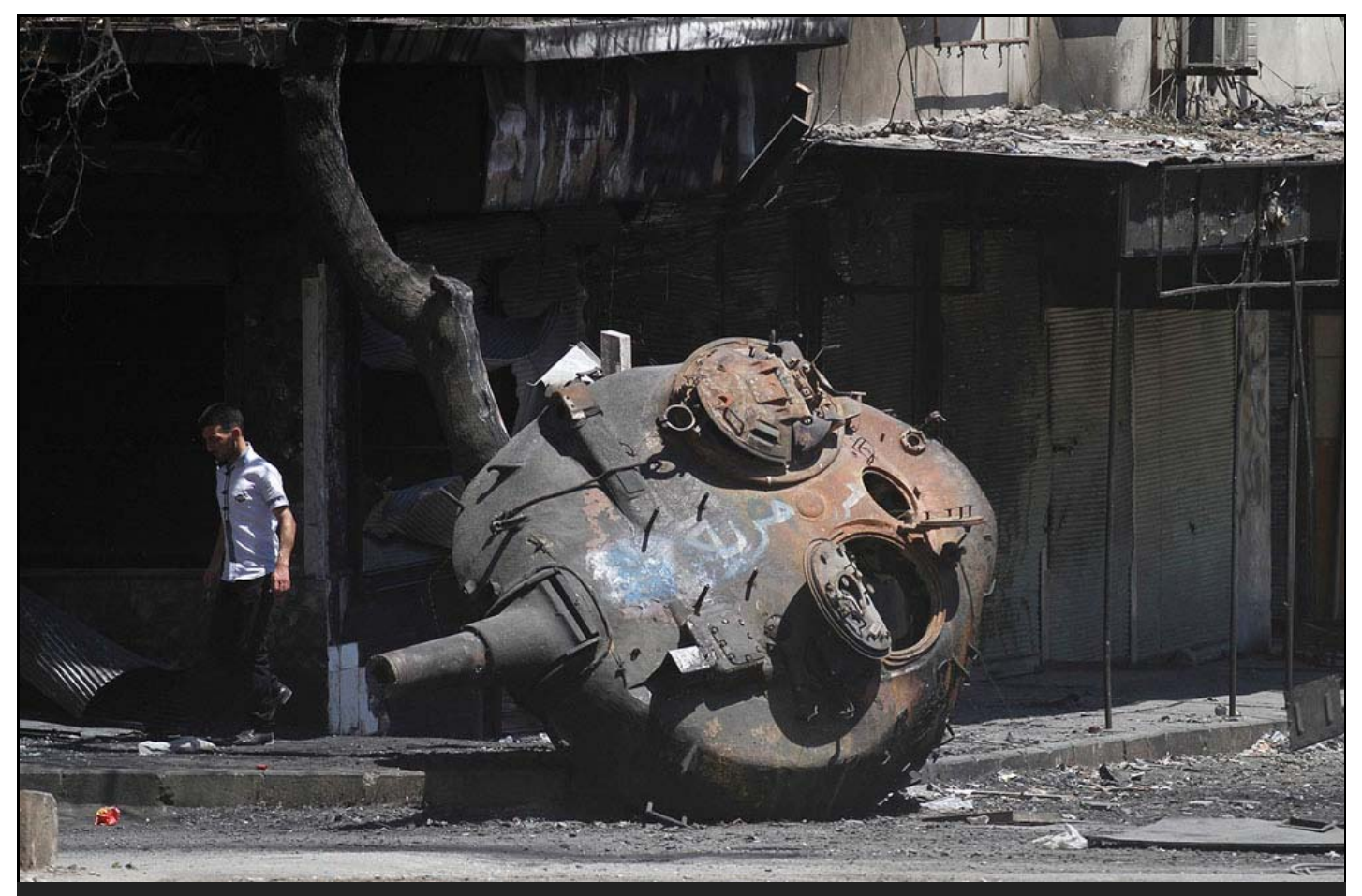
A Syrian man walks near part of a destroyed military tank with Arabic that reads, "freedom," at the northern town of Ariha, on the outskirts of Idlib, Syria, on June 10, 2012. \# \Box