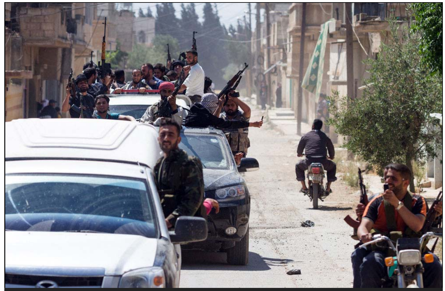
Member of the Free Syrian Army's "Freedom for the River Assi Brigade" return to Qusayr after an attack on Syrian regime forces in the village of Nizareer, on May 12, 2012. # \Box