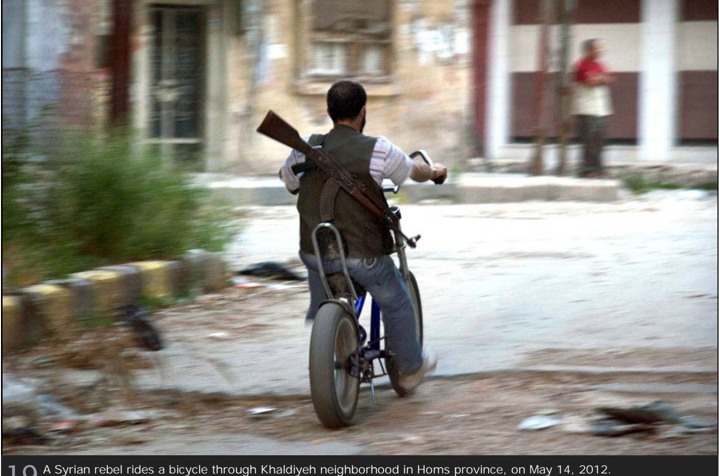
\underline{\mathbf{9}} A Syrian rebel rides a bicycle through Khaldiyeh neighborhood in Homs province, on May 14, 2012. \underline{\mathbf{\#}} \underline{\mathbf{r}}