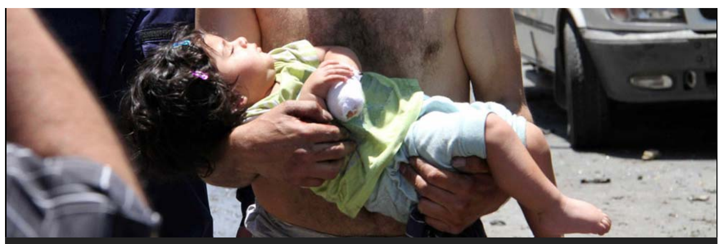
A Syrian man carries a wounded girl next to Red Crescent ambulances following an explosion that targeted a military bus near Qudssaya, a neighborhood of the Syrian capital, on June 8, 2012. At least seven people were killed in blasts near Damascus and in Idlib city in Syria's restive northwest, among them four security forces members, a watchdog group said. # 🗅