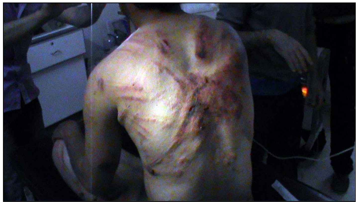
A Syrian man shows his injured back in the city of Rastan, north of the central restive city of Homs, on April 27, 2012, claiming that he was tortured by regime forces. (AFP/GettyImages) # □