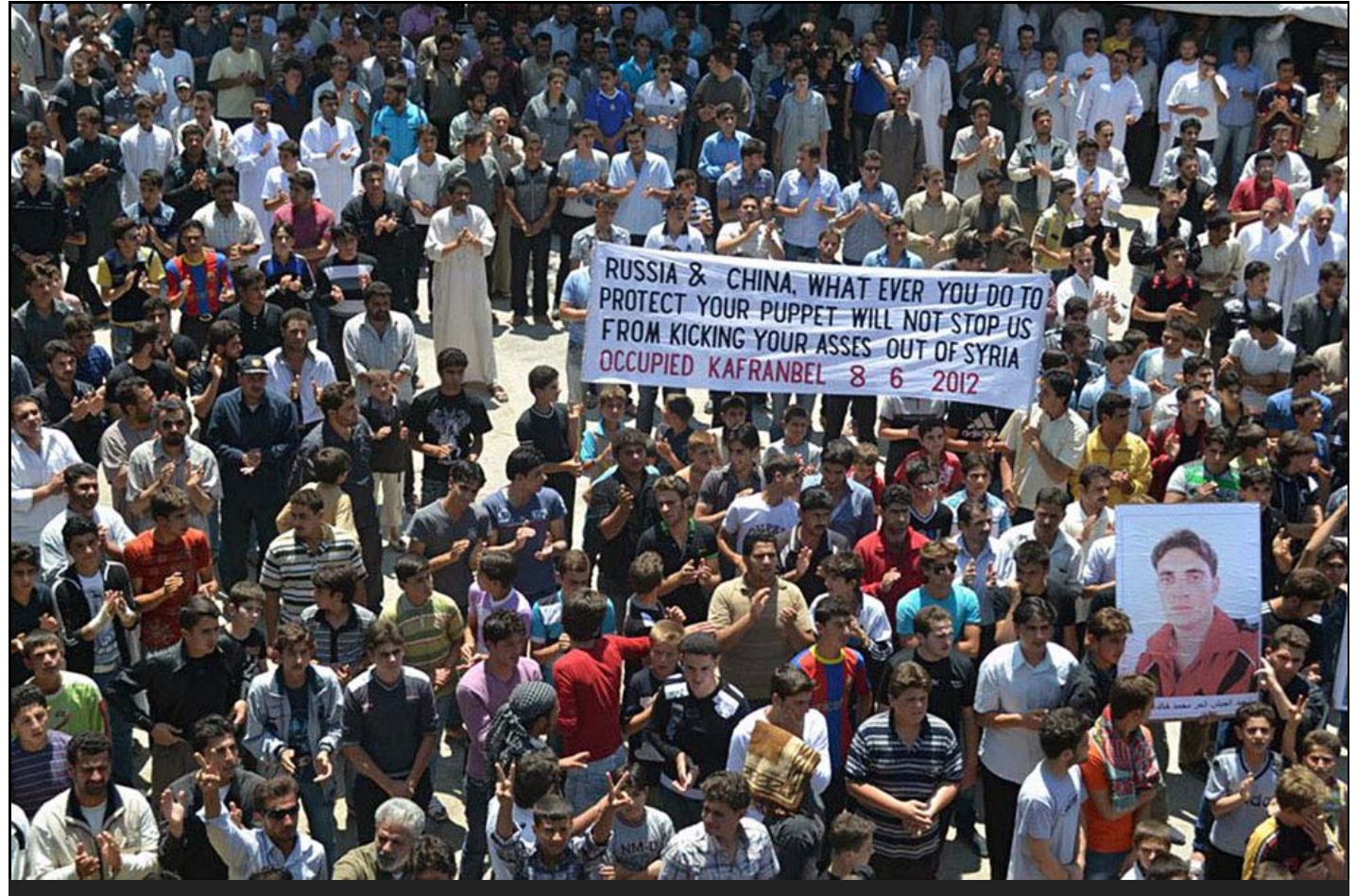
This citizen journalism image provided by Shaam News Network SNN, purports to show anti-Syrian regime protesters holding a banner and shouting slogans during a demonstration at the northern town of Kfar Nebel, in Idlib province, Syria, on June 8, 2012. # 🗅