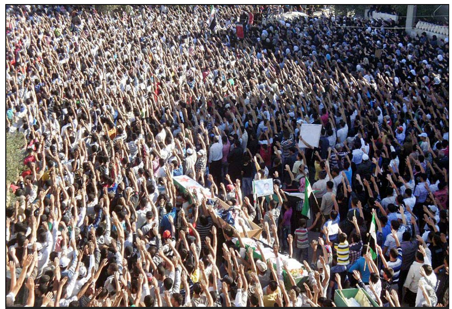
This citizen journalism image released by Sham News Network taken on June 9, 2012, purports to show anti-Syrian regime mourners raising their hands as they carry the coffins of Syrian citizens killed by Syrian troops, in Daraa, Syria. According to the Britain-based Syrian Observatory for Human Rights, tens died in heavy pre-dawn shelling on Saturday in Daraa, where the uprising against Assad began in March 2011. \# \ \Box