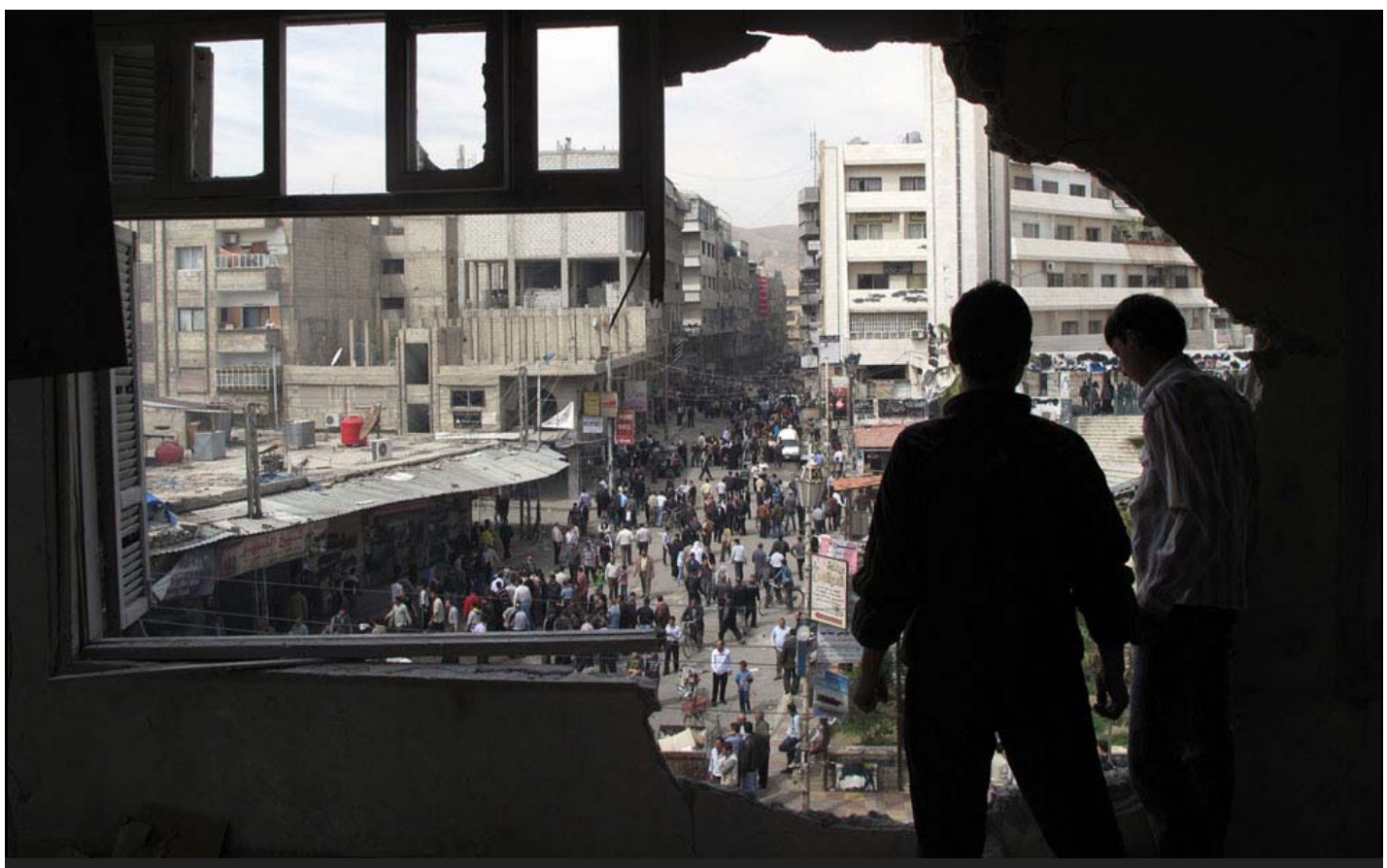
Syrian boys stand in a building damaged by tank shells in a neighborhood of Damascus, Syria, after a raid by Syrian troops killed several rebels and civilians on April 5, 2012. Syrian troops launched a fierce assault days ahead of a deadline for a U.N.-brokered cease-fire, with activists describing it as one of the most violent attacks around the capital since the uprising began. # []