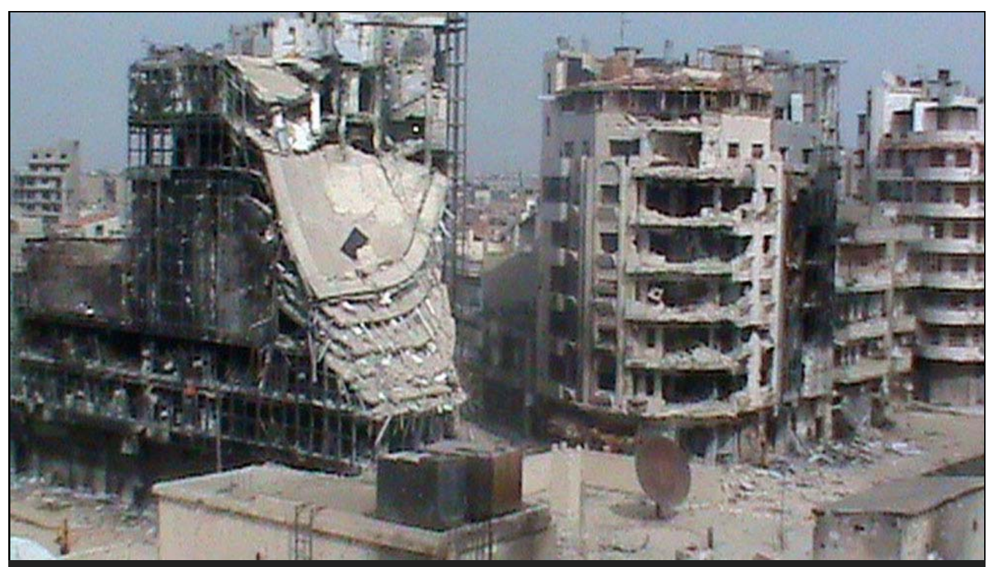
Buildings, which according to the opposition were damaged by Syrian government forces, in Homs May 4, 2012. # 다