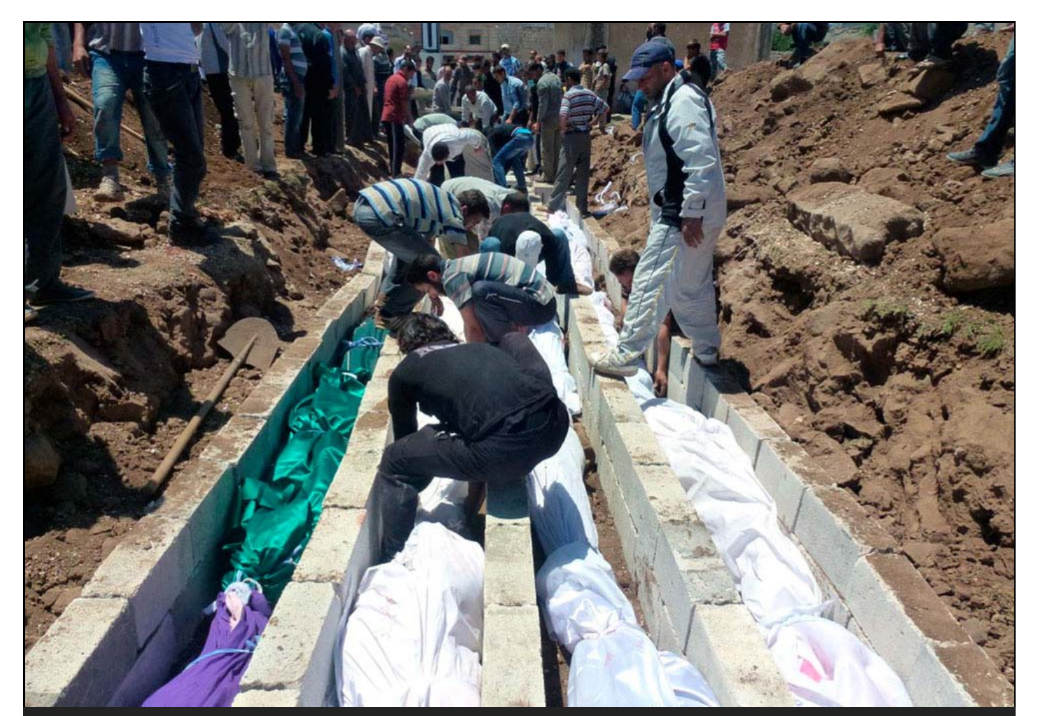
People gather at a mass burial for the victims purportedly killed during an artillery barrage from Syrian forces in Houla in this handout image dated May 26, 2012. U.N. observers in Syria have confirmed that artillery and tank shells were fired at a residential area of Houla, Syria, where at least 108 people, including many children, were killed, the U.N. chief said on Sunday in a letter to the Security Council. # 17