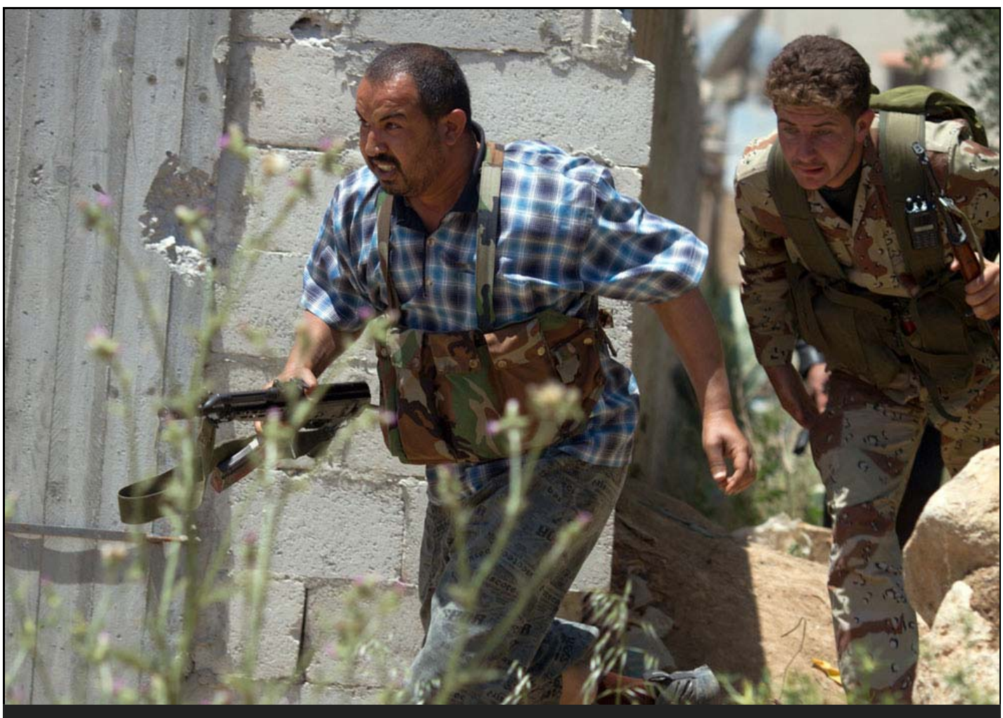
Members of the Free Syrian Army's "Freedom for the River Assi Brigade" run as they take part on an attack on Syrian regime forces in the village of Nizareer, near the Lebanese border in Homs province, on May 12, 2012. (AFP/Getty Images) # []