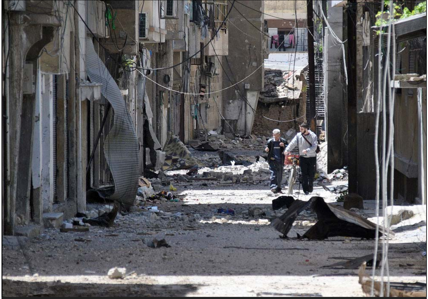
Syrians walk in a destroyed alley, damaged from Syrian army forces shelling, at Bab Sbaa neighborhood in Homs province, on April 21, 2012. #