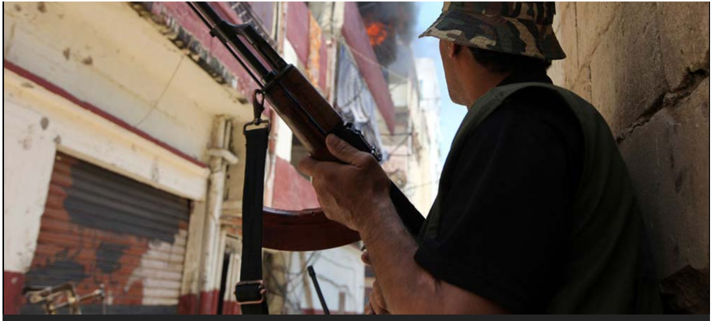
A Sunni gunman, near a burning building during clashes that erupted in the northern port city of Tripoli, Lebanon, Saturday, June 2, 2012. Gunbattles between pro- and anti-Syrian groups in northern Lebanon killed at least one person and wounded nine Saturday, security officials said, as activists reported fresh shelling of a region in central Syria that witnessed a massacre last week that killed tens of people. # [7]