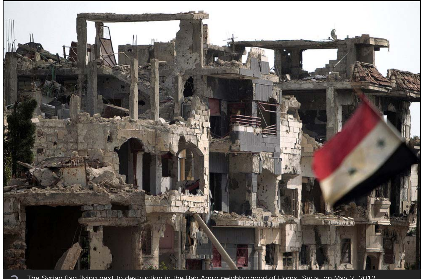
The Syrian flag flying next to destruction in the Bab Amro neighborhood of Homs, Syria, on May 2, 2012. # □

Birds fly over a destroyed minaret of a mosque at the northern town of Ariha, on the outskirts of Idlib, Syria, on June 10, 2012. An estimated 14,000 people have been killed since the uprising began in March last year.