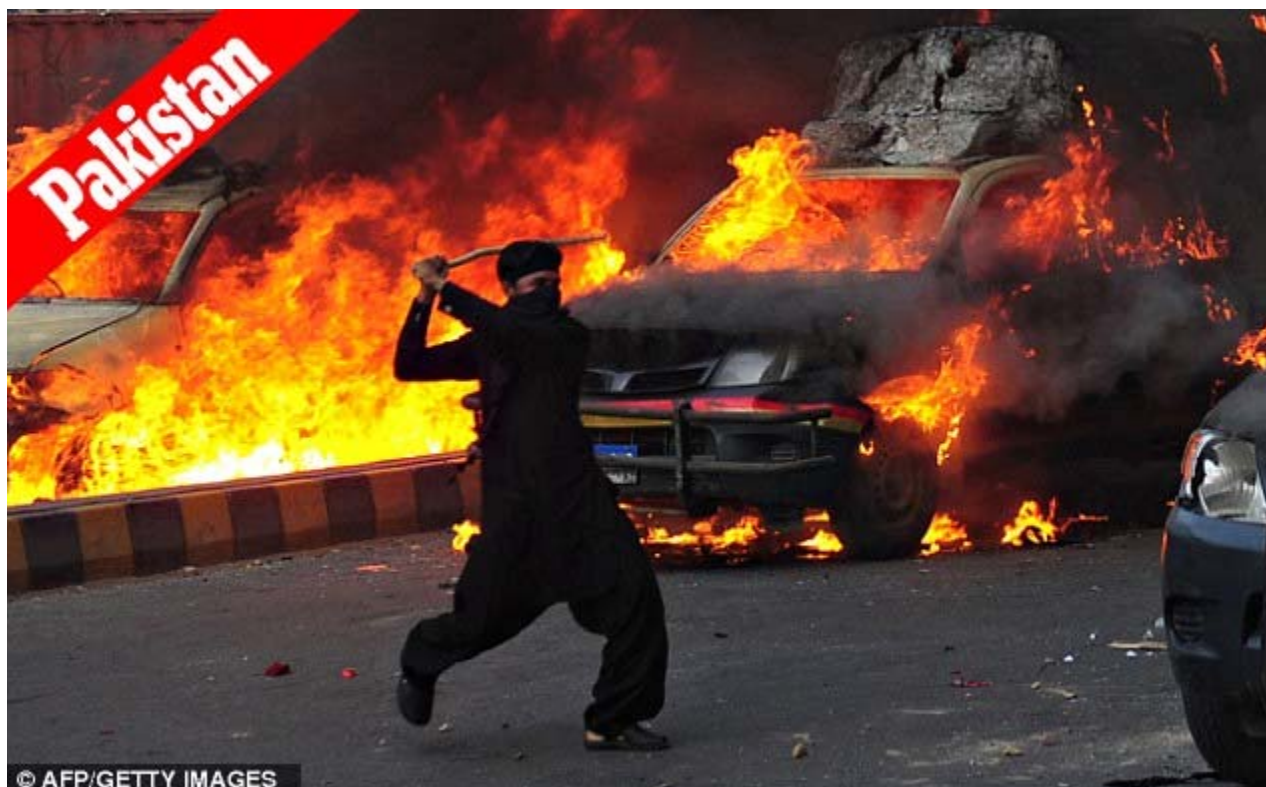
Flames of fury: A Muslim demonstrator brandishes a stick near burning police vehicles