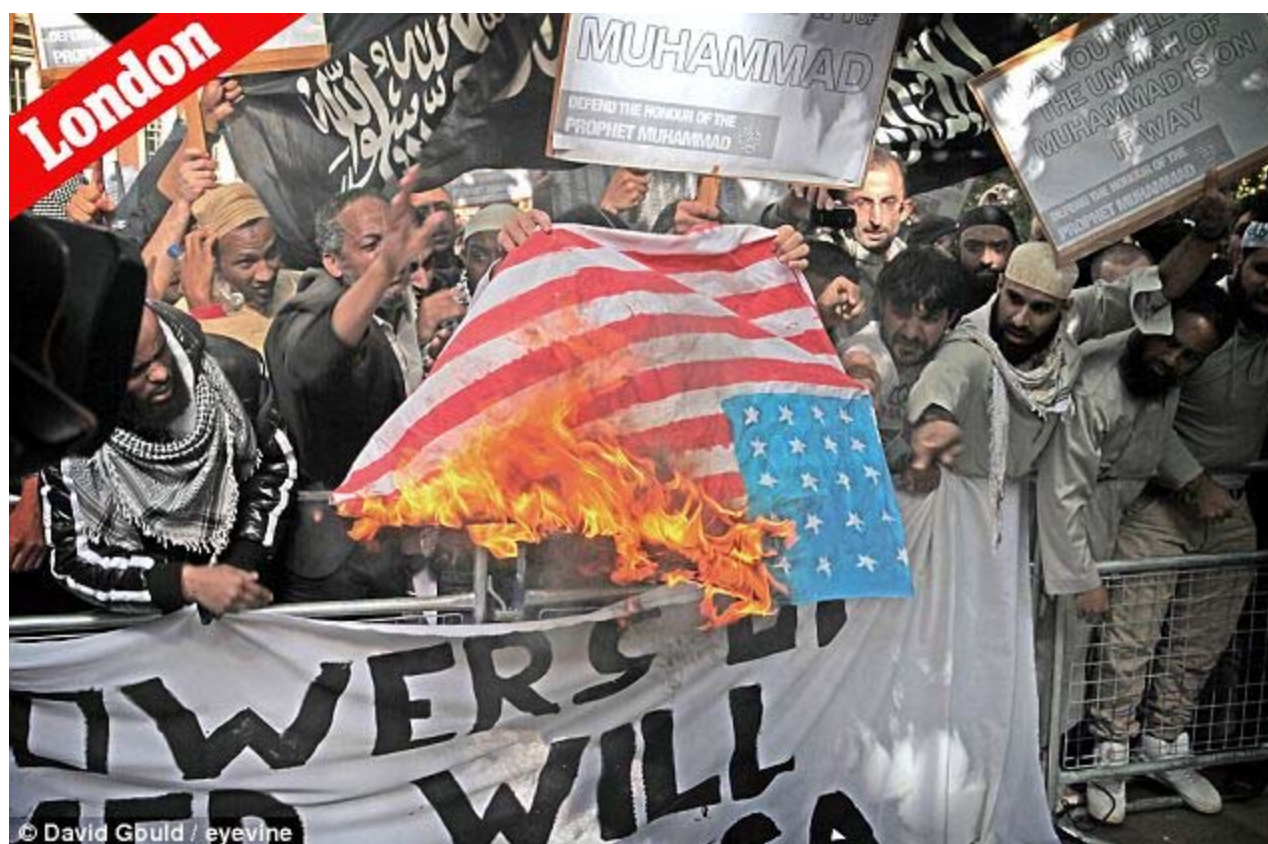
Peaceful turned fiery: Even the demonstration outside the American embassy in London was combustible