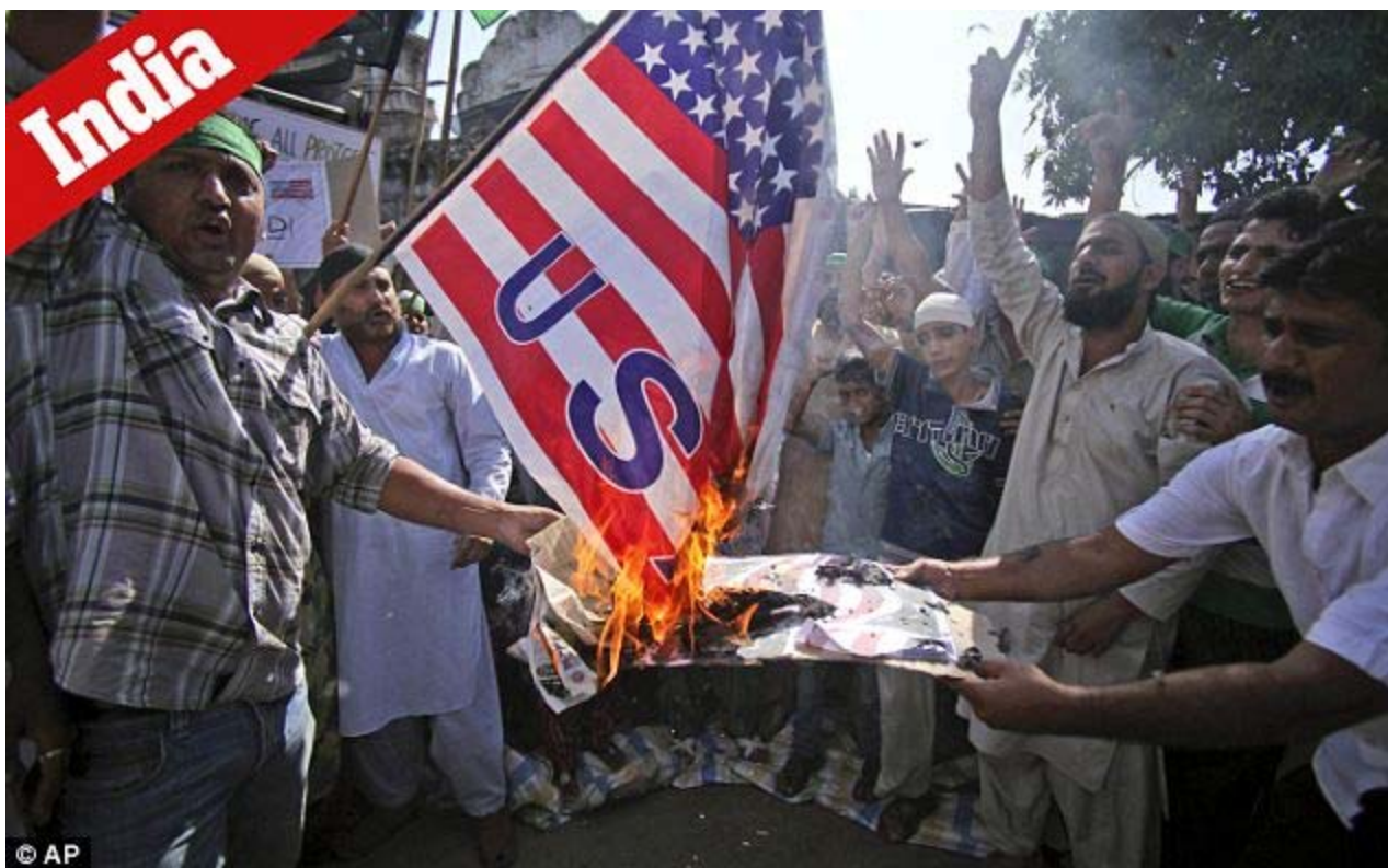
Volatile: The protests were sparked by a video called Innocence of Muslims which was made by an filmmaker in California, but it's reach has spanned the globe