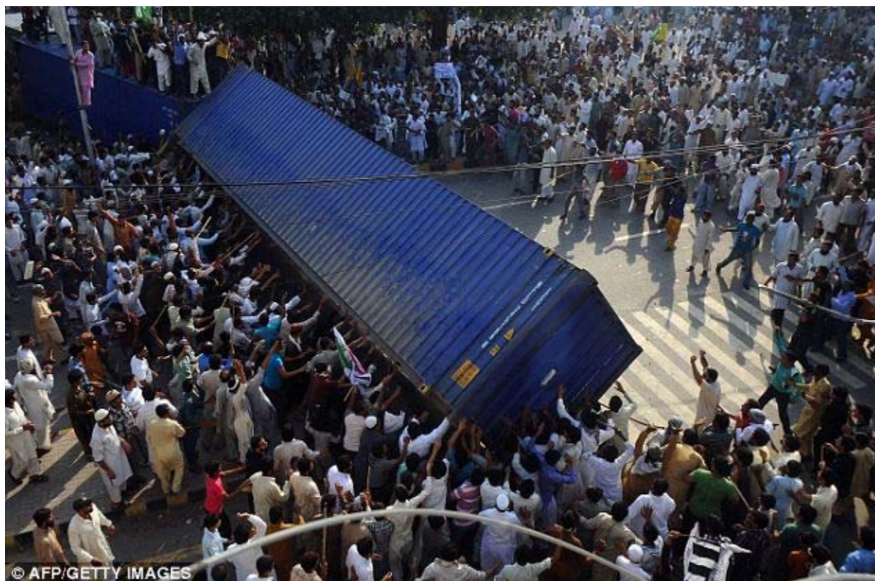
Toppling the barriers: The mass of people worked together to push down the freight containers set up by police