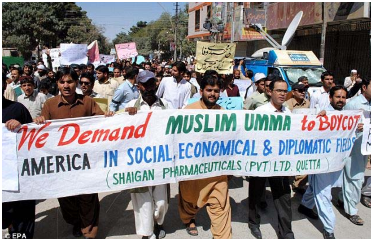
Cutting ties: Though American officials have said they will stay by their Middle Eastern allies, that support may be one-sided

She said embassy staffers had decided the ads were the best way to spread the word. The seven networks have a potential audience of 90 million people, she added.