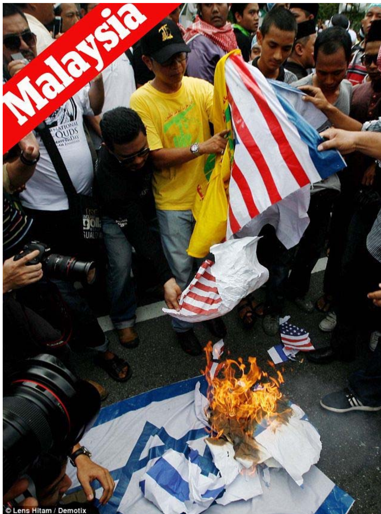
Allied targets: In Malaysia, Israel and the U.S. were both at the center of the protest