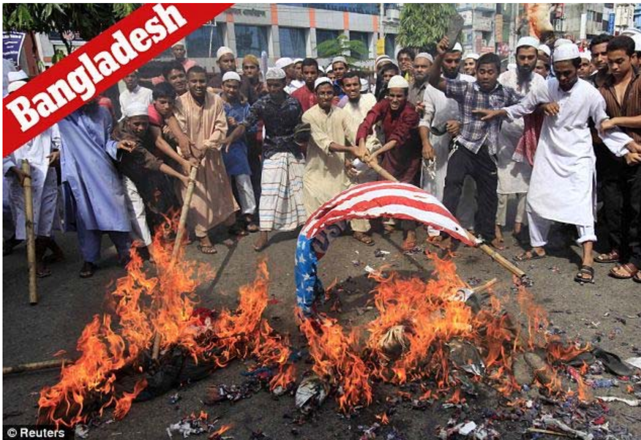
Fire starter: Protestors in Bangladesh targeted the American flag, as was seen in the demonstrations across the globe

during the protest against an anti-Islam film in Karachi