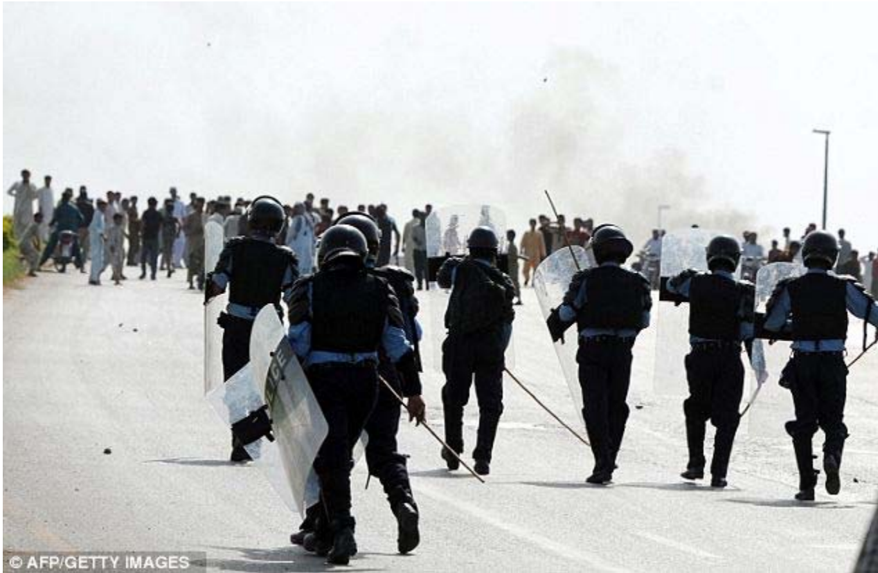
Preparing for the worst: Pakistani officials blocked all cell phone service in 15 cities to prevent would-be terrorists from detonating bombs remotely