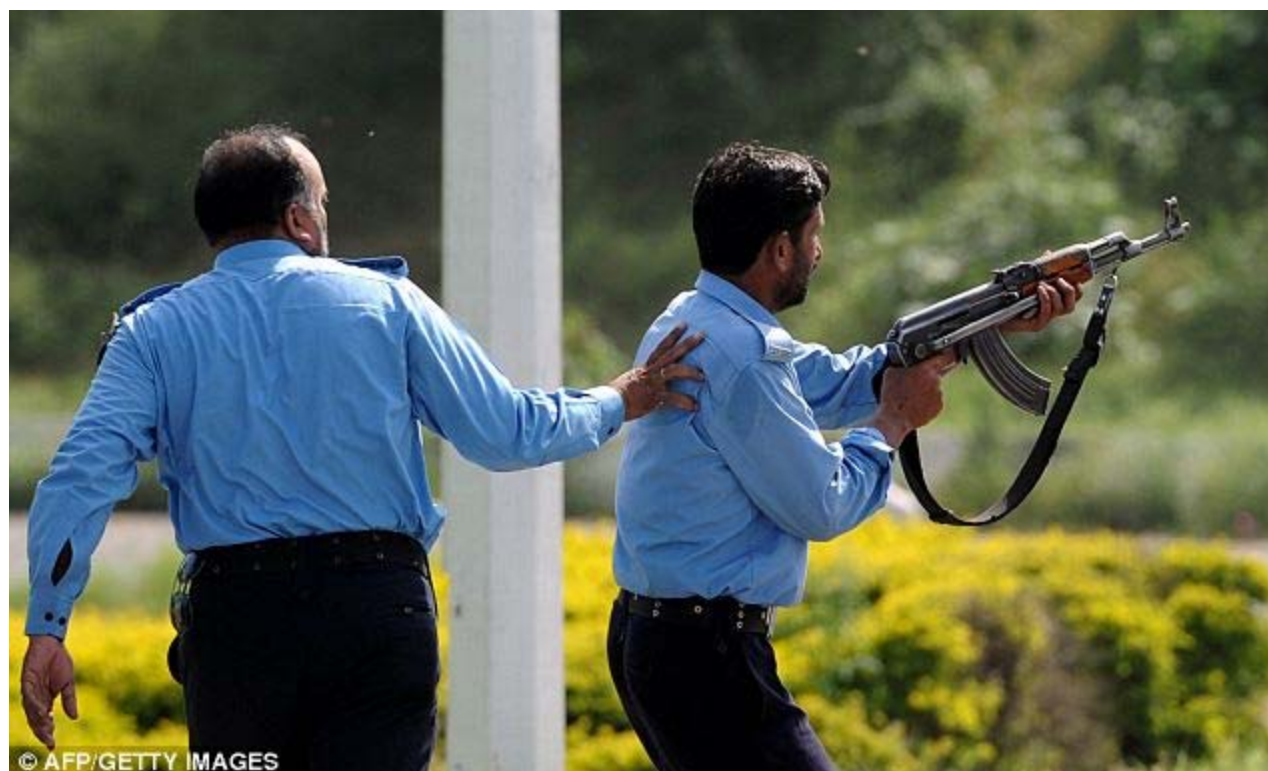
Taking fire: A Pakistani police officer fires into the crowd at an protest in Islamabad on Friday