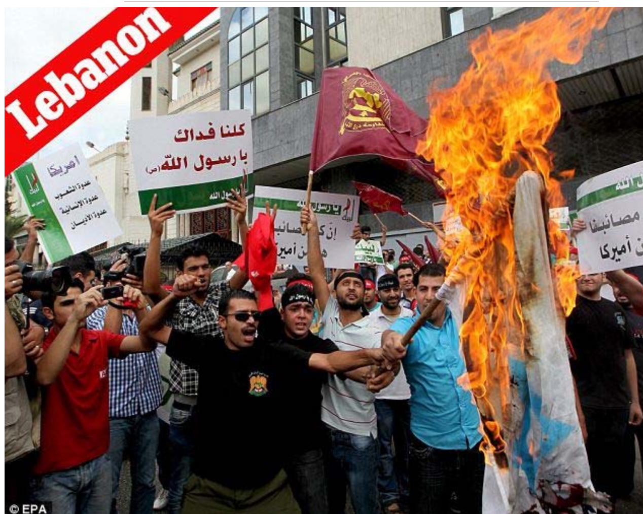
Fury: Young men burn an Israeli flag outside of a Mosque in Beirut, Lebanon