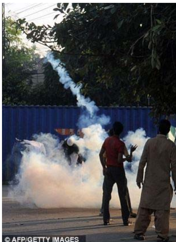
Deterrents: Protestors tossed tear gas over freight containers set up by police