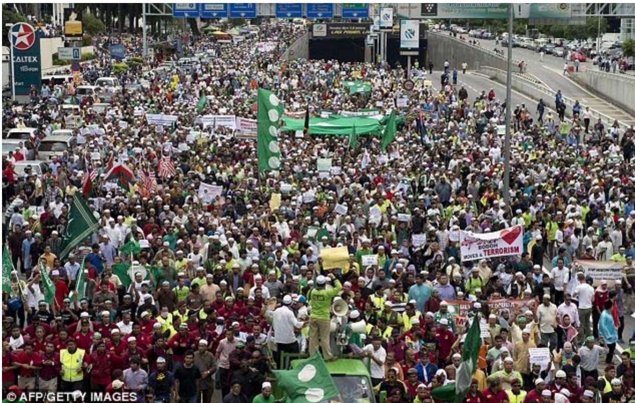
Taking to the streets: Thousands gather in Kuala Lumpur on Friday to demonstrate against anti-Muslim images

About 10,000 Islamists gathered in the Bangladeshi capital, Dhaka, after Friday prayers to chant anti-U.S. and anti-French slogans. They burned those countries' flags and an effigy of U.S. President Barack Obama.