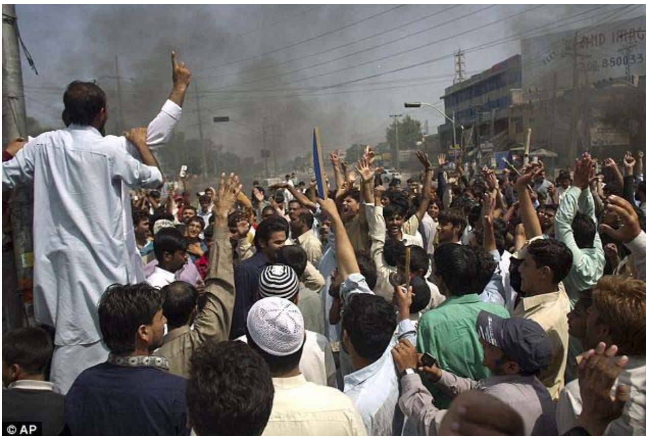
Tensions rising: The ad is aimed at protestors in Pakistan (seen above) who declared Friday to be a national day of protest, though it is called a 'special day of love' for the