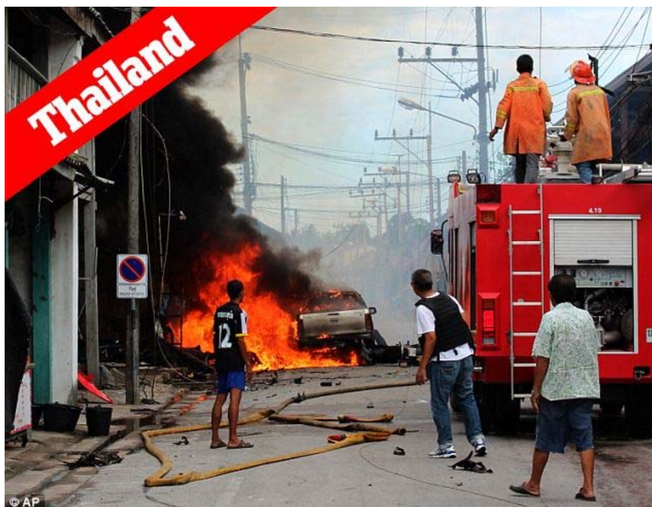
Death toll: Suspected Muslim insurgents have detonated a car bomb in Thailand's violence-prone south, killing five people and wounding a dozen others