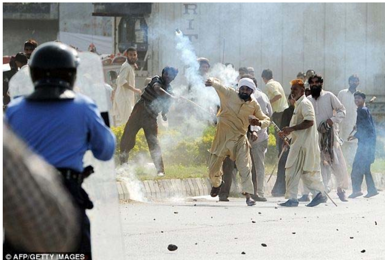
Dangerous: Two lives have been claimed in the protests in Pakistan (pictured today) but up to 30 people have died in instances relating to the protests globally

She said the so-called 'day of loving the prophet' would motivate the peaceful majority to demonstrate their love for Muhammad and not allow extremists to turn it into a show of anger against the United States.