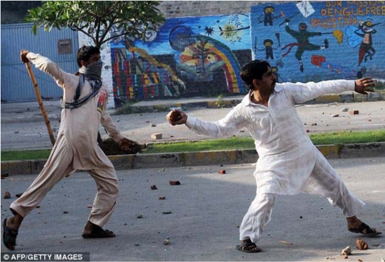
Violence: Two men throw sticks and stones in Lahore, Pakistan, where the death toll was up to 15 by early Friday evening