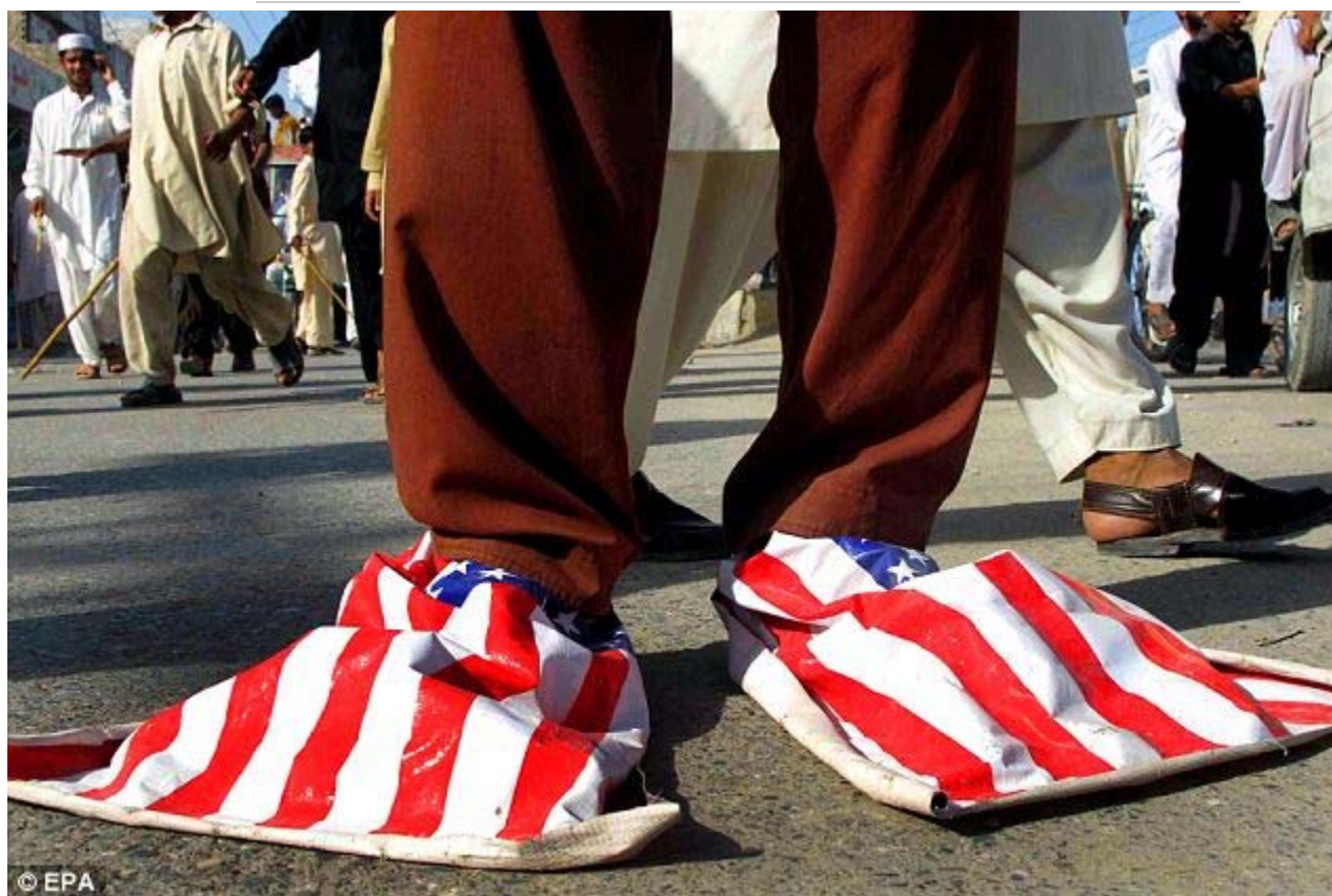
Disrespectful: The Pakistani protestor put the American flag where he feels it belongs