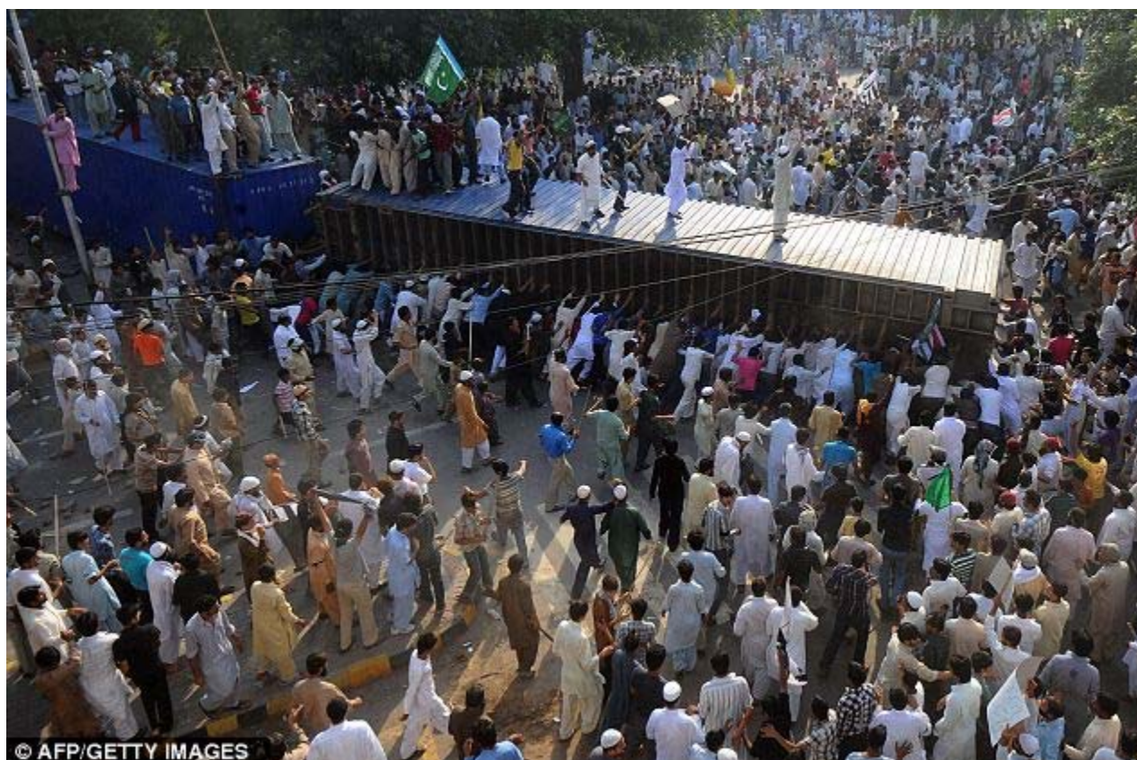
Achievement: The barricades were just one of the many precautions that police took to lessen the impact of the protesting crowds on Friday, including shutting down cell phone service in 15 major cities

Condemning the publication of the cartoons in France as an act verging on incitement, Egypt's Grand Mufti Ali Gomaa said on Thursday it showed how polarised the West and the Muslim world had become.