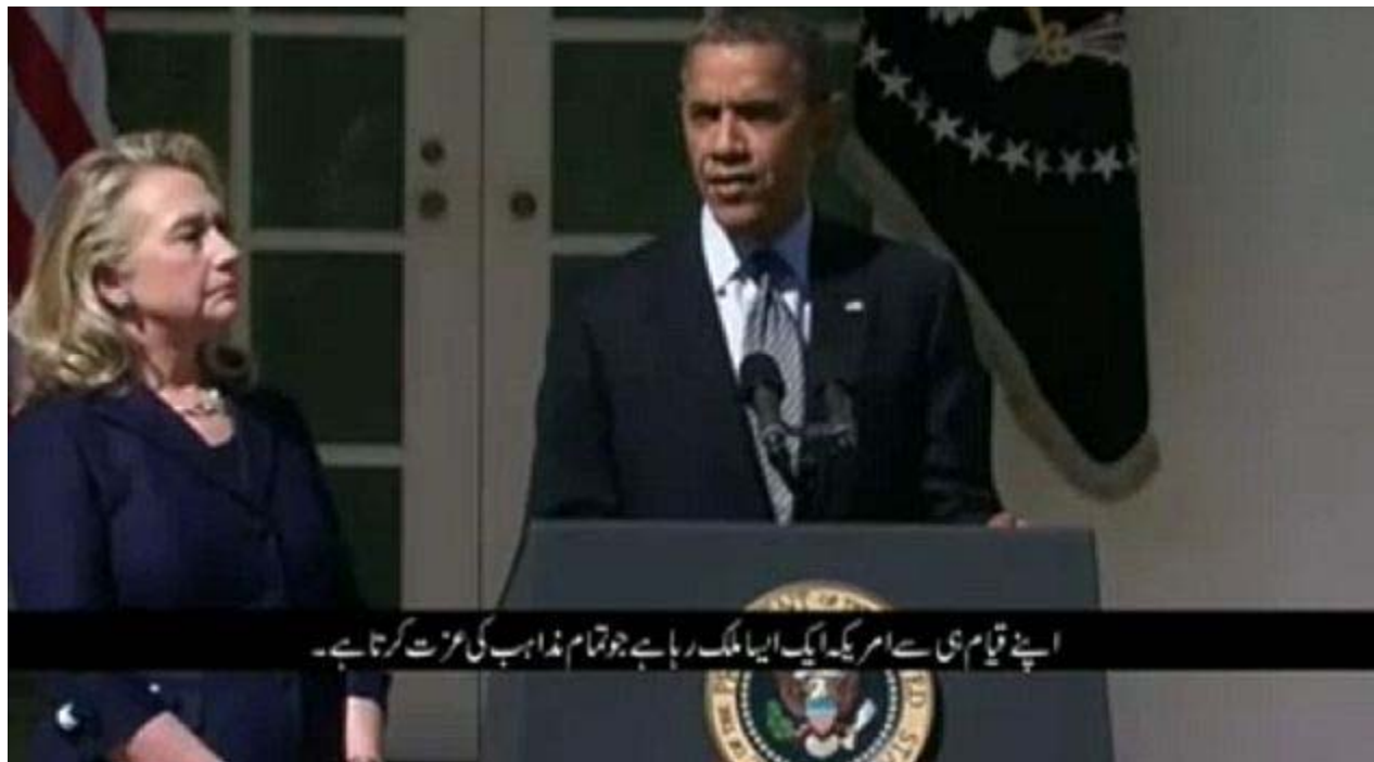
Making the message clear: The minute-long video shows two clips from public statements made by President Obama (right) and secretary of state Hillary Clinton (left) condemning the Innocence of Muslims film

'We absolutely reject its content and message,' Clinton says in the advertisement.