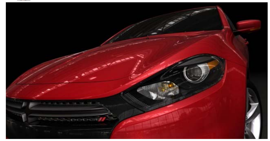
2013 Dodge Dart Compact Sedan