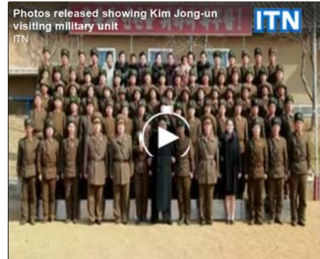
Photos released showing Kim Jong-un visiting military unit