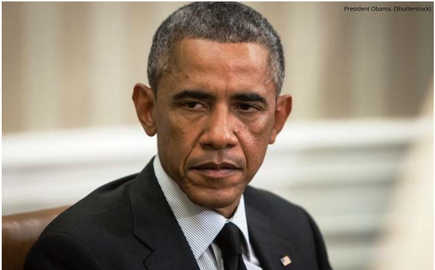
President Obama.

United with Israel The Global Movement for Israel™