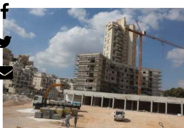
Israeli building in Jerusalem.

Israel’s Ha’aretz first reported that following Obama’s growing frustration with Israel the Obama administration held secret internal meetings to discuss taking action against Israel for its ongoing building in Jerusalem. The meetings were attended by officials from both the State Department and White House.