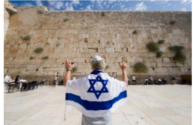
Sign the Jerusalem Declaration Today!