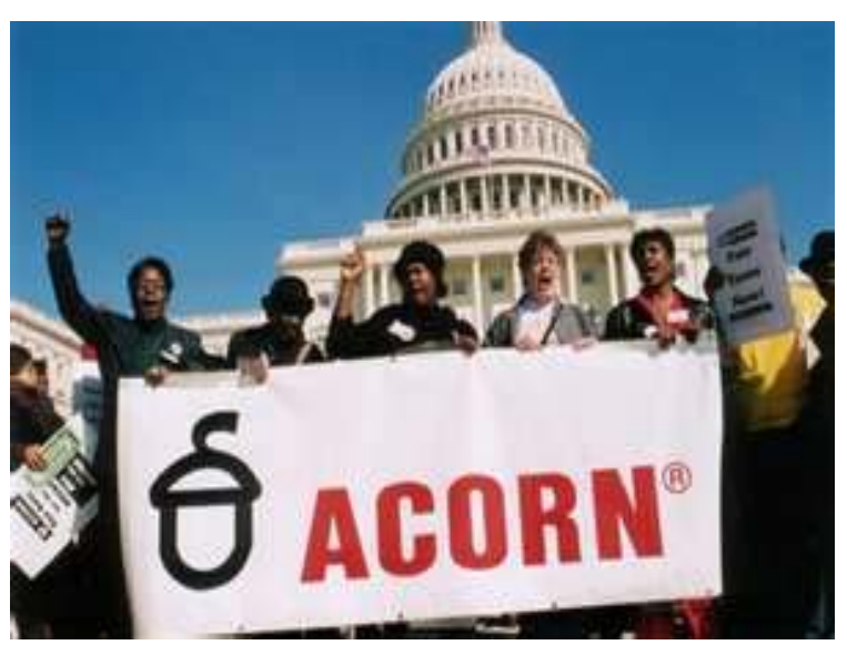
by MIKE FLYNN (/COLUMNISTS/MIKE-FLYNN) | 4 Apr 2013 | 187 | POST A COMMENT (/BIG-GOVERNMENT/2013/04/03/HHS-REST KRECTS-ACORN-THROUGH-OBAMACARE#COMMENTS) VIEW DISCUSSION