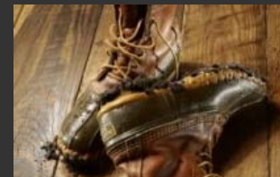
How L.L. Bean Became Fashion's Hottest Company