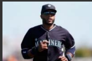
The MLB All-Stars To Keep Off Your Fantasy Team

As the private valuations of ride-sharing service Uber soar, the ranks of the 2015 Midas List are changing fast.