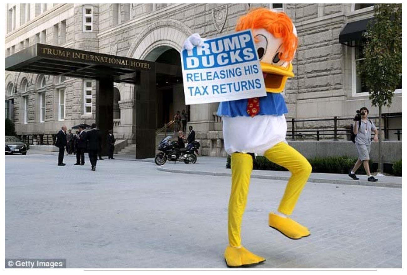
The Americans United for Change-sponsored Donald Duck lookalike mascot has trolled Donald Trump outside campaign events and his real estate properties for months. In this photo, the duck protests outside the newly opened Trump International Hotel in Washington