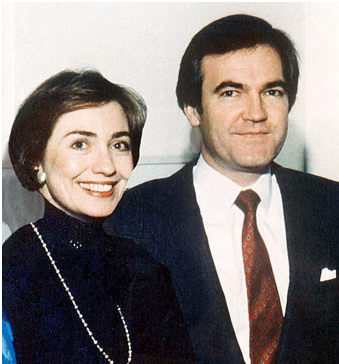
Vince Foster (left with Hillary), Bill's Deputy White House Counsel, had been a childhood friend of Bill's and a former partner of Hillary's at the Rose Law Firm. He was aware of all the Whitewater secrets

Hillary pushed Foster to end the fifty-day standoff during between the Branch Davidians and the federal and Texas state law enforcement in Waco, Texas in 1993.