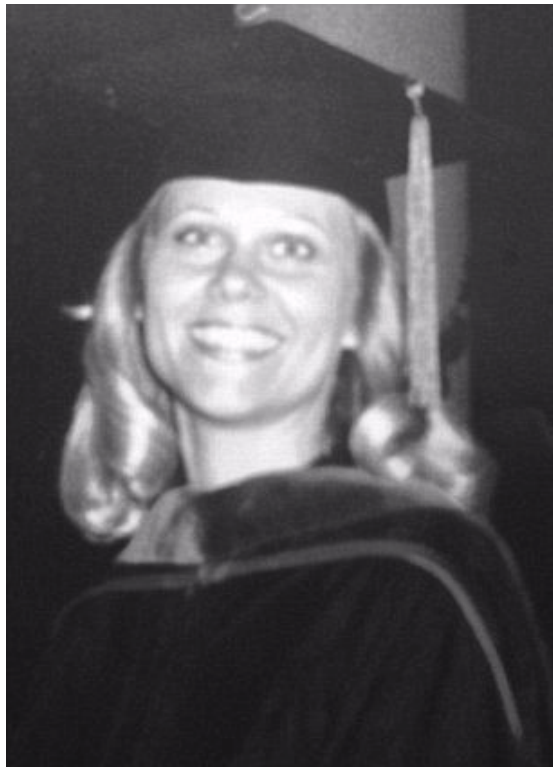
Dolly dated Bill through high school and began sleeping with him once they graduated

Behind the Reverend Jesse Jackson's back, the Clinton duo called him, 'That G**damned n****r'.