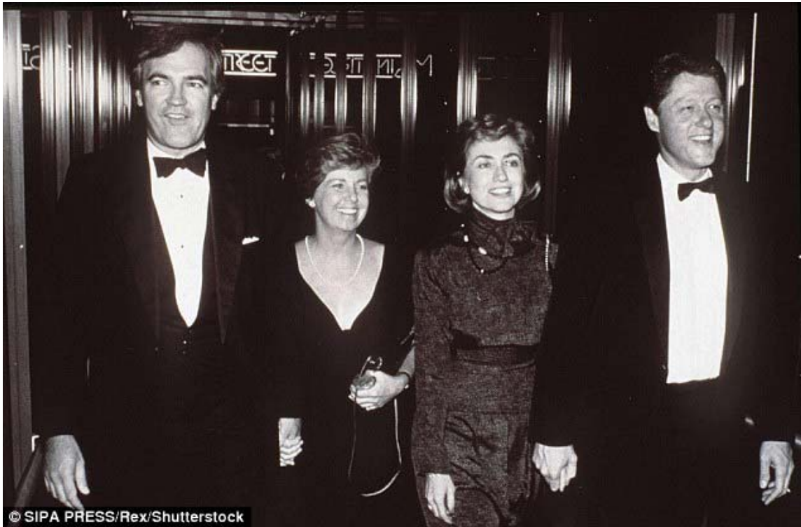
Foster (pictured with his wife, Hillary and Bill) was found dead in Fort Marcy Park off the George Washington Parkway in Virginia on July 20, 1993. His death was ruled a suicide

Seventy-four men, women and children died a violent death, and Foster was devastated.