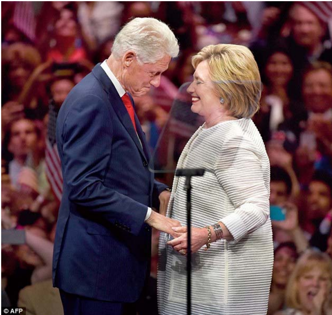
Dolly says Hillary (pictured with Bill on Tuesday) was caught on record blurting out the terms 'stupid k**e' and 'f***ing Jew bastard', while Bill called the Reverend Jesse Jackson a 'G**damned n****'

She writes of one occasion, when developmentally challenged children were having difficulty picking up the eggs at a traditional Easter egg hunt on the grounds of the governor's mansion during Bill's tenure in the Arkansas state house.