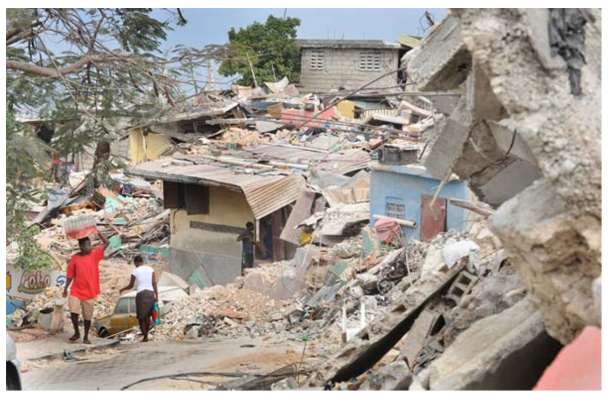
Port-au-Prince, Haiti, homes destroyed by the January 2010 earthquake in which 222,570 people were killed, 300,000 injured and 1.3 million displaced. An estimated 97,924 houses were destroyed and 188,383 damaged in Port-au-Prince

Instead, Osorio used the funds to live an extravagant lifestyle and pay for illegal business schemes.