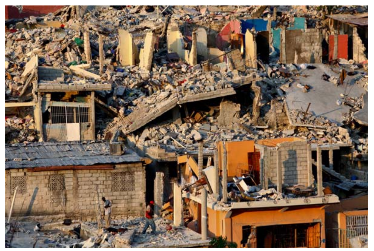
Port-au-Prince, Haiti, homes destroyed by the January 2010 earthquake in which 222,570 people were killed, 300,000 injured and 1.3 million displaced. An estimated 97,924 houses were destroyed and 188,383 damaged in Port-au-Prince