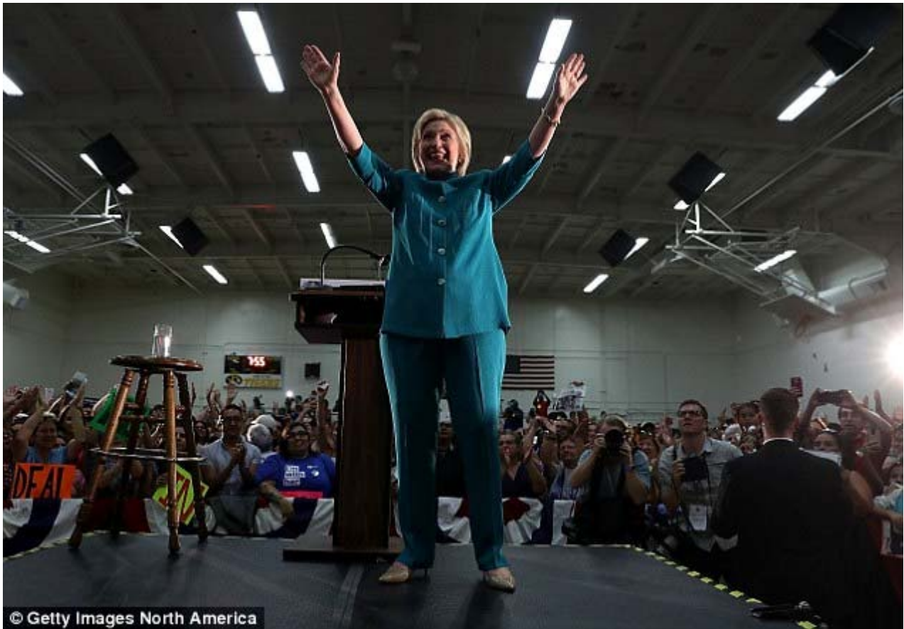
His expose is reportedly causing deep concern in the White House and its release comes as Hillary comes within touching distance of securing the Democratic nomination

It reveals how both current and former agents strongly dislike being on Mrs Clinton's detail, while also revealing how they felt about protecting Chelsea Clinton and Bill Clinton.