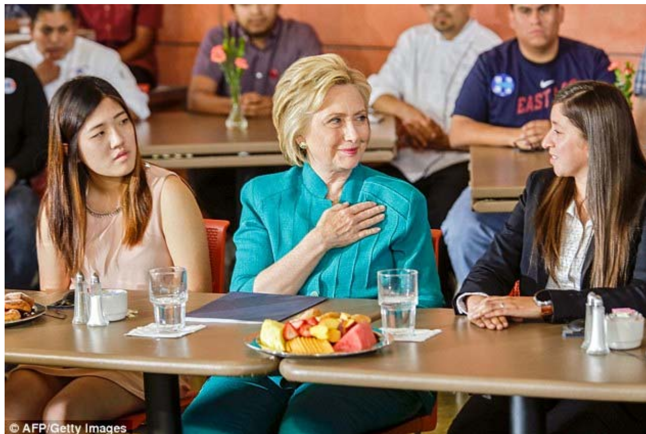
Hillary Clinton is braced for an expose from a Secret Service agent who protected her during Bill's 1990s administration. She is pictured during a campaign event in California on Saturday ahead of the primary