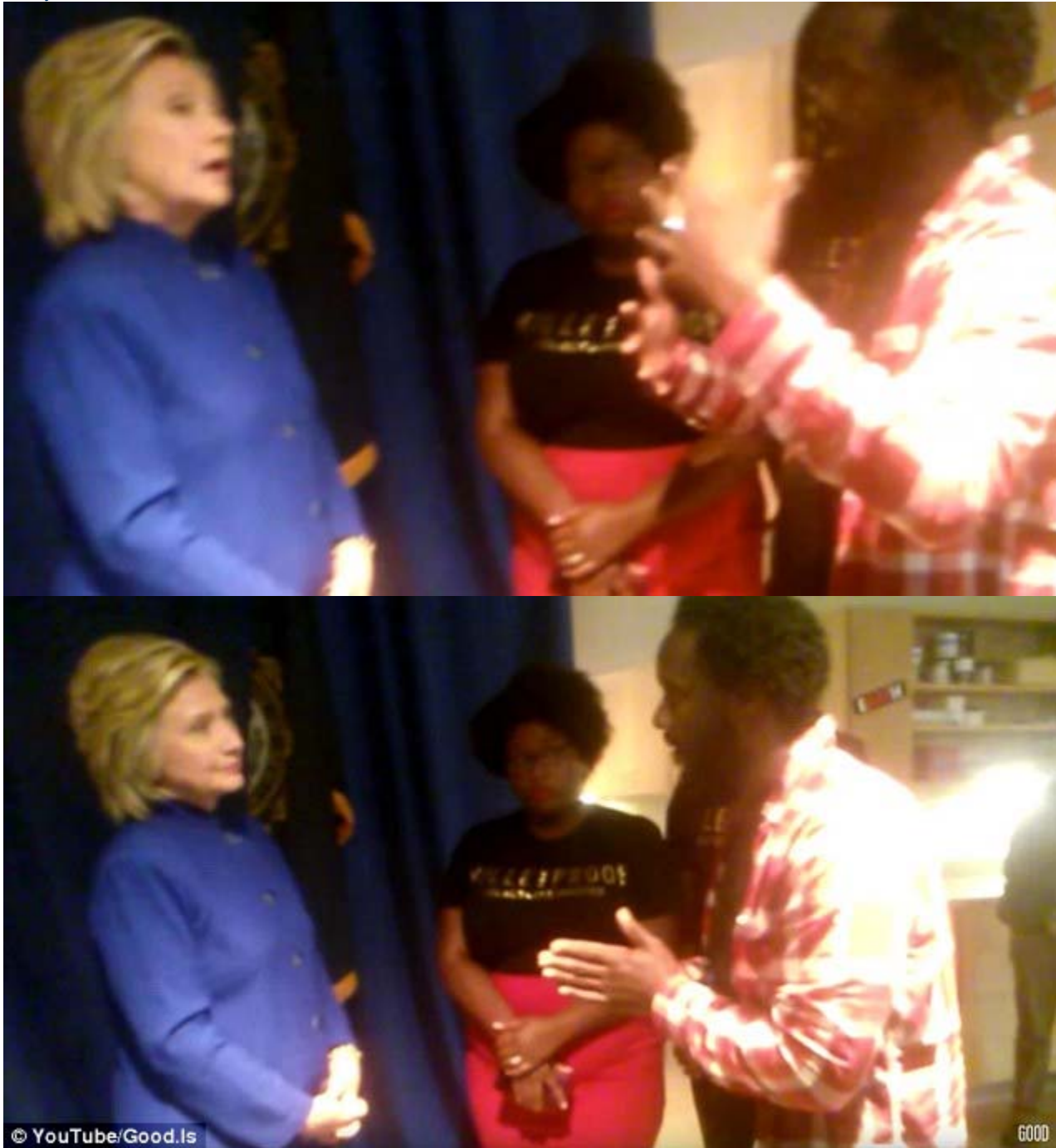
Hilary Clinton's tense confrontation with Black Lives Matter