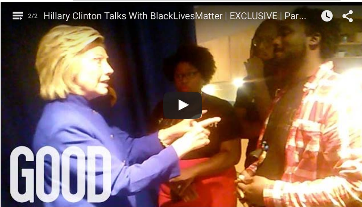
The Black Lives Matter activists confronted Clinton backstage after a campaign event in New Hampshire on August 11

The tense discussion began when Clinton was questioned on her current stance of ending mass incarceration. In the 1990s, she called for stronger sentences and more prisons.