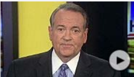
Huckabee: The real polarization problem in America