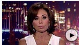
Judge Jeanine: The president is playing a dangerous game