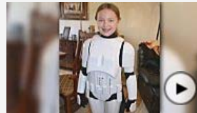
Girl gives custom-made Star Wars stormtrooper suit to bullied student