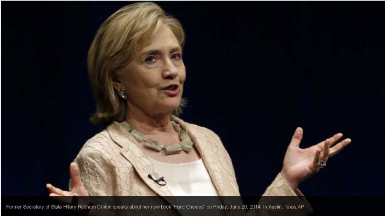
Former Secretary of State Hillary Rodham Clinton speaks about her new book "Hard Choices" on Friday, June 20, 2014, in Austin, Texas.

Hillary Clinton, who has a net worth upwards of $50 million, said in an interview that she is "unlike a lot of people who are truly well off."