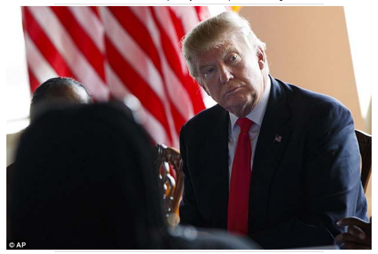
Republican Donald Trump, who participated in a roundtable discussion Friday, said Clinton's answers 'defy belief'

WHICH ONE IS THIS? Clinton had no fewer than 13 wireless devices, it was revealed – but the FBI wasn't able to acquire any of them as part of its investigation