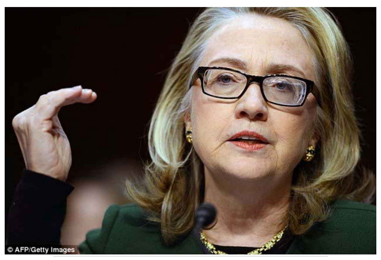
20-20 HINDSIGHT: Clinton has expressed regret for her private email server in interviews. But when she spoke to the FBI, she said there were multiple aspects of the email setup she could not recall

Another passage states that the FBI 'found that 17,448 emails were not included in the State Department's release of emails' - meaning they didn't get turned over for review.