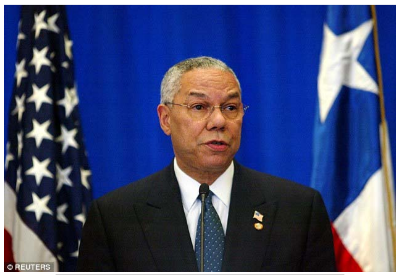
Keep it out of public records: Powell told Clinton to 'be very careful' because the work-related emails she sent on her BlackBerry could become public record, she revealed

Clinton told investigators she was unfamiliar even with basic markings of confidential materials, such as the (C) markings that denote confidential material portions of emails.