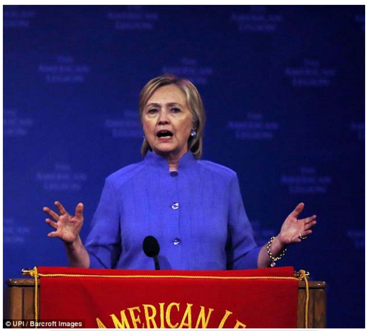
'CANNOT RECALL': Hillary Clinton appears to have repeatedly deployed a bewildering answer to the FBI's questions in an interview that was not recorded or conducted under oath