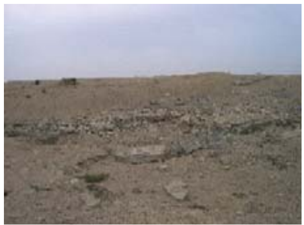
Destroyed former HMX bunker at Al Qa'qa'a.