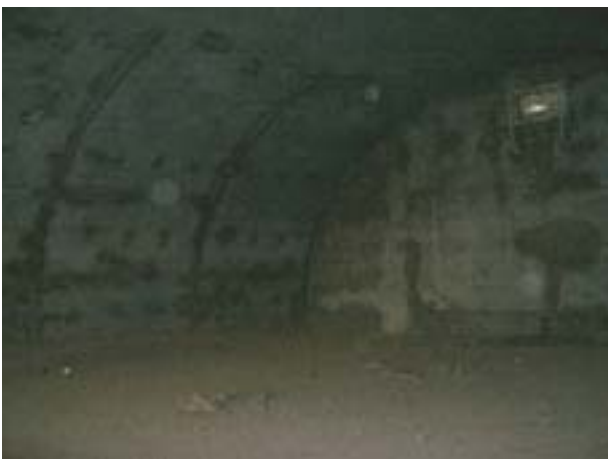
Intact, empty former HMX bunker at Al Qa'qa'a.