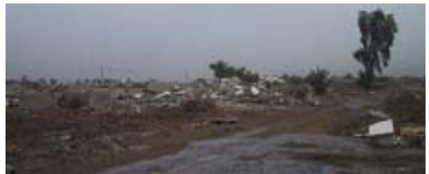
Destroyed Al Raya State Company.