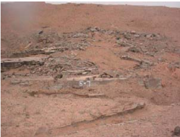
Destroyed Al Qa'qa'a bunker that, according to IAEA, contained RDX/PETN prior to OIF.