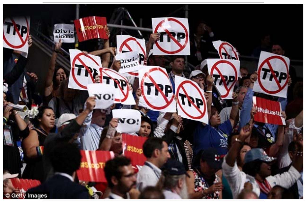
Storm of protest: The theme inside the hall was supposed to be party unity - but Bernie Sanders supporters stood up waving placards and booed every mention of Hillary Clinton's name.

She described the 'Hillary standard' as 'unfounded, inaccurate, mean-spirited attacks with no basis in truth...reality, which take on a life of their own.'