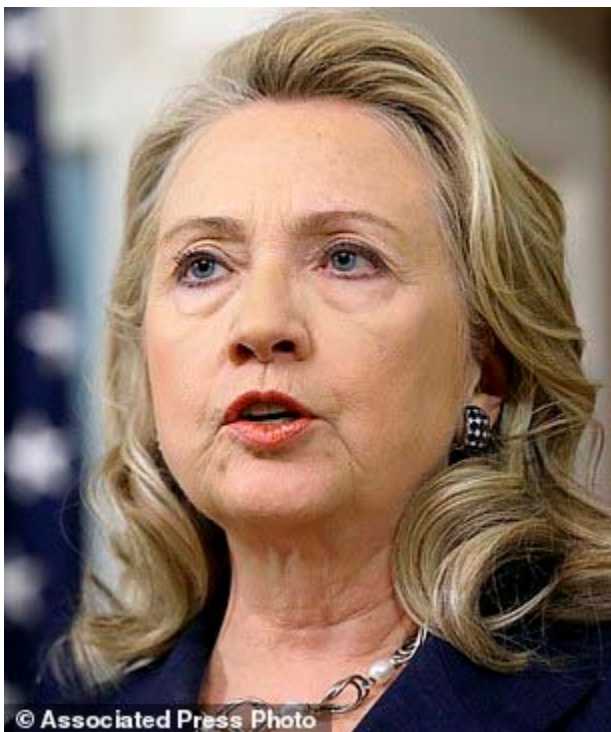
Hillary Clinton, pictured in 2012. The presumptive presidential candidate for the Democrats, used a personal email account when Secretary of State, rather than a government-issued email address

Published: 03:17 EST, 4 March 2015 | Updated: 08:44 EST, 4 March 2015