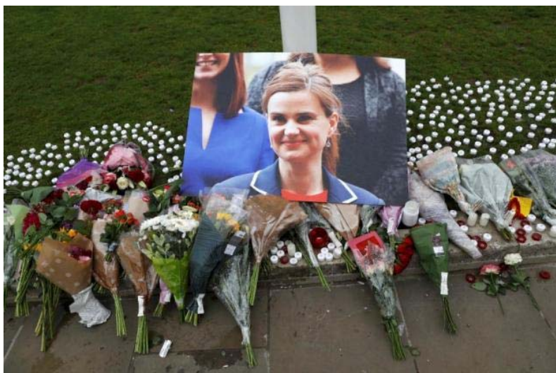
Tributes and candles left for murdered Labour Member of Parliament Jo Cox are seen in Parliament Square, London, Britain June 17, 2016

Britain mourned lawmaker Jo Cox on Friday after a man wielding a gun and knife killed the 41-year-old mother-of-two in a brazen street attack that has thrown the June 23 referendum on European Union membership into limbo.