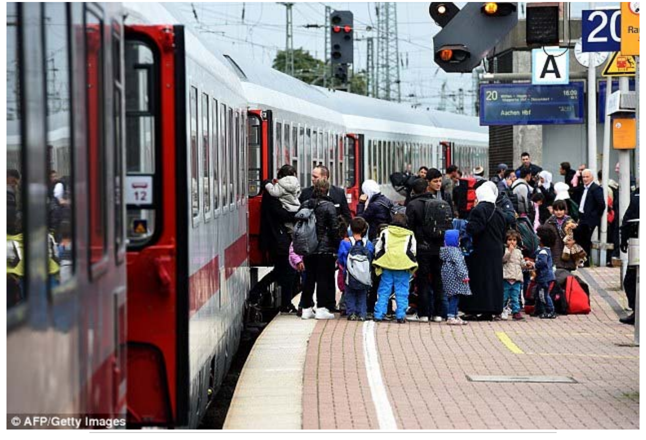
Spread around the country: Migrants are pictured arriving at the train station in Dortmund, western Germany