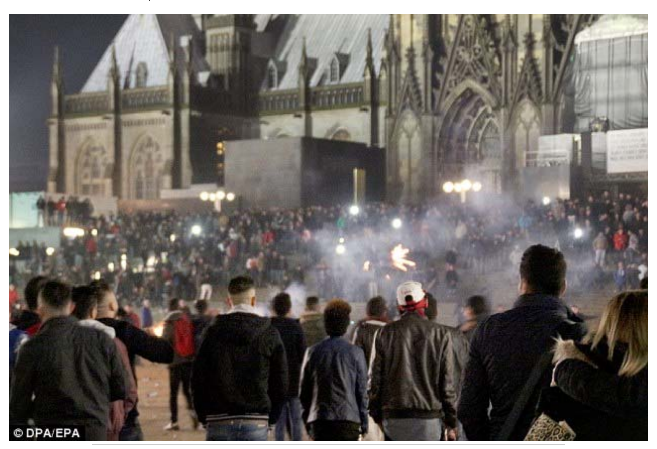
Police in Munsterland in North Rhine-Westphalia today carried out a series of raids as part of the ongoing investigation into the Cologne New Year sex attacks. Pictured is Cologne cathedral on December 31

That means more than 600,000 are unaccounted for.