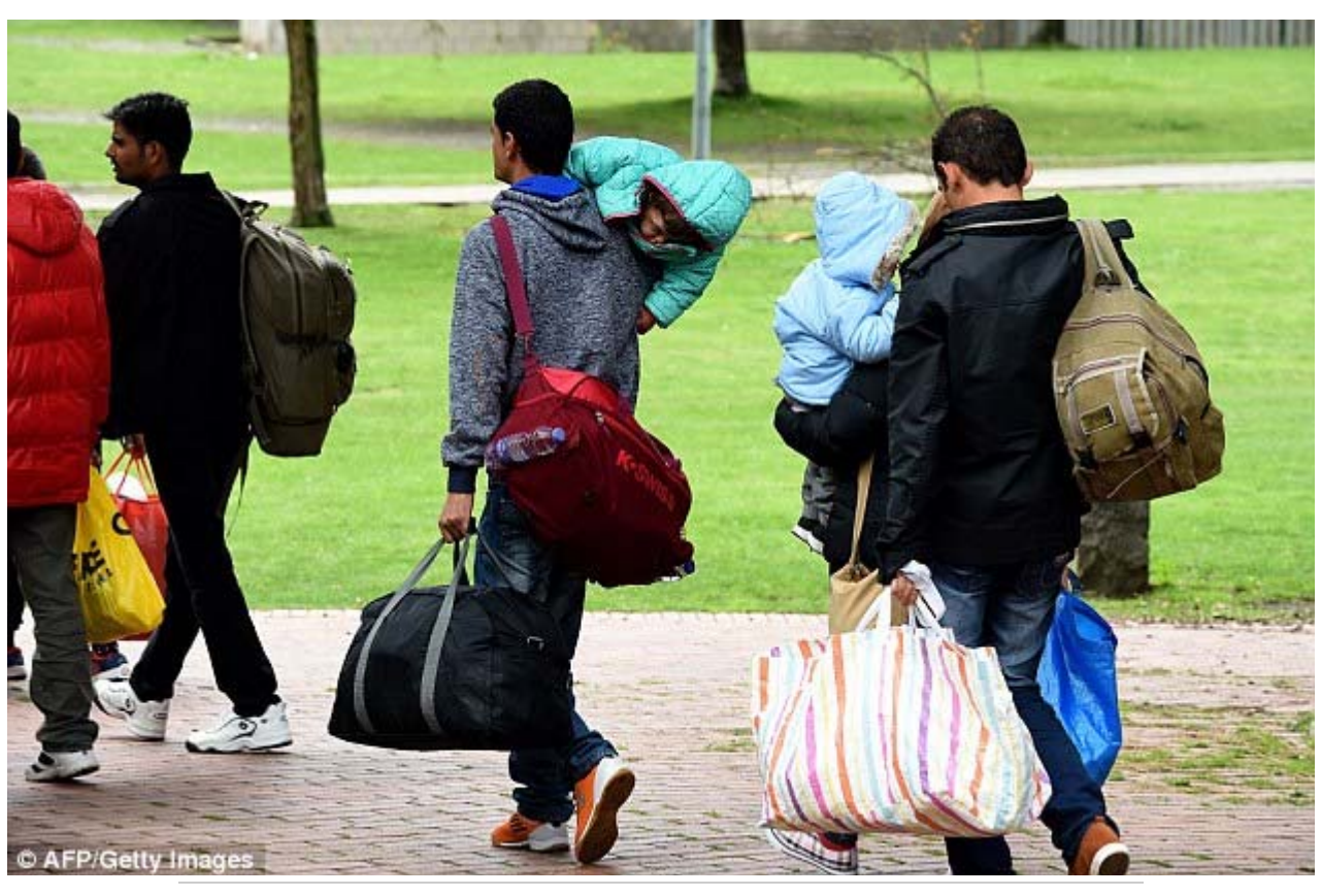
In the dark: The German government is unable to say where more than half of the one million asylum seekers allowed into the country have ended up. Migrants are pictured walking to get a bus after arriving in Dortmund