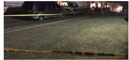
Scene outside a Woodbridge, Va. home where a 'domestic-related incident' led to three officers being shot.