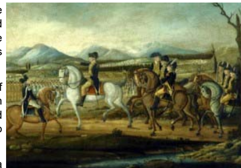
A painting of President George Washington leading a force of federalized state militias against the Whiskey rebels in western Pennsylvania in 1794.

In the late Eighteenth Century, the meaning of "bearing" arms also referred to a citizen being part of a militia or army. It didn't mean that an individual had the right to possess whatever number of high-capacity killing machines that he or she might want. Indeed, the most lethal weapon that early Americans owned was a slow-loading, single-fired musket or rifle.