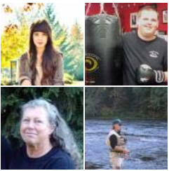
Scenes of chaos follow deadly shooting at Umpqua Community College in Oregon

In contrast, terrorism killed 28 Americans per year on both U.S. soil and abroad according to the Global Terrorism Database.